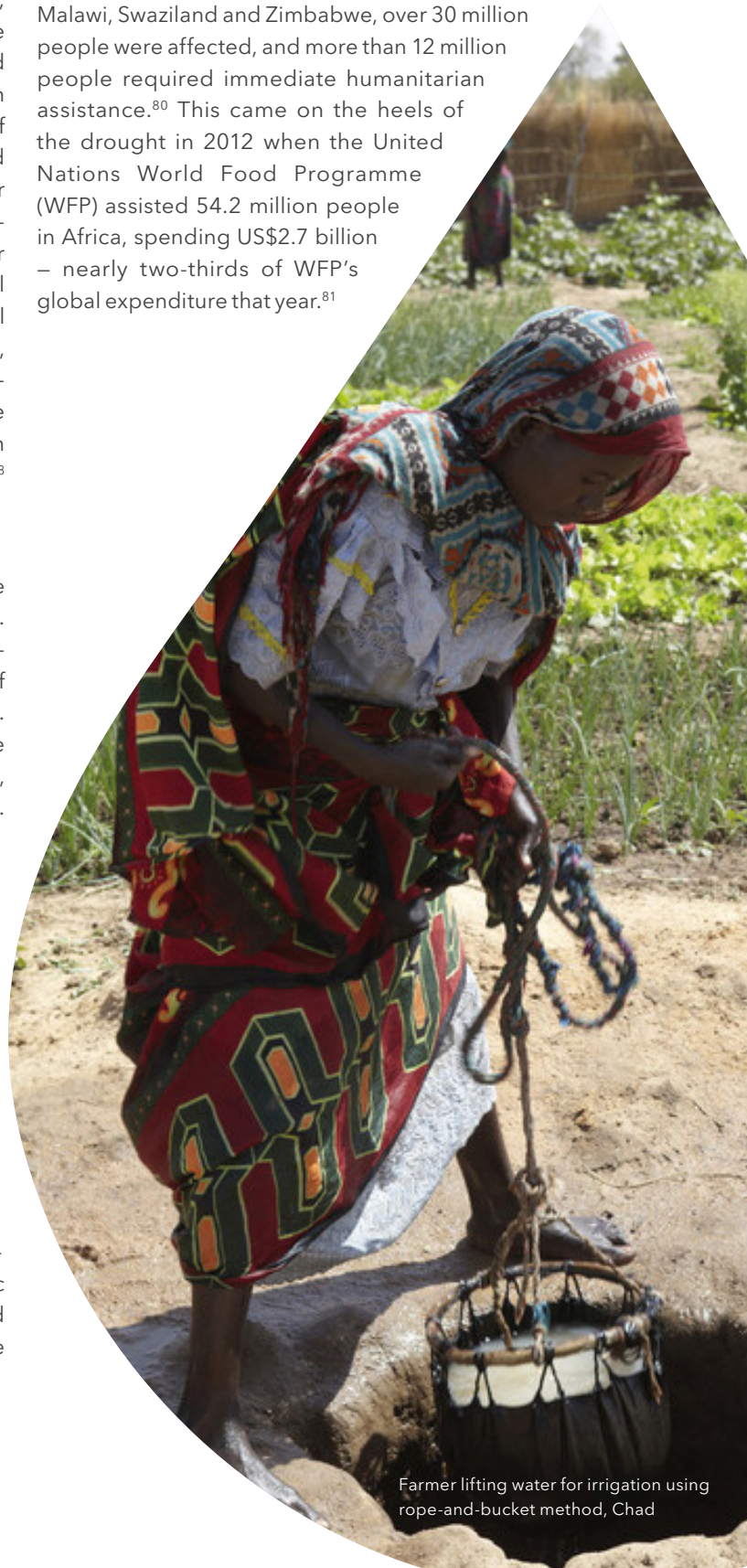
Farmer lifting water for irrigation using rope-and-bucket method, Chad

The 2015/16 El Niño led to the lowest rainfall levels in 35 years in Africa and caused intense drought in the Horn of Africa, with devastating impacts on the region's food security and countries' economies. In Ethiopia, Somalia and Eastern Sudan, 15 million people needed support to cope with the crisis. In southern Africa, particularly in Lesotho, Malawi, Swaziland and Zimbabwe, over 30 million people were affected, and more than 12 million people required immediate humanitarian assistance. 80 This came on the heels of the drought in 2012 when the United Nations World Food Programme (WFP) assisted 54.2 million people in Africa, spending US$2.7 billion – nearly two-thirds of WFP's global expenditure that year. 81