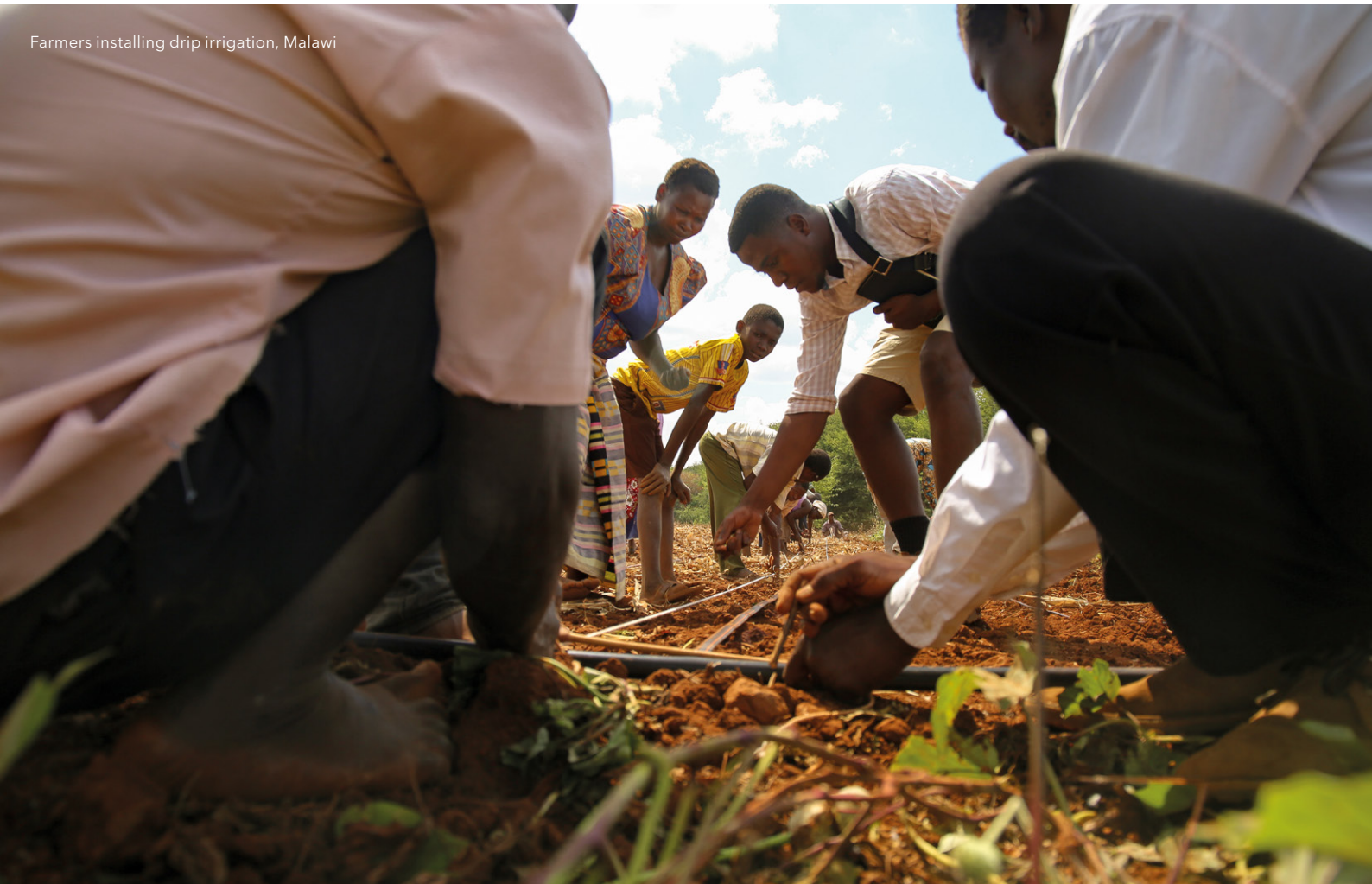
Farmers installing drip irrigation, Malawi

The expansion of land under irrigation and the adoption of modern technologies greatly contributed to the growth and increased resilience of Morocco's agriculture sector. Since 2008, agricultural output has increased, and the sector and smallholder farmers have become less vulnerable to climatic shocks. For instance, the 2015–2016 agricultural season was marked by a drop in rainfall of over 50 percent compared to the usual average. However, agricultural GDP fell by only 7 percent, a tangible indicator that the irrigation program has increased farmers' resilience and protection against climatic variations. Prior to the expansion of irrigation, the fall in GDP might have reached up to 40 percent. 244 ■