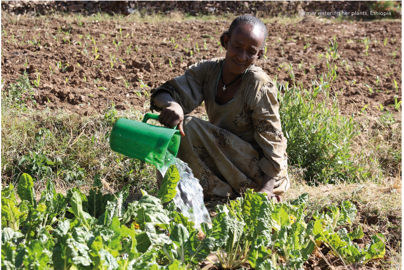
Farmer watering her plants, Ethiopia

and management. In particular, the policy sought to enhance the production of food crops and raw materials needed for agro-industries through irrigation on an efficient and sustainable basis. To translate the WRMP into action, the Ministry of Water Resources (MoWR) issued the Ethiopian Water Sector Strategy (EWSS) in 2001. 173 Within the strategy, the Water Sector Development Programme (WSDP) set out five different sub-components: Water Supply and Sewerage, Irrigation and Drainage, Hydropower Development, General Water Resources, and Institutions/Capacity Building. The principal objective of the Irrigation Development Programme is environmentally and financially sustainable expansion of agricultural land under irrigation, and improved water use efficiency toward achieving food self-sufficiency at the national level, and satisfying the raw material demand of local industries. To this end, the policy foresees to build micro dams on rivers/streams, consider cost-effective pumping stations using pressurized irrigation technologies, make higher budgetary allocations to irrigation, promote the use of shallow wells using hand and foot pumps; and promote the participation of the private sector in the management of water resources. 174