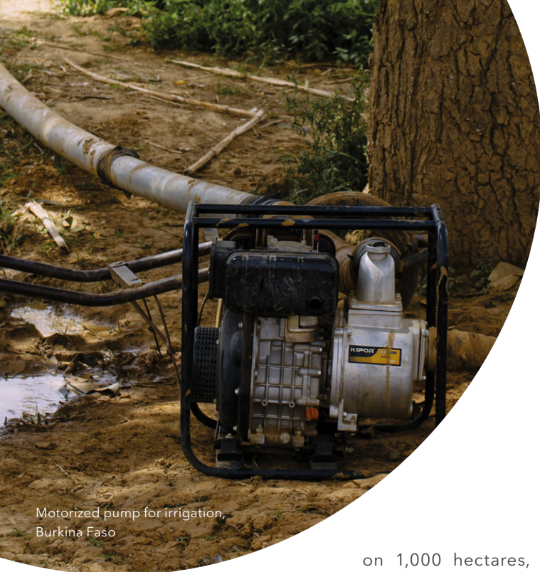
Motorized pump for irrigation, Burkina Faso

on 1,000 hectares, it takes 300 to 500 workers to produce citrus crops, and over 2,000 workers for tomatoes grown in greenhouses, on the same area of land. 67 Modern irrigation technologies may make agriculture more attractive, in particular to Africa's youth. 68 In Kenya, for instance, an irrigation development program through a PPP attracted 5,000 young participants. The government provided 90 percent of the financial capital as an interest-free loan, and a Kenyan company, Amiran Kenya, supplied the technical capacity and equipment, known as the Amiran Farmers Kit (AFK). This low-cost irrigation kit is based on drip irrigation technologies that use 30 to 60 percent less water than other irrigation techniques. A government fund of US$1.6 million allowed the acquisition of 420 kits in 2014, benefitting 200 youth groups and 15,000 farm families. 69