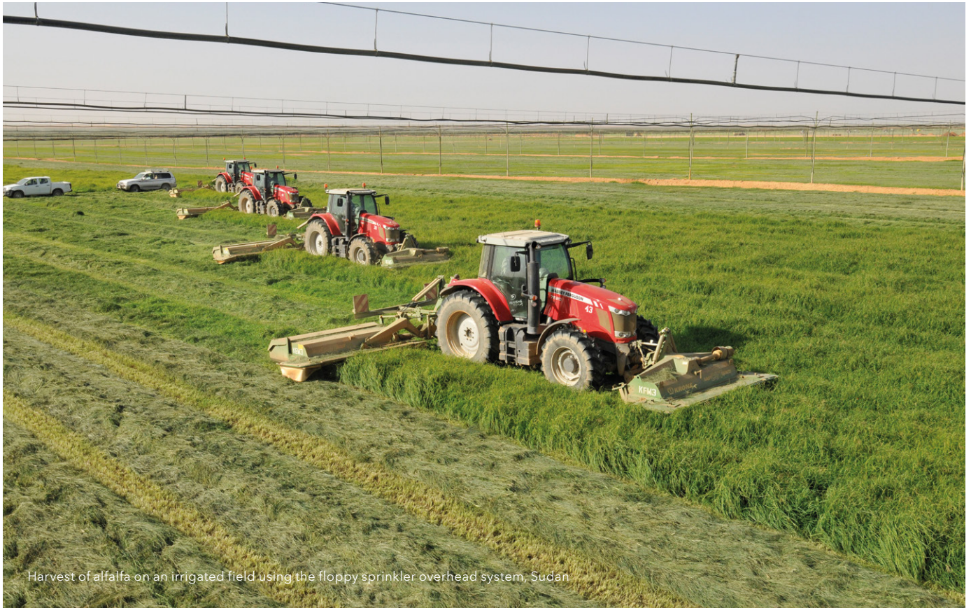
Harvest of alfalfa on an irrigated field using the floppy sprinkler overhead system, Sudan