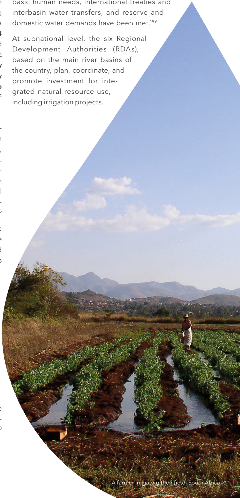
A farmer irrigating their field, South Africa

At subnational level, the six Regional Development Authorities (RDAs), based on the main river basins of the country, plan, coordinate, and promote investment for integrated natural resource use, including irrigation projects.