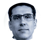
Karim El Aynaoui MOROCCO

CEO, Southern African Confederation of Agricultural Unions (SACAU)