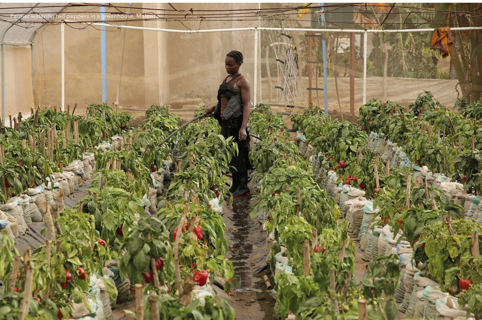
Farmer watering red peppers in a greenhouse, Malawi

The Malabo Montpellier Panel has identified a set of policies and practices summarized below that, if brought to scale, could significantly improve the resilience and livelihoods of rural communities and spur overall agricultural growth and transformation in Africa.