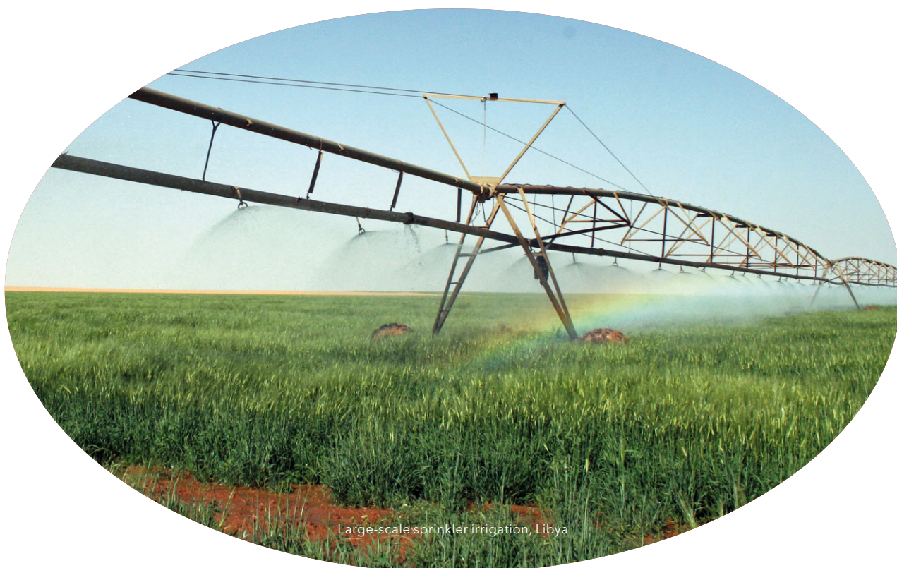
Large-scale sprinkler irrigation, Libya

The country selection also took into account regional representation across the continent, including North Africa and SSA. Therefore, countries within the defined cluster were ranked based on each indicator and the top country from North Africa and the top two countries from SSA under each indicator were selected for the case study analysis. Morocco, South Africa and Mali were identified for their high level of irrigation; Ethiopia, Kenya and Niger were identified for their pace of irrigation expansion. Table 4 shows the percentages of area equipped for irrigation and the increase of the share of arable land under irrigation for the selected countries, while table 5 provides a summary of the institutional innovations, policy and programmatic interventions and implementation modalities of each country analysis.