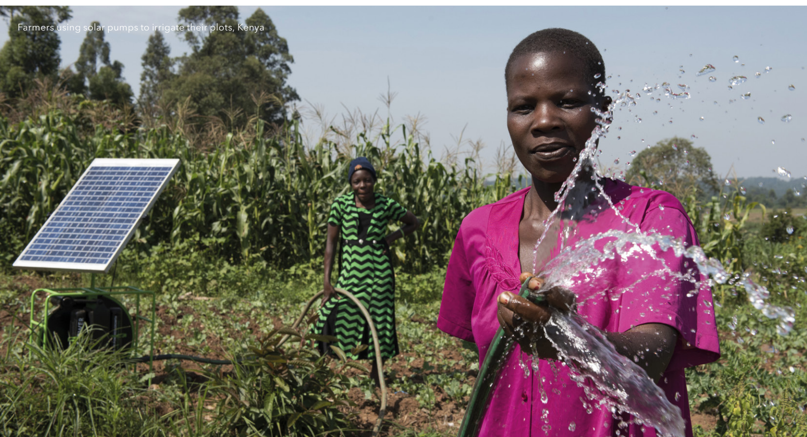
Farmers using solar pumps to irrigate their plots, Kenya

energy small- and medium-sized enterprises. Solar power can be useful for various agriculture-related activities. Examples include solar-powered irrigation pumps and power for small businesses such as rice processors. The project estimates that savings for households can range from approximately US$75 to US$200 per year, depending on the daily cost of kerosene, the amount of kerosene displaced, and the cost of the solar system in the specific geographic market. Further, more powerful solar home systems have the ability to power micro and small business to increase income for consumers and can be used for agricultural inventions. Solar-powered irrigation pumps and refrigeration can increase farmers' yields and ultimately income. 212 One of the few companies selling solar home systems is the British company Sollatek, which has been operating in Kenya since 1985, selling its products through a regionwide network of distributors. Besides a range of domestic solar systems, like lamps and solar panels, Sollatek sells solar water pumps as well as solar refrigerators and freezers. 213 Over the last ten years, Kenya has significantly increased the area under irrigation, largely due to strong policy innovations and programmatic interventions as well as an active role of the private sector in the dissemination of smart irrigation technologies. However, the potential to expand the share of arable land under irrigation remains high.■