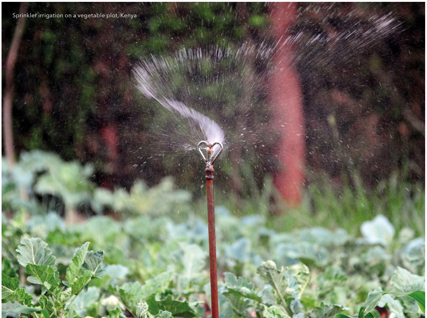
Sprinkler irrigation on a vegetable plot, Kenya