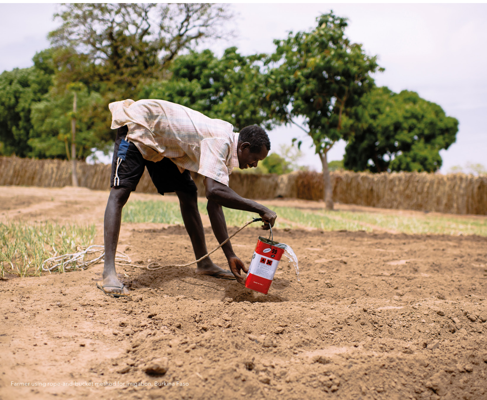
Farmer using rope-and-bucket method for irrigation, Burkina Faso