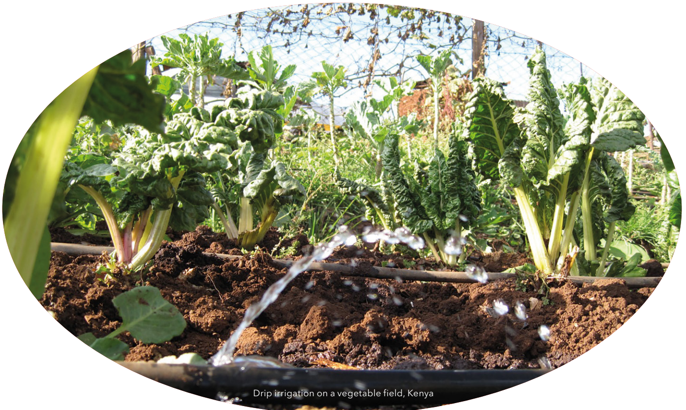
Drip irrigation on a vegetable field, Kenya

The report begins with an overview of the challenges on agricultural systems to make more food available and accessible and lays out the potential of irrigation to make agriculture more productive, efficient and profitable for smallholder farmers. A discussion on the potential to expand irrigation across Africa and barriers to uptake including an analysis of the inherent risks and desired outcomes of irrigation forms the next section. The report reviews the traditional and new, innovative small-scale and large-scale irrigation approaches and technologies that have been implemented in Africa, followed by an analysis of the experiences of six African countries that have been particularly innovative and successful in terms of their institutional and policy design for irrigation. The report closes by drawing some key lessons and offering nine recommendations for actions by African governments and the private sector.