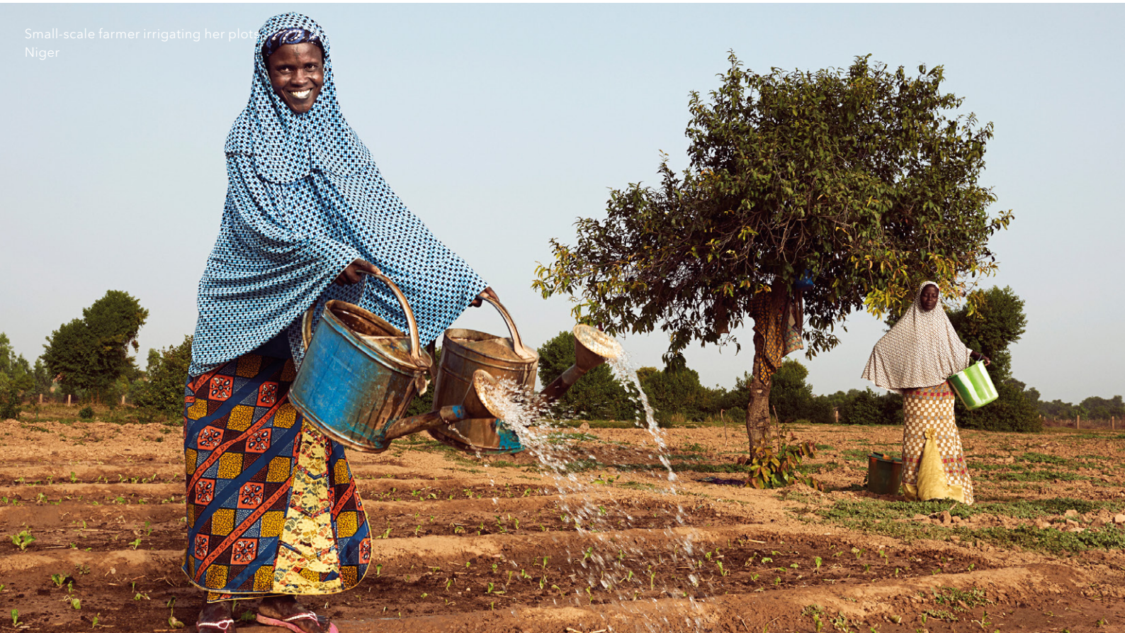
Small-scale farmer irrigating her plots Niger

Recently, the government has been partnering with the private sector to promote the development of innovative irrigation technologies and facilitate their adoption at scale. In 2011, the "Tele-Irrigation" kit was developed and brought to market by a local company. The kit consists of a solar station and pump, a water distribution network, and a mobile phone. It allows farmers to remotely control their irrigation systems using a mobile phone. Tele-Irrigation also makes it possible to collect and disseminate real-time and remote meteorological and hydrological data, including temperature, soil moisture content, rainfall, solar radiation, and wind speed. As a result, farmers save time, use water more efficiently, and can increase their irrigated land size, which in turn may increase their production and income. The technology contributes to a reduction in greenhouse gases by using solar energy. Furthermore, to compensate for lack of fodder during the dry season, Tele-Irrigation kits are being adopted to produce fodder in breeding centers. 258 Niger's growth in irrigation uptake in the decade to 2013 was largely driven by an increase in small-scale irrigation uptake, and private sector involvement. The government's commitment to expanding irrigation has been demonstrated through comprehensive institutional innovations and targeted policy and programmatic interventions. Despite this, Niger still has a large potential to increase the amount of land under irrigation. ■