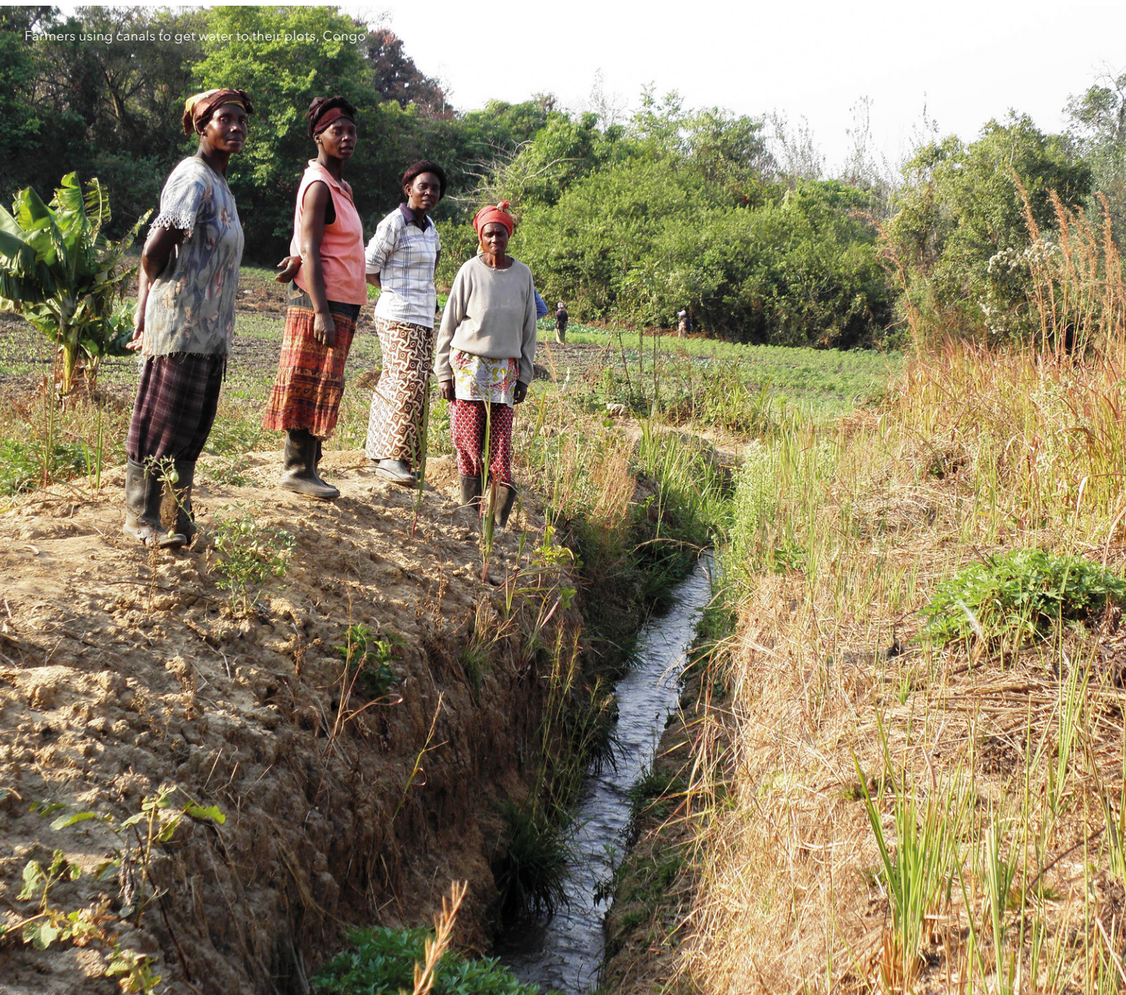
Farmers using canals to get water to their plots, Congo

While irrigation projects were often unprofitable in the 1970s and 1980s, returns on projects now reach 20 percent in Africa, a figure that is comparable to the rest of the world. 34 This reflects better-designed irrigation projects, dedicated institutions for irrigation and water-resource management, better access to technologies, and market opportunities for high-value products. 35