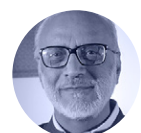
Ashok Gulati INDIA

Former Commissioner for Rural Economy and Agriculture, African Union Commission (AUC)