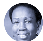
Rhoda Peace Tumusiime UGANDA

Former Commissioner for Rural Economy and Agriculture, African Union Commission (AUC)