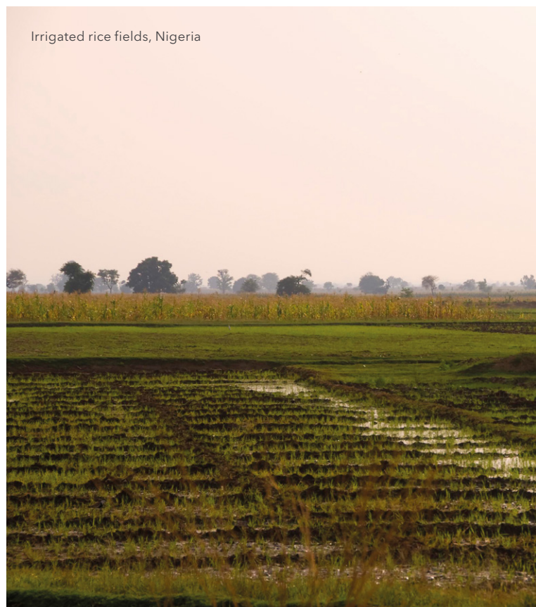
Irrigated rice fields, Nigeria

It is clear from the above that irrigation is an important coping mechanism to substantially improve farmers' resilience and livelihoods. It is estimated that without additional investment in irrigation, the share of people at risk of hunger could increase by 5 percent by 2030 and 12 percent by 2050. 88