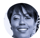
Nachilala Nkombo ZAMBIA

Chair of the High Level Panel of Experts/HLPE on Food Security and Nutrition