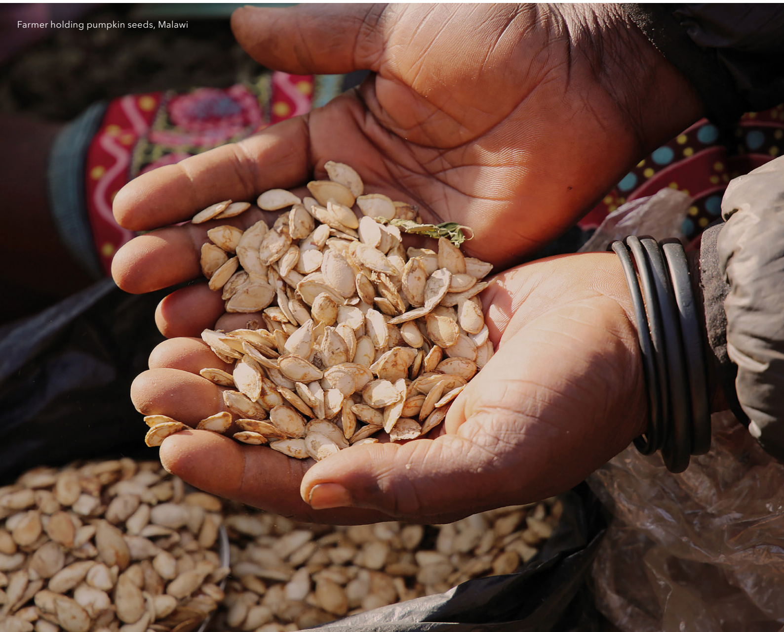
Farmer holding pumpkin seeds, Malawi

Irrigation investments need to accelerate in Africa. By meeting the need for expanded agricultural production, and by drawing on strengthened capacities as well as promising technologies that facilitate decentralized water-saving approaches, these investments will be attractive to farmers, businesses, and governments.