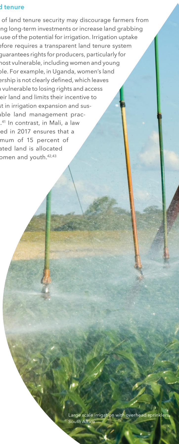
Large scale irrigation with overhead sprinklers, South Africa

Lack of land tenure security may discourage farmers from making long-term investments or increase land grabbing because of the potential for irrigation. Irrigation uptake therefore requires a transparent land tenure system that guarantees rights for producers, particularly for the most vulnerable, including women and young people. For example, in Uganda, women's land ownership is not clearly defined, which leaves them vulnerable to losing rights and access to their land and limits their incentive to invest in irrigation expansion and sustainable landmanagement practices. 41 In contrast, in Mali, a law passed in 2017 ensures that a minimum of 15 percent of irrigated land is allocated to women and youth. 42,43