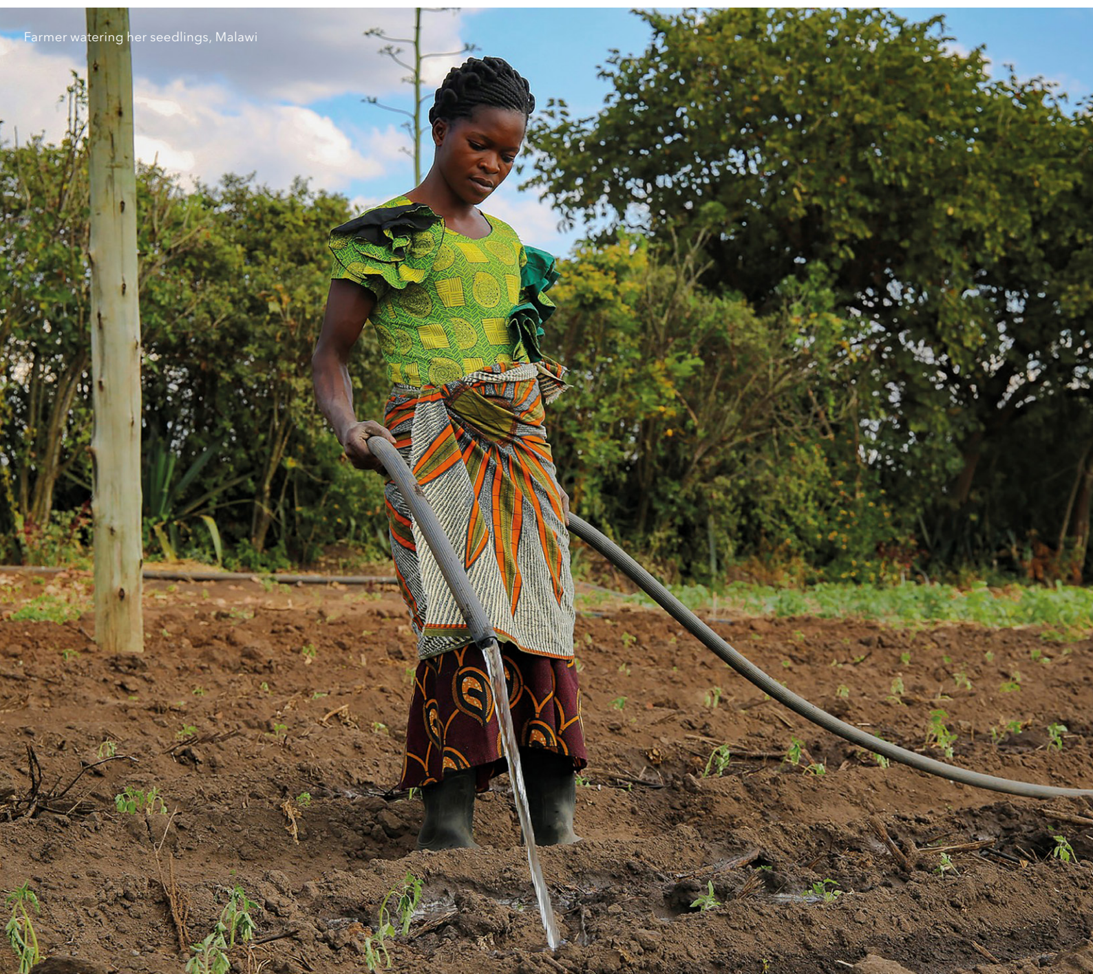
Farmer watering her seedlings, Malawi

To meet the various goals established under continental and global policy frameworks, particularly the Malabo Declaration and the SDGs, African countries need to elevate water for agriculture and irrigation to top policy priorities within their national agriculture investment strategies.