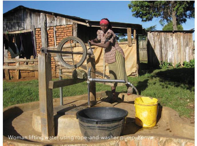
Woman lifting water using rope-and-washer pump, Kenya

The most simple and cost-efficient means of irrigation remains the rope-and-bucket method, using surface water, rainwater or, most commonly, groundwater. Using any vessel, such as a bucket or tank, which is connected to a rope, the water is lifted manually and broadcast across a field with the use of a vessel. Although it is easy and equipment is inexpensive, the method is only suitable for small plots, as it remains arduous and time-consuming and does not use water efficiently.