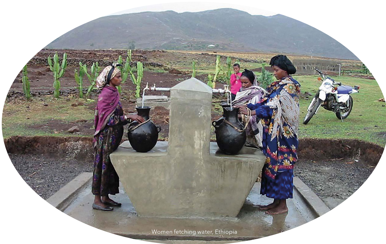
Women fetching water, Ethiopia

The benefits of irrigation are even greater when combined with improved soil management practices. 53 Evidence from Burkina Faso shows that farmers were able to produce 1,700 kg/ha of sorghum when zaï pits (small planting pits) were enriched with both dung and fertilizers, compared to just 200 kg/ha without dung and fertilizer. 54 Similarly, in North East Tanzania, cucumber yields were 203 percent higher and water consumption four times lower with the adoption of practices such as manure application and mulching. 55