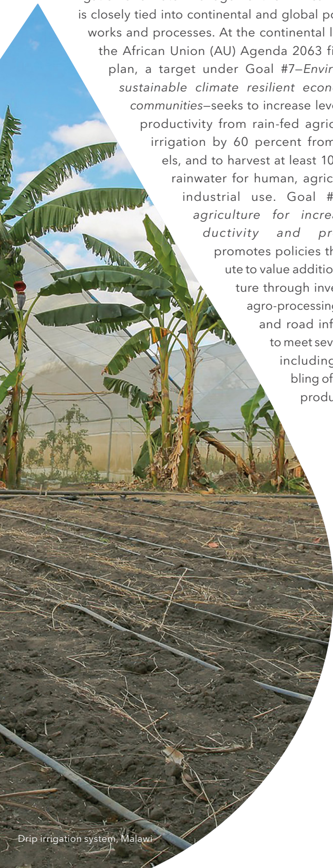
Drip irrigation system, Malawi

The 2025 African Water Vision, a framework developed in 2000 by the African Union, the African Development Bank (AfDB), and the United Nations Economic Commission for Africa (UNECA) calls for "an Africa where there is an equitable and sustainable use and management of water resources for poverty alleviation, socio-economic development, regional cooperation, and the environment." The framework stresses the need to increase water productivity of rain-fed agriculture and irrigation by 60 percent and the area under irrigation by 100 percent by 2025. 160 Based on this vision and the aim of promoting development and poverty eradication through the effective management of the continent's water resources and provision of water supply services, the African Ministers' Council on Water (AMCOW) was formed in 2002 in