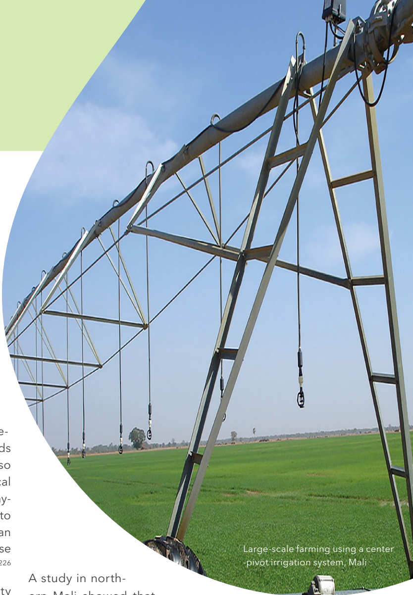
Large-scale farming using a center-pivot irrigation system, Mali

Since 2012, the government has been implementing the National Program of Irrigation of Proximity (PNIP) in Sikasso, Koulikoro, Pays Dogon, and the Delta Intérieur du Niger to improve overall food security in these regions. The program seeks to develop irrigation infrastructure, including micro dams, for supplemental water supply during periods of insufficient rainfall or drought. The small irrigation dams store rainwater in retention ponds that can be used to irrigate farm lands and extend the growing season. The additional access to water may also be used for fish production, livestock watering, and vegetable gardening to diversify livelihoods and improve the nutrition status of those communities. It is estimated that by 2021 the PNIP will increase land under irrigation by 126,000 ha and benefit up to 3 million people. 229