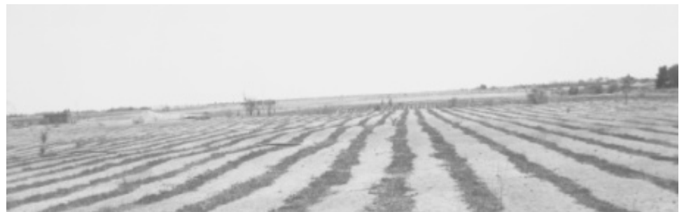
Figure 1: Reclaimed desert lands

The three zones that mainly rely on groundwater for irrigation in Egypt are the reclaimed desert lands in the fringes of the Nile Valley (Figure 1), the Inland Sinai Desert and Eastern Desert, and the Western Desert, including oases and remote southern areas. With regard to the North Coastal zone, there are no reliable figures available on groundwater quantity and usage, but seasonal rain water is the main source of irrigation.