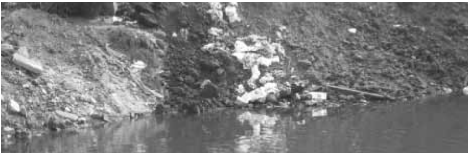
Figure 3: Water pollution

At the beginning of the 1970s, the impact of soil pollution due to the excessive use of chemical fertilizers after the construction of the Aswan High Dam in the late 1960s became apparent. Adding to the problem, many nutrient elements of the Nile Valley and Delta soil were depleted by extensive and frequent cropping, unsustainable irrigation water management and improper agricultural practices (Abdel-Wahab et al., 2000).