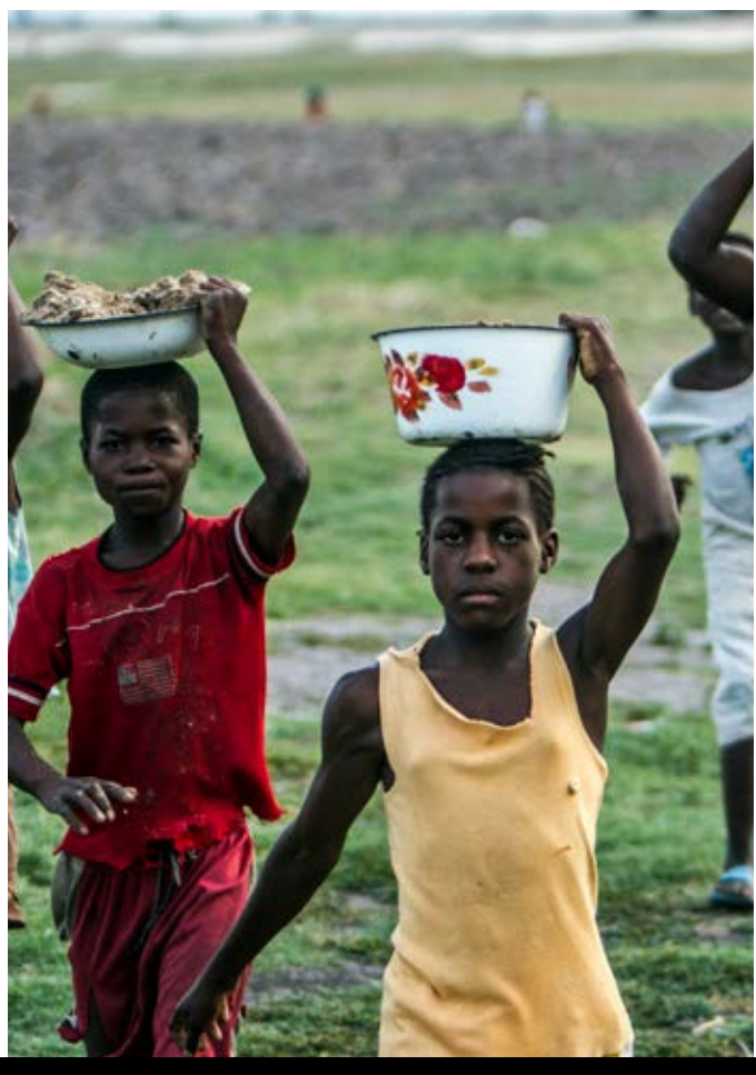
School attendance by itself has been found to protect against teen pregnancy – but what if the economic barriers to schooling are too great?

It was noted that families often struggle to pay for basic needs, including but not limited to school fees, school supplies, and boarding costs. In some instances, girls seek support from boys or men to meet these basic needs, after which they may be pressured into sex.