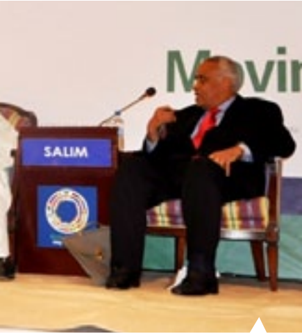
Former Organization for African Unity (OAU) Secretary-General Dr. Salim Ahmed Salim gives his contribution during the discussion.

Asked what was needed to accelerate progress in integration, Dr. Salim replied that “First and foremost, we must build confidence in ourselves and among ourselves.” Continuing, he commended West Africa on its efforts towards regional integration.