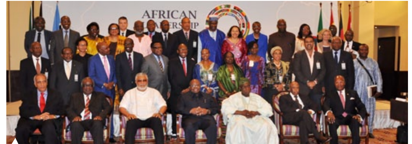
Participants of the African Leadership Forum (ALF) 2015 in a group photo with former African Presidents and statesmen. Seated from left: Dr. Salim Ahmed Salim (former O.A.U SG), H.E Hifikepunye Pohamba of Namibia, H.E Jerry Rawlings of Ghana, H.E Benjamin Mkapa of Tanzania and host of the ALF, H.E Olusegun Obasanjo of Nigeria, H.E Festus Mogae of Botswana and H.E Bakili Muluzi of Malawi.

On the occasion of the fiftieth anniversary of the Organisation of African Unity (OAU)— now the African Union (AU)—the Heads of State and Government expressed their commitment to the enduring Pan-African vision of an 'integrated, prosperous, and peaceful Africa, driven by its own citizens and representing a dynamic force in the global arena' . Within this context, at the twenty-first ordinary session of the Assembly of the African Union, they produced a solemn declaration that set out the priority areas for Africa's development over the next fifty years.