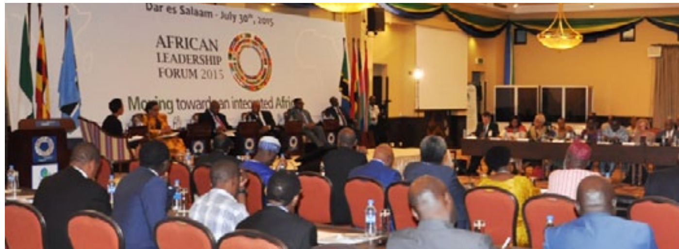
Participants in one of the plenary discussions at the ALF 2015.

Many in Africa do not know that the human resource is the greater wealth than the minerals in the ground. That is how China, Japan, India and even South Korea are much richer than Saudi Arabia .”