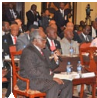
H.E. Hifikepunye Pohamba of Namibia gives his contribution during one of the ongoing sessions.

In his opening statement, President Pohamba reiterated that the idea of a union government for Africa has been discussed since the time of the formation of the OAU more than 50 years ago. However, at that time, given the diversity and inequality of development between African states he personally considered that it was not yet time to form such a union government.