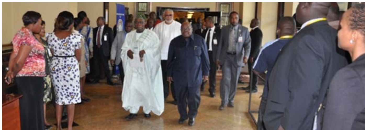
Former Presidents Mkapa, Obasanjo and Rawlings arrive ahead of the session proceedings for the African Leadership Forum.

In his closing remarks to the panel, President Pohamba considered that efforts to stem and reverse the flow of qualified people leaving the continent should be prioritized. To this end, he suggested establishing a fund administered by the Commission of the African Union under NEPAD dedicated to training and keeping African experts in Africa. He added that money for this fund can be sourced from member states as well as from the many companies that are exploiting the natural resources of the continent.