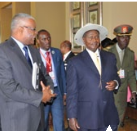
President Museveni shares a word with one of the event's participants.

“The consequence was that these little kings, by 1900, a mere 38 years since the arrival of Speke in Uganda, had been enslaved, along with their poor subjects. In the whole of Africa, it was only Ethiopia that defeated a European power and was not colonized. So, the consequence of the low level of integration was the quick conquest of the whole of Africa, except for Ethiopia. Even Ethiopia, however, led by the reactionary feudalists, could not for long guarantee its independence. Mussolini conquered it in 1935.”