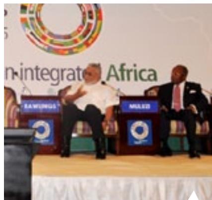
H.E. Jerry Rawlings emphasizes a point during the forum.

Taking a broader regional and global view on the factors affecting African integration, President Rawlings commended the will of regional powers in dealing with the scourge of terrorism but hastened to add that the world’s continuing failure to solve the Israeli-Palestinian conflict had wrought “damage to the greenhouse layer of international morality” and created a hole which needed to be sealed and healed. He felt that if a solution was not found to the Israeli-Palestinian problem it would continue to be a blight on the conscious of the world, with the potential to percolate downwards to generate pockets of resistance and terrorist activities and create insecurity on the African continent. He felt that Africa was quite vulnerable due to the mix and diversity of the continent and counselled that disparity in development needed to be addressed lest it become a source of stress and tension for the people that outsiders could take advantage of.