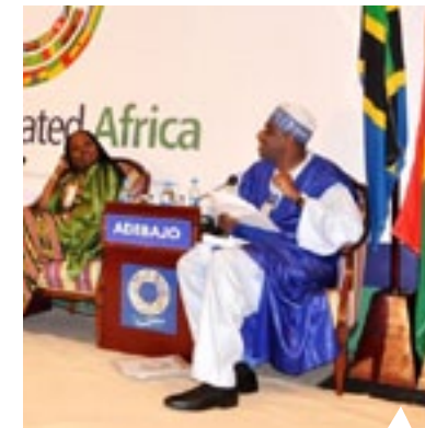
Executive Director of the Centre for Conflict Resolution Dr. Adeboye Adebajo makes a point during the plenary discussion.

Dr. Adebajo called for a Pan-African conference to re-think and re-imagine the map of Africa so as to end the curse of the notorious Berlin Conference of 1884-85 at which European imperial powers imposed artificial government and political systems across the continent, and, in doing so, sowed the seeds of many African conflicts. Indeed, it is estimated that over 6 million Africans have died defending the colonial borders established at the conference. He added that: