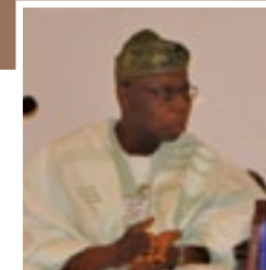
H.E. President Obasanjo

"Integration is something we have to achieve whether we like it or not because we can only swim together or sink individually, sink separately."