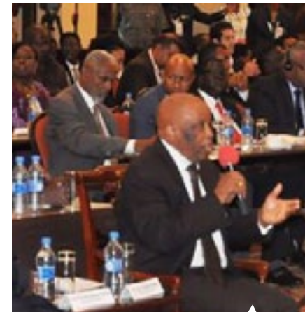
H.E. Festus Mogae makes a point during the Forum discussions.

In his opening statement to the panel, President Mogae expressed his belief that the institutions that have been mandated with implementing the integration agenda do have the capacity to deliver what is asked of them. Rather, what is lacking is the will of leaders to act on and implement the resolutions passed by those institutions, the most important one being the African Union. He said that: