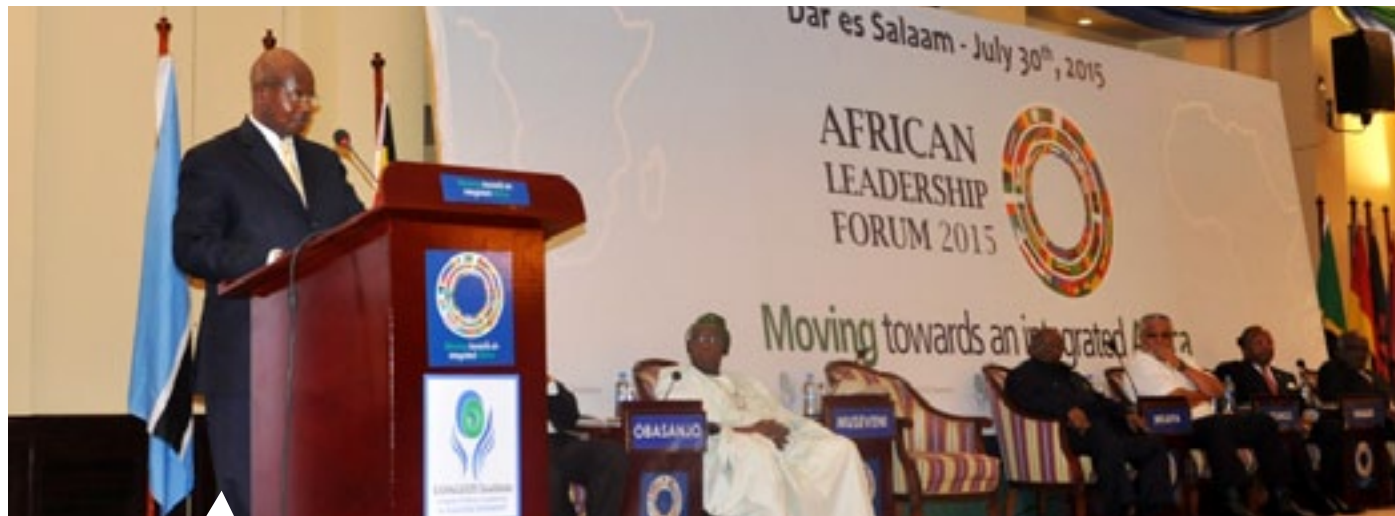
President of Uganda, Yoweri Kaguta Museveni, delivers his keynote address at the ALF, which was held on 30th July 2015.