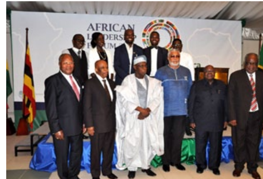
Former African Presidents in a group photo with the winners of the Youth Leadership Essay during the gala dinner of the ALF.

"The free trade area has been launched but what does it mean? To me...it is a theoretical statement, because the conditions to operationalize a free trade area are not ready. We have to negotiate our offers because the offers are the ones which are going to guide the implementation of free trade areas. We have not finalized preparation of our rules of origins... But, more importantly, the agreements...must be ratified by member states, so that is only going to happen if the member states are going to take that quick action of ratifying the tripartite agreement. It is not about institutions, it's about the commitment by member states to do what is required to be done."