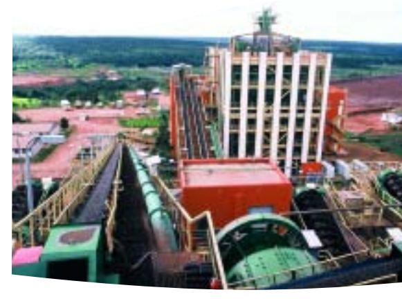
Catoca Plant, Lunda Sul

Currently, Luzamba is the only formal alluvial mining operation producing diamonds in the Cuango region. All other diamond production is from artisanal mining, although new industrial-scale projects are expected to come into operation. SDM produced $177 million of diamonds in 2003, but its present concession is expected to be exhausted in 2004.