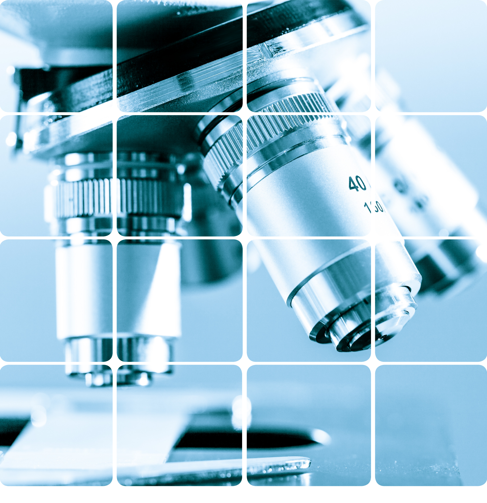
Botswana Institute for Development Policy Analysis

BIDPA House • Gaborone International Finance Park • Plot 134, Tshwene Drive Private BR-29 • Gaborone • BOTSWANA • Tel.: +267 397 1750 • Fax: +267 397 1748