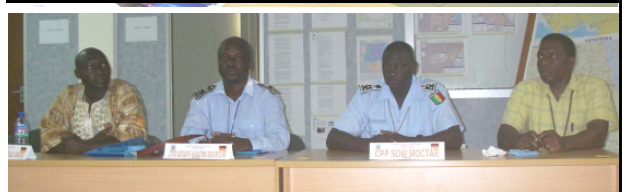
Section of participants at the UNAMID police course