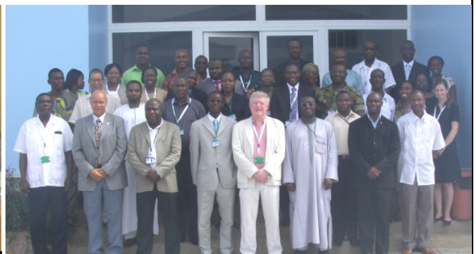
A group photograph of participants