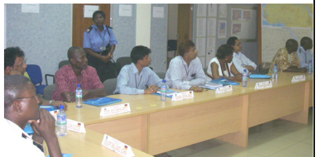
Section of participants at the UNAMID police course

and security initiatives in Africa. She explained that Germany's contribution to the development of Africa is linked to the G8 capacity mission to support the implementation of NEPAD and APRM in Africa.