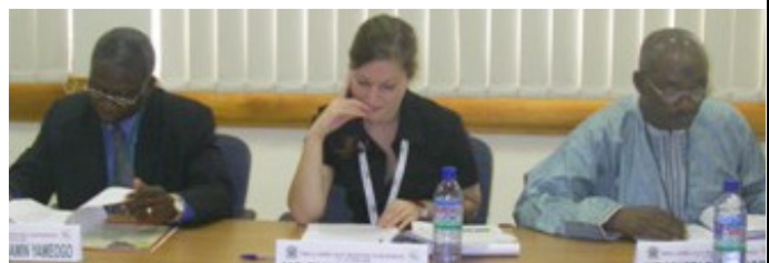
Section of participants at the SALW workshop

The Workshop was organised in collaboration with the German Development Corporation (GTZ), the ECOWAS Small Arms Unit (ESAU) and the Bonn International Centre for Conversion (BICC).