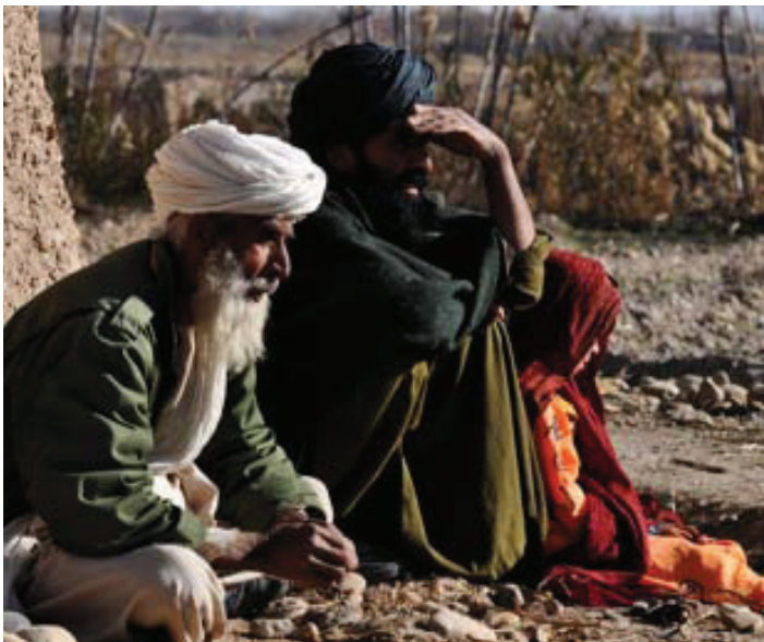
Shura in Nad-E' Ali, Afghanistan.

The justice, security and development aspects of state building are often considered separately. Eric Scheye argued that the spheres of justice (involving, for example, the training of notaries or casebook development), security (involving the creation of community safety boards and the development of local policing) and development (marked by community-driven economic development) should be incorporated into one reform package, rather than treated as three distinct and discrete areas.