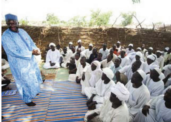
Meeting of local sheiks in West Darfur.