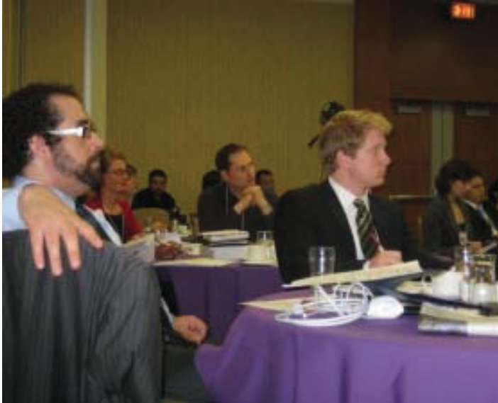
Event participants listen to the morning's discussion.

formal bodies can achieve the most impact. Processes like training notaries or building casebooks to record legal decisions can deliver tangible results to citizens at a very low cost to donor governments.