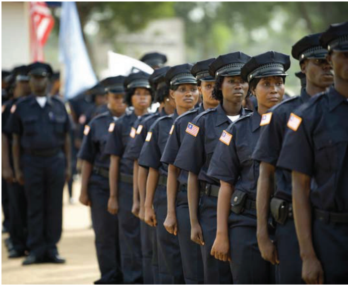
LNP graduation ceremony.

Sexual and Gender-based Violence (SGBV): Holistic approaches to addressing SGBV that include police and justice actors have demonstrated positive results. New institutions, such as the Women and Children Protection Section, are improving police responses to such cases.