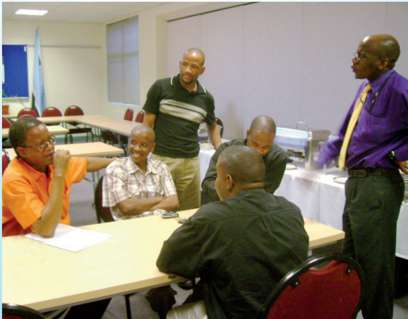
Batsetswe given a lecture on skills to survive outside BIDPA people by the BIDPA gents

The Performance and competitiveness of Small and Medium Sized Enterprises in Botswana, ( BIDPA & CEDA) . This study is an expedition to find out the state of affairs for doing business vis-a-vis the performance and competitiveness of the SMEs.