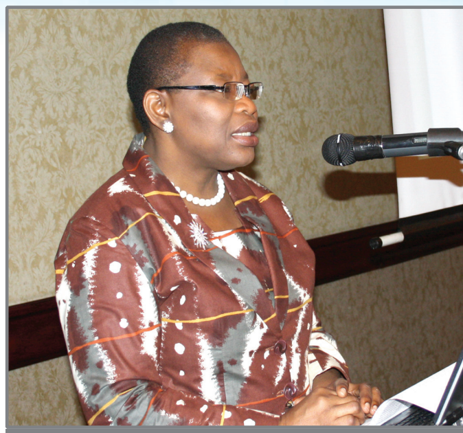
World Bank Vice president for Africa Region, Ms Obiageli Ezekwesili addressing the audience at the dialogue