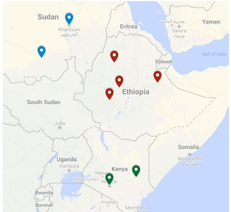
Sustained Dialogue Sites