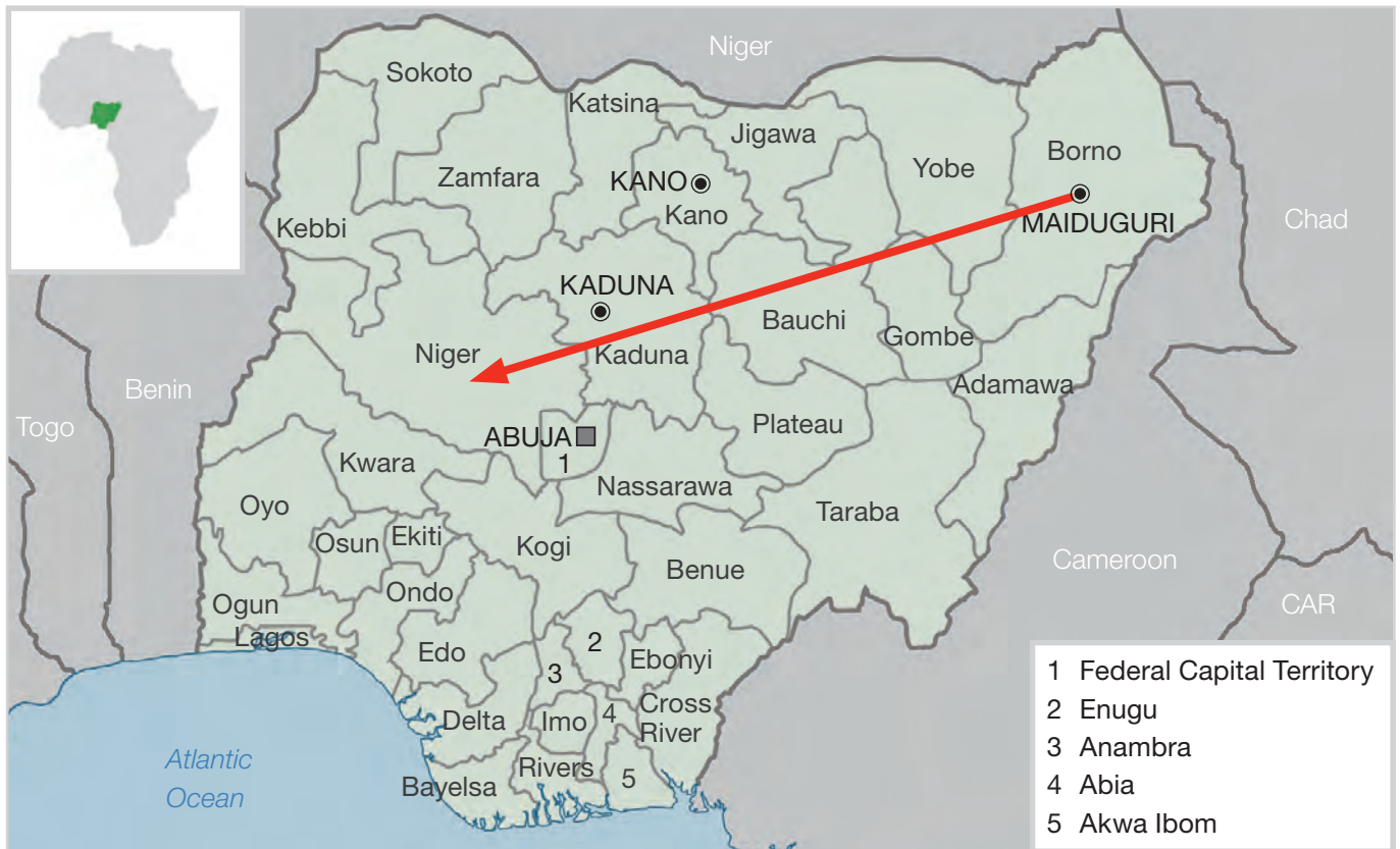
Figure 4: Movement of detainees from Maiduguri, Borno State, to Kainji, Niger State