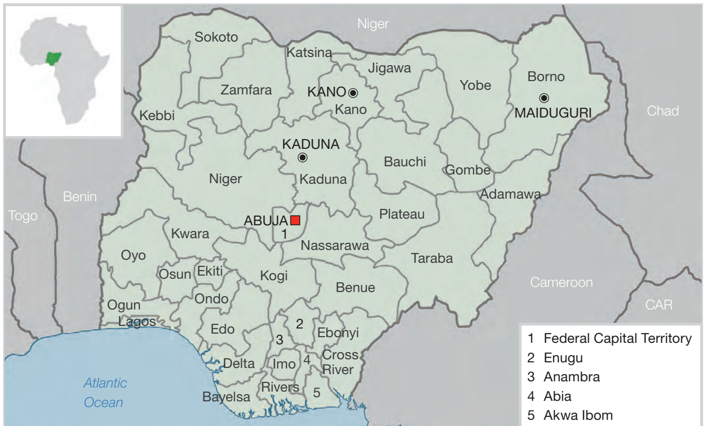
Figure 1: Map of Nigeria

Beyond presenting an analysis of key findings, it investigates ways to strengthen state and non-state actors’ capacities regarding respect for human rights in terror offence trials and counter-terrorism operations. Where there are gaps in the criminal justice system, recommendations are made. Their implementation