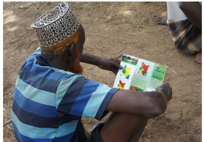
An agro-pastoralist in Garissa, Kenya, reading climate advisories

In undertaking Participatory Scenario Planning in Kenya a local task force was selected to plan the workshop. The task force involved sub-national government officers from the meteorological agency, planners, agriculture, disaster risk management and other relevant sectors, as well as some NGO and civil society participants particularly where they were leading adaptation and resilience programmes. This allowed for political buy-in to be gained across the relevant decision-makers.