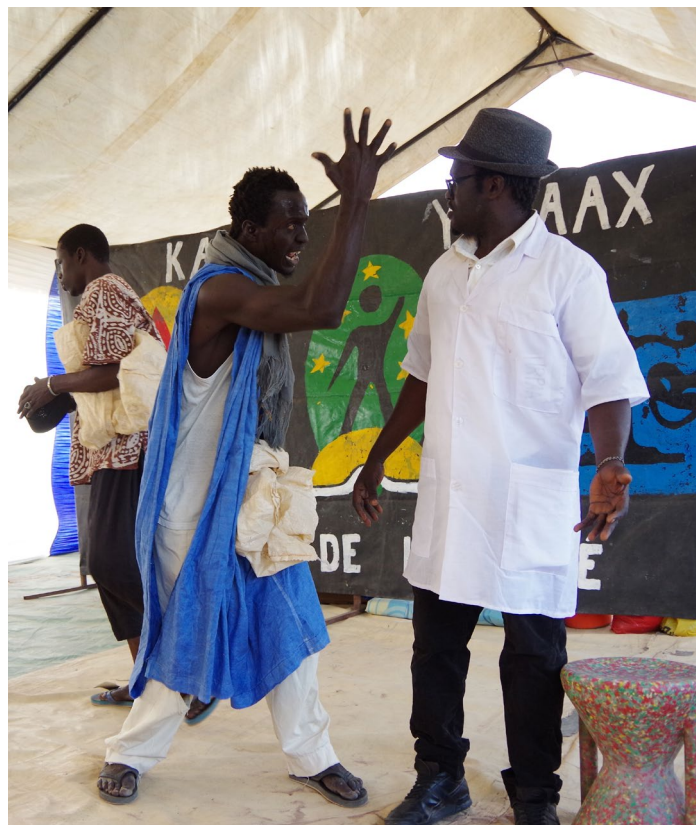
Theatre Forum organised in Senegal with Kaddu Yaraax group