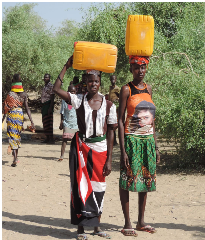
Local communities must travel long distances in search of safe water in Turkana County, Kenya