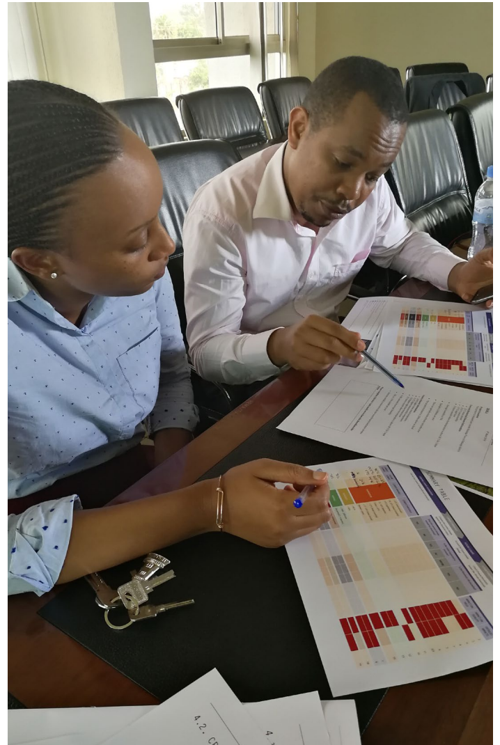
Participants engaging with the climate risk screening tool at a FONERWA workshop

In Rwanda, the Climate Services for Agriculture programme was able to build on experiences and evaluations of the application of Participatory Integrated Climate Services (PICSA) in other contexts. Among the learnings were the fact that a typical one-time, survey-based needs assessment is not enough to adequately capture user (farmer) needs. However, an iterative co-production process that captures and aggregates users' needs and evolving demand, as they gain experience, has proven to be beneficial. Similarly, learning from experience highlighted the importance of feedback processes to bring out users' voices in improved climate services.