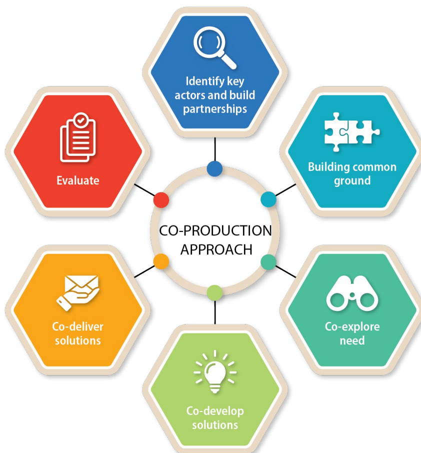
Figure 2: The building blocks of co-production (building on models developed by AMMA-2050 3 and KCL engagement in two BRACED consortia projects. 4