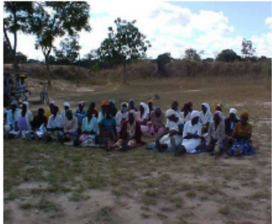
Women at a feedback meeting

Most farmers in Munyawiri confirmed that climate is not as it was in the past. Up to 80 per cent and 76 per cent of the respondents indicated that rains are starting late and ending prematurely, respectively. Eighteen per cent had observed an increase in the frequency of mid-season dry spells while 28 per cent and 10 per cent observed an increase in flood and rains coming earlier than normal respectively. A few of the respondents have observed seasons starting earlier than they normally should.