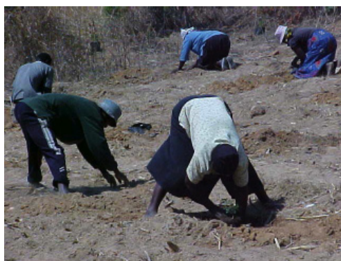
Dry planting in drought prone Munyawiri

However, these efforts by the traditional authorities are not yielding notable results because the communities, although still rural in