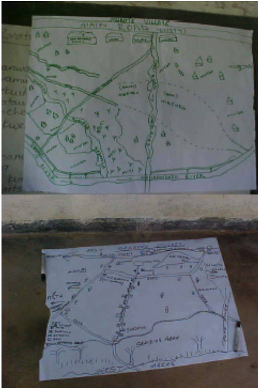
Resource map drawn by community members

spells and short rainy seasons. Generally, the area is suitable for intensive crop and livestock production. Rainfall is unreliable and averages 650-800mm per annum with temperatures hovering around 26-29 degrees Celsius in summer. In winter temperatures drop to even 10-15 degrees Celsius with very little or no rainfall. Frequent mid-season dry spells and other unusual variations such as droughts are characteristic of marginal areas like Mutonda.