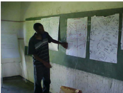
Community member illustrating a point during FDGs

Credit associations and savings clubs were mentioned by the women of Senzere as a reliable coping mechanism.