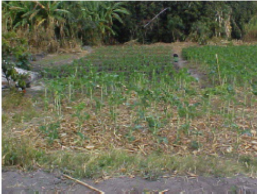
Vegetable Production in Munyawiri

diseases related to climate change, there were reports of people risking malaria by sleeping with their windows open because of unusually high night temperatures. During prolonged rainfall shortages, water sources become scarce, stagnant and contaminated, raising the incidence of cholera.