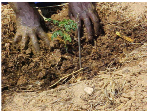
Conservation farming in Munyawiri

adaptation and mitigation strategies specifically targeted at women, such as energy efficiency, the promotion of renewable energy technologies, etc. In addition, traditional made attitudes, epitomised in the saying “a woman’s place is in the home” force many women to keep quiet in the presence of men during workshops.