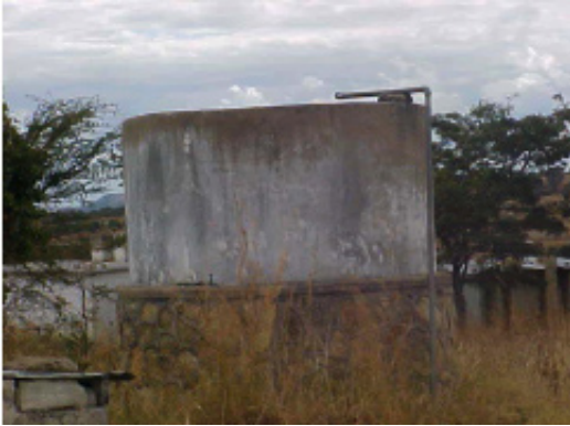
Water storage at Masikandoro clinic

terms of development and infrastructure, have become more cosmopolitan or heterogeneous and no longer adhere as absolutely to traditional authority as they did in the past. The communal nature of the communities is breaking down; people now tend to be more concerned with individual than with collective well-being.