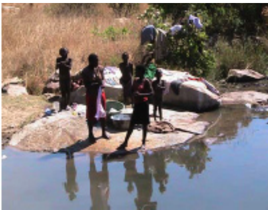
Community members washing at semi-dry Masikandoro River