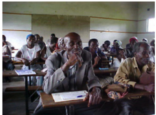
Communities attending FDG workshop