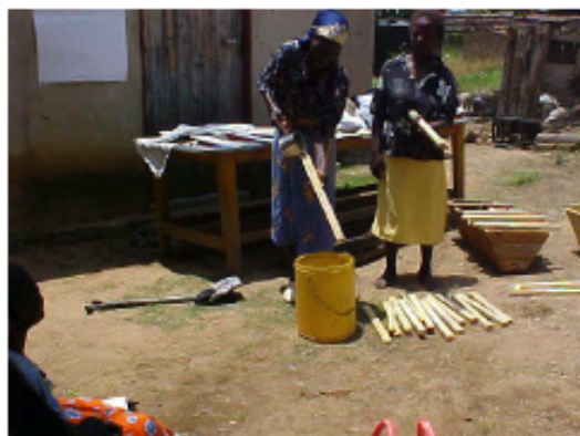
Women in bee-hive making

Cross-border trading --- with Zambia, South Africa and Botswana the major destinations -- is undertaken by both men and women in the project sites. Other sources of income include the sale of wild fruits (particularly mazhanje, tsubvu) in season and beer brewing.