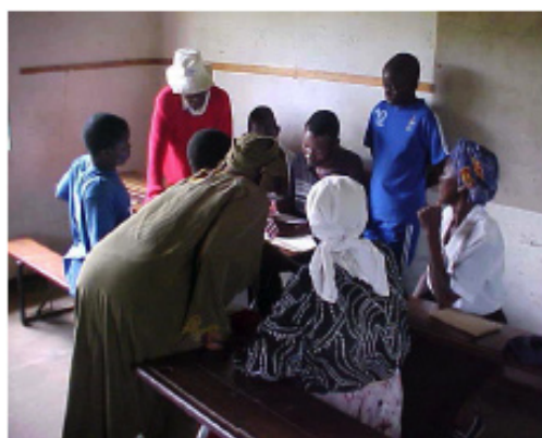
Villagers in focussed Group Discussion

Another significant theme at the workshop was that changes in the weather and climate