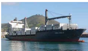
A CHINESE CONTAINER SHIP IN CAPE TOWN

China has been criticised for destroying African textile sectors through the export of cheap Chinese goods