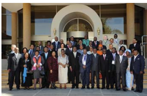
SADC HEADS OF STATE AND GOVERNMENT COME TOGETHER IN WINDHOEK, NAMIBIA IN AUGUST 2010.

“SADC is seeking to formulate coherent and effective policies on how best to respond to global climate change challenges”