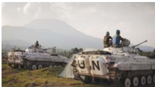
UN PEACEKEEPERS IN THE DEMOCRATIC REPUBLIC OF THE CONGO IN FEBRUARY 2013.

Although eight out of 15 United Nations peacekeeping operations are currently deployed in Africa, the UN Security Council has been reluctant to establish clear modalities for engagement with the African Union on such interventions