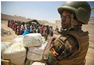
A UGANDAN SOLDIER SERVING WITH THE AU MISSION IN SOMALIA (AMISOM) KEEPS WATCH IN MOGADISHU IN FEBRUARY 2012.

6 Africa lacks a core group of the “able and willing” at the AU Peace and Security Council, which could act in coalition and with the consensus of others to draft key initiatives and to drive security cooperation with the UN