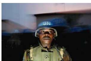
A NIGERIAN PEACEKEEPER WITH THE AU/UN HYBRID OPERATION IN DARFUR (UNAMID) PREPARES FOR A NIGHT PATROL IN MARCH 2008.

“The AU and Africa's sub-regional blocs are important producers, as well as consumers, of peace and security”