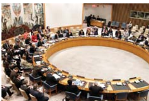
THE UN SECURITY COUNCIL MEETS IN APRIL 2012.

“The permanent five members of the UN Security Council control the penmanship of Council resolutions and have used discussions on working methods to delay any serious reforms”