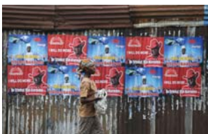
CAMPAIGN POSTERS FOR INCUMBENT PRESIDENT ERNEST BAI KOROMA, IN FREETOWN, SIERRA LEONE IN NOVEMBER 2012.

“The Peacebuilding Commission has been criticised for promoting a model that emphasises democratic elections and market liberalisation rather than tackling underlying causes and changing the “bitter minds” that often sustain conflicts”