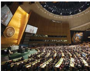
THE 67TH SESSION OF THE UN GENERAL ASSEMBLY CONVENES IN NEW YORK IN SEPTEMBER 2012.

“ The African Group at the UN must identify and agree on a mechanism to improve the accountability of Africa’s three non-permanent members on the UN Security Council to the Group ”