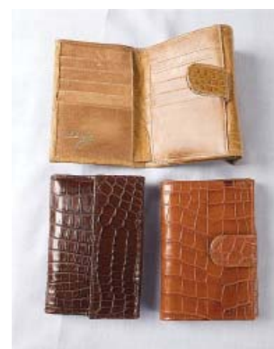
EXAMPLES OF CROCODILE LEATHER PRODUCTS AT THE LALELE CROCODILE FARM IN MOOKGOPONG IN THE LIMPOPO PROVINCE OF SOUTH AFRICA.

“ The South African Crocodile Industry Association (SACIA) was established in 2015 in response to a global trend of crocodile skins gaining greater export value over those for hides and skins. ”