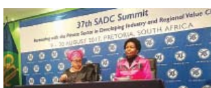
SOUTH AFRICA'S MINISTER OF INTERNATIONAL RELATIONS AND COOPERATION, MAITE NKOANA-MASHABANE, AND EXECUTIVE SECRETARY OF THE SOUTHERN AFRICAN DEVELOPMENT COMMUNITY (SADC), STERGOMENA LAWRENCE TAX, AT THE MEDIA BRIEFING OF THE 37TH SADC SUMMIT IN TSHWANE (PRETORIA), SOUTH AFRICA, IN AUGUST 2017.

South Africa needs to consider ways of expanding its business footprint into Southern Africa, as well as other regions and markets such as COMESA and the EAC through the COMESA-EAC-SADC tripartite arrangement.