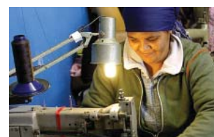
JINGER JACK IS AN EMERGING LEATHER GOODS COMPANY BASED IN CAPE TOWN, SOUTH AFRICA, EMPLOYING A TEAM OF LOCAL WOMEN TO PRODUCE A LINE OF MODERN LEATHER BAGS AND ACCESSORIES.

“Emerging entrepreneurs and small businesses could benefit from a stronger safety-net, buttressed by supportive government policies.”