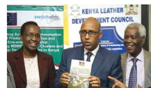
HON. ADAN MOHAMED (CENTRE), EGH, CABINET SECRETARY OF KENYA'S MINISTRY OF INDUSTRY, TRADE, AND COOPERATIVES, HOLDS A COPY OF THE STRATEGIC PLAN DOCUMENT AT THE LAUNCH OF THE KENYA FOOTWEAR MANUFACTURERS ASSOCIATION STRATEGIC PLAN 2017 - 2021 AT THE ROYAL TULIP HOTEL IN NAIROBI, KENYA, IN FEBRUARY 2017.

“A combination of factors, such as poor road infrastructure and lack of investment in modern technology, have left the Kenyan leather industry under-developed, with tanneries by and large operating significantly below their installed capacity.”