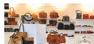
MEMBERS OF THE SOUTH AFRICAN FOOTWEAR AND LEATHER EXPORT COUNCIL (SAFLEC) EXHIBITING THEIR PRODUCTS AT THE PURE LONDON FASHION TRADE SHOW IN JULY 2017.

South Africa continues to face persistent hurdles and to struggle with the development of value chains in key agro-processing industries, in particular leather and leather products, with the potential to boost economic growth.