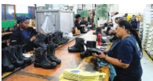
WORKERS ON THE FOOTWEAR PRODUCTION LINE AT THE BEIER GROUP FACTORY IN PINETOWN, SOUTH AFRICA, IN OCTOBER 2017.

“The South African Department of Trade and Industry has identified the footwear and leather industry as a priority sector for growth, and has developed a set of initiatives to strengthen the competitiveness of the sector.”