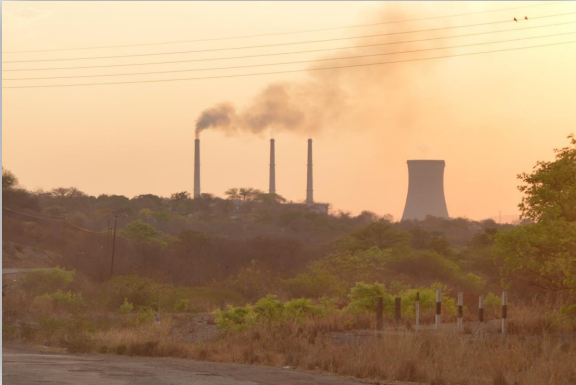
Fig 2; Air pollution from Hwange Power Station