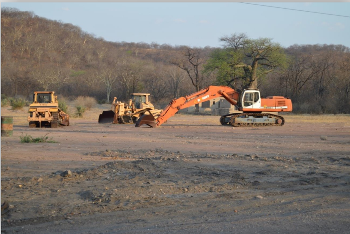
Fig 3; Some mining equipment at Makomo coal mine, such machinery also significantly pollutes the air during operational times.