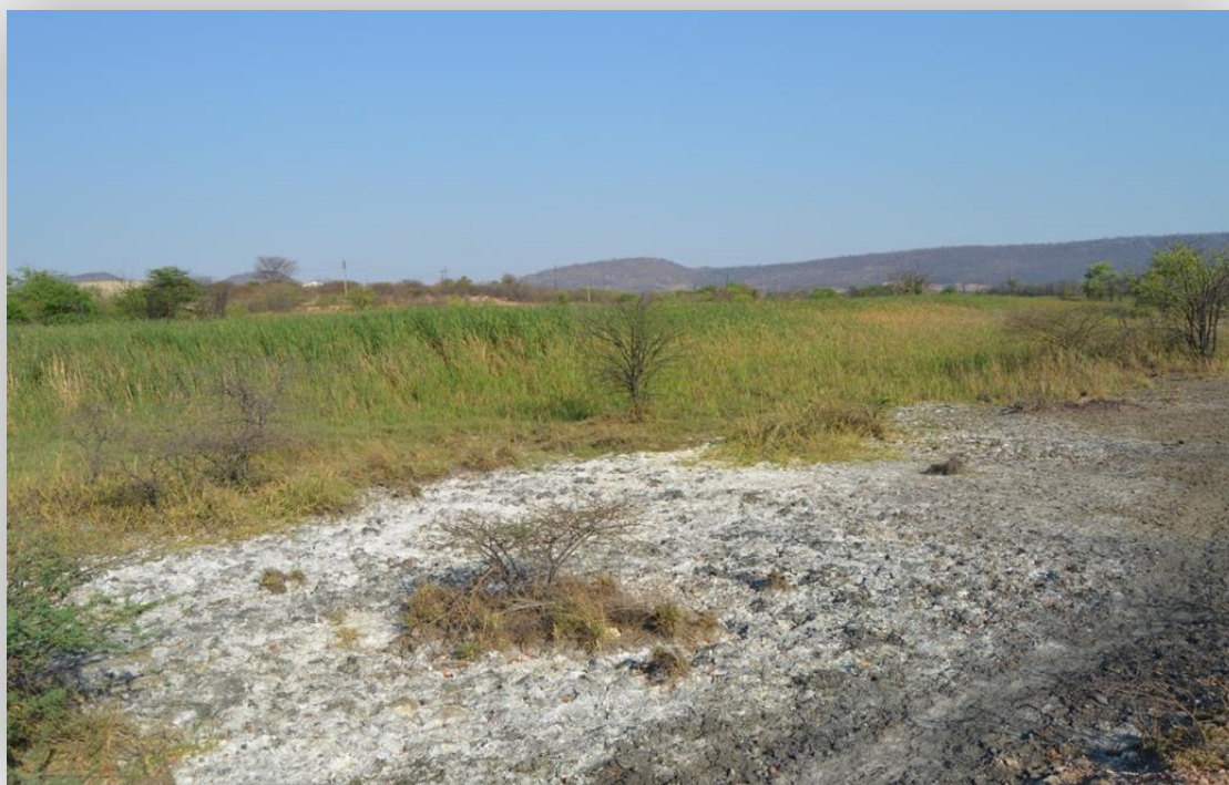
Fig 6; Coal ash leaking from pipes and has settled on wetland along Deka road

has also lead to the destruction of environmentally sensitive areas such as the two assessed wetlands located on the edges of the Deka road (S 18° 20' 10.9" E 026° 29' 04.0" & S 18° 20' 04.5" E 026° 29' 05.3" ) – See Fig 6 . A malfunctioning pipe carrying burnt coal ash leaked on the wetland thereby destroying it in the process.