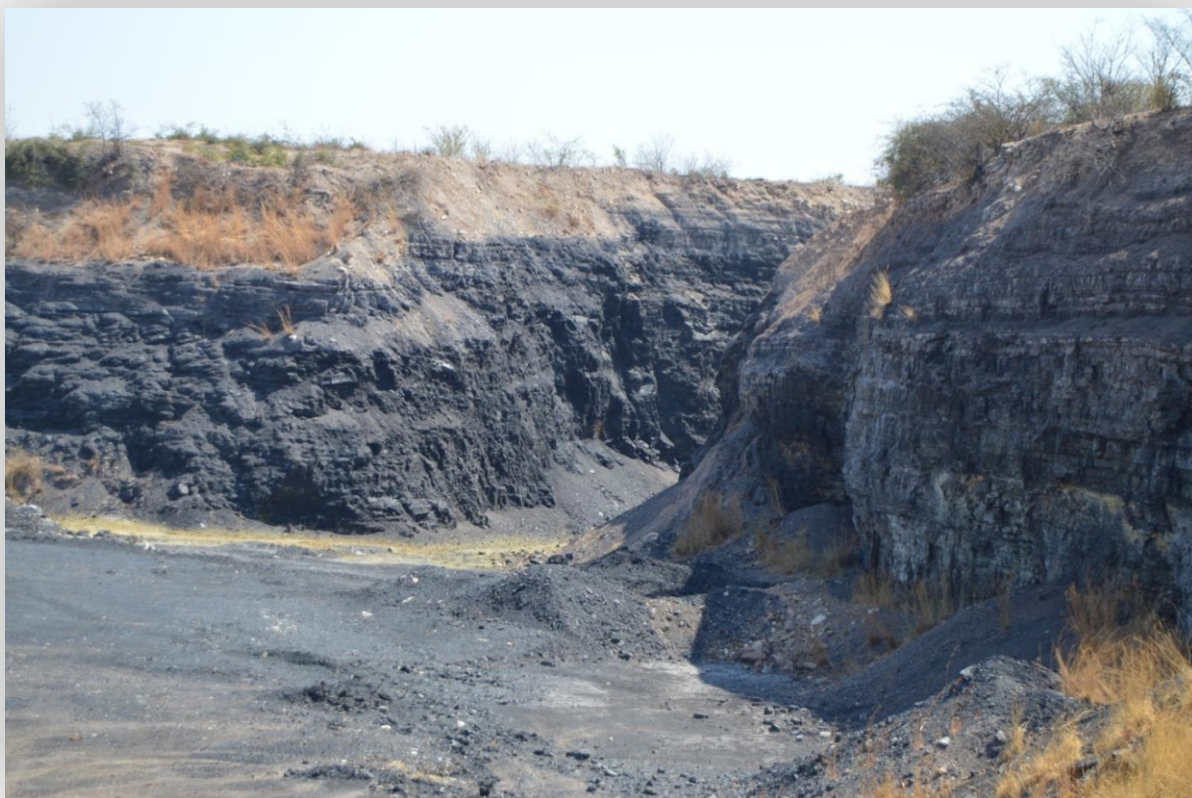
Fig 9; A large unrehabilitated open cast section at Hwange Colliary Company.

The receiving environment has been negatively affected by the presence, operation and maintenance of the mining infrastructure, since the landscape character (within limited areas) was altered and the overall visual resource reduced. The visual landscape of Hwange has been severely compromised by the thick dark grey smoke that is emitted from the burning of coal at the thermal power station. In addition, many of the vegetated areas have been converted into mining fields. Therefore, large forest areas are cleared to make a way for large opencast coal mines. Subsidence of surface takes place due to extraction of coal by underground mining. Subsidence is exhibited by cracks on surface and lowering of land in the worked out areas compared to surroundings. Large areas of land were subject to opencast mining at Hwange Colliary, W&K , Makomo and Chilota Mines ; these areas will take a long time to rehabilitate and will very likely lead to landscape scarring as these expanses of land will be incompatible with the surrounding landscape ( See Fig 9 ).