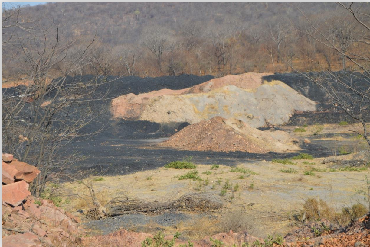
Fig 10: Stock piles of overburden left at Chilota mine