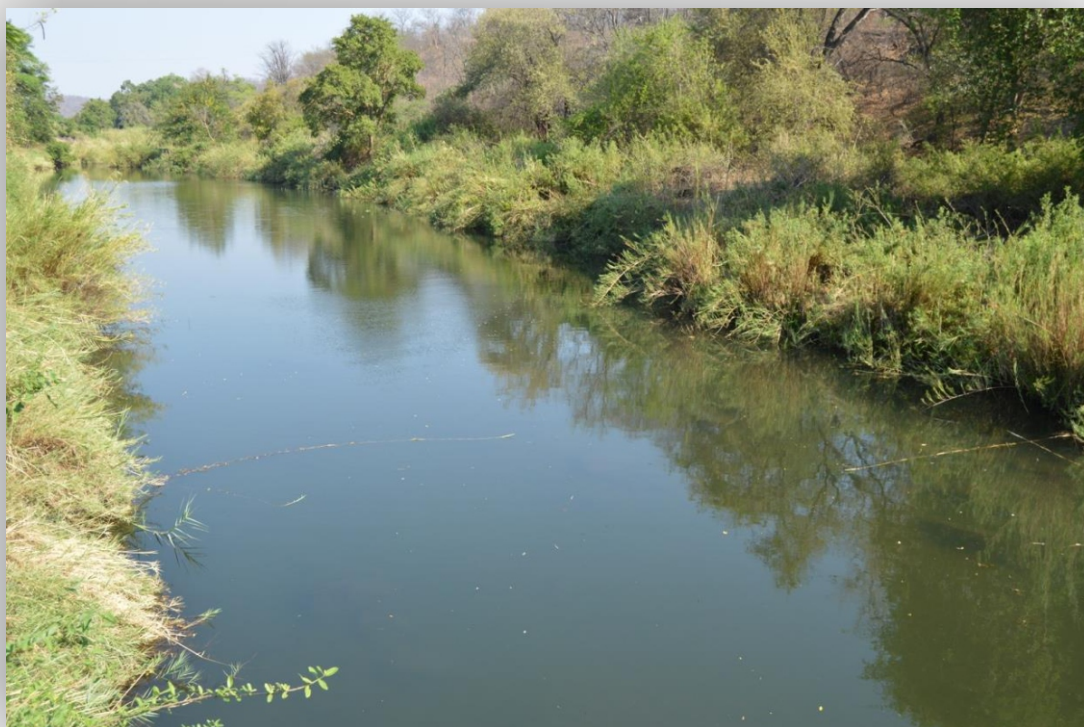
Fig 7: The water in Dheka river has changed color because of pollution.

We observed the following in the aquatic ecosystem within Deka River :