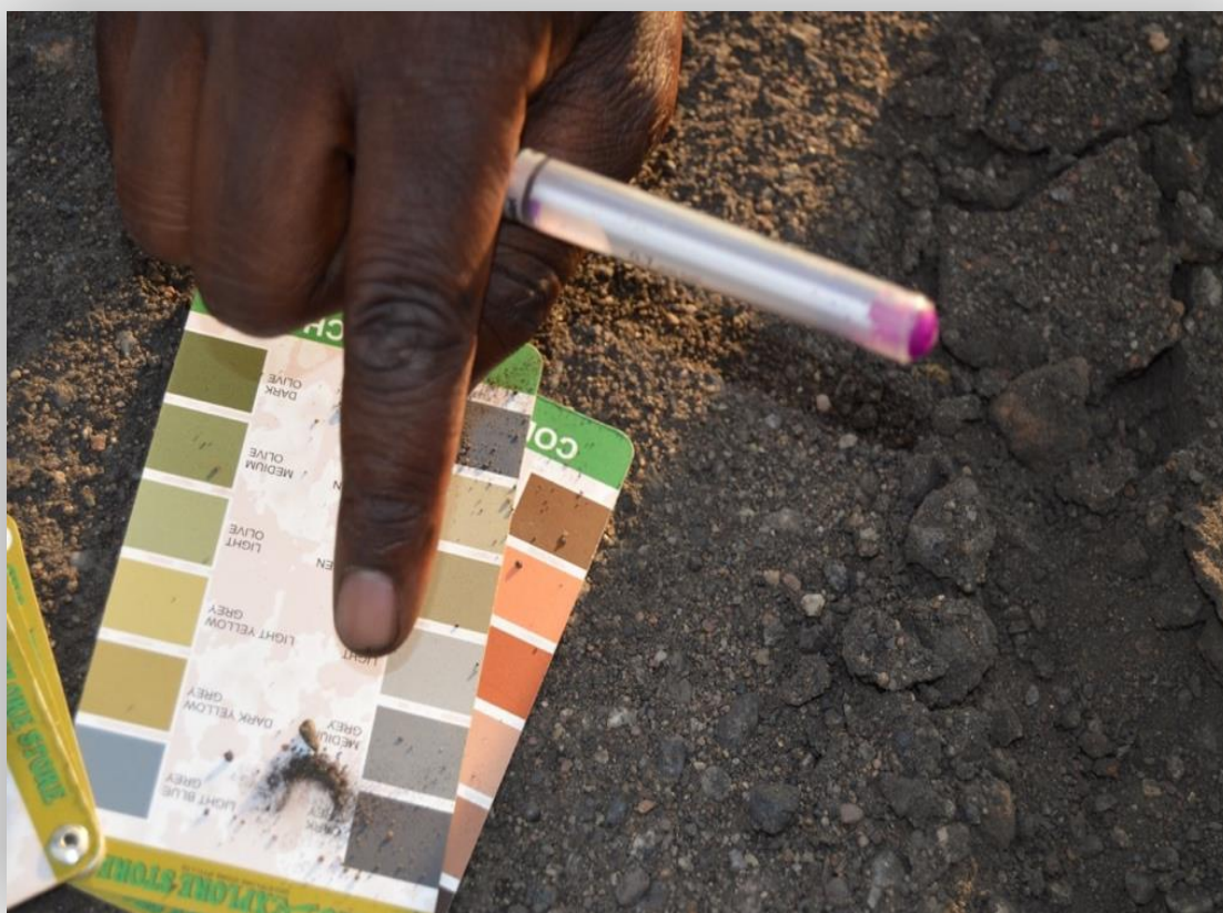
Fig 8 ; An illustration of the differences in contaminated soil colour & texture using the Munsell Soil Color Chart.

It has been noted with great concern that soils are heavily contaminated due to disposal of chemicals from the mining activities. This has greatly affected the growth of plants hence no trees are growing perfectly well in the area. Vegetation has been greatly affected hence the change of the balance between the rainfall patterns and evapotranspiration. Soil contamination has shown that the pH of the soils are highly acidic - up to 76%. Using the munsell soil colour chart (See Fig 8 ) , we were able to differentiate between contaminated and non contaminated soil at Makomo mine