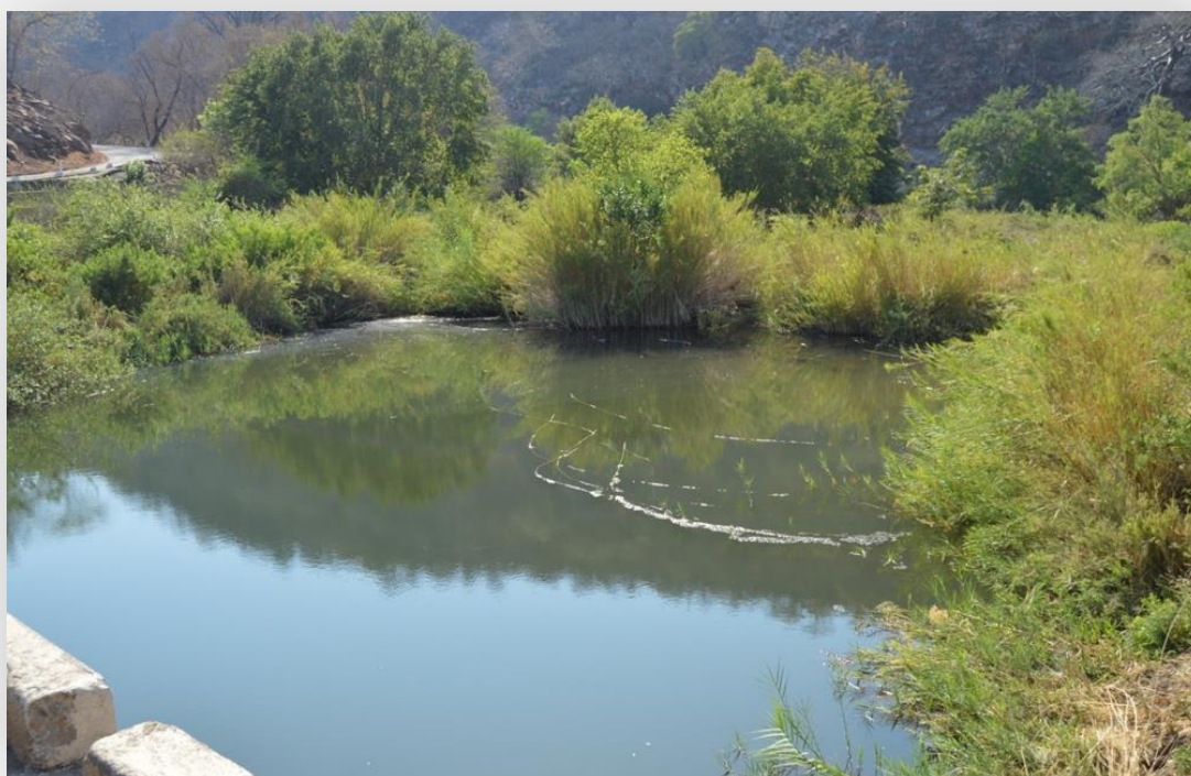
Fig 5; The accumulation of sediments deposited by Chilota mine is blocking the free flow of water in Dheka River

Open cast mining by the now disfunctional WMK mine affected ground water reserves through underground contaminations . This mine has since stopped operations leaving a trail of contaminated water sources as is shown in Fig 5 . These contaminated water sources is posing a health hazard to people as well as animals. Acid mine drainage produced by the leaching of sulphide minerals present in the coal has had a direct impact on drinking water quality, aquatic life and corrosion of equipment and structures. The water will be too acidic and is not suitable for domestic use. The erosion of stockpiles at Chilota mine has also led to sedimentation at the nearby Dheka river. Water contamination is also caused by coal dust settling on the surface water environment as well as from leaching and toxic drainage of particulates