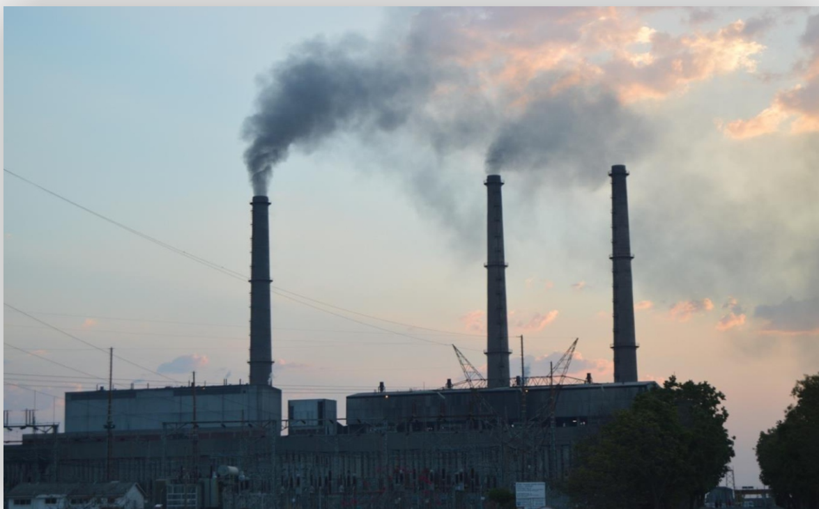
Fig 4: Black/Grey smoke emissions from Hwange power station

Coal fires are the largest contributor to the human-made increase of carbon dioxide in the atmosphere which can potentially trigger climatic changes. The ZPC burns an enormous quantity of coal which is used to generate thermal electricity. About 250,000 tonnes of coal are stockpiled on site. 10 Thick dark grey/black smoke is always seen rising from the three thermal chimneys at the power plant ( See Fig 4 ). Coal mining releases methane, a potent greenhouse gas. Methane is the naturally occurring product of the decay of organic matter as coal deposits are formed with increasing depths of burial, rising temperatures, and rising pressure over geological time. 11 A portion of the methane produced is absorbed by the coal and later released from the coal seam (and surrounding disturbed strata) during the mining process. Methane accounts for 10.5 percent of greenhouse-gas emissions created through