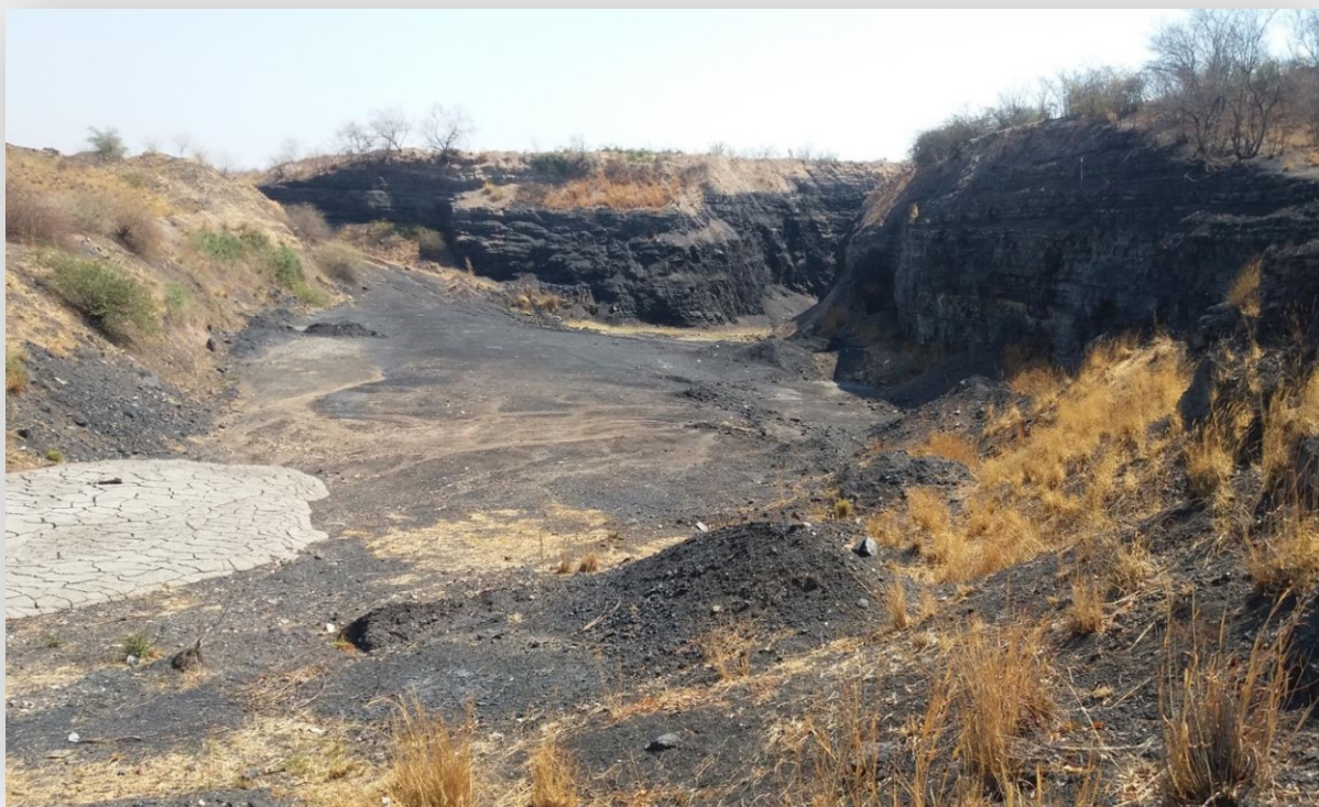
Fig 11; An open cast mine at Chilota also not rehabilitated