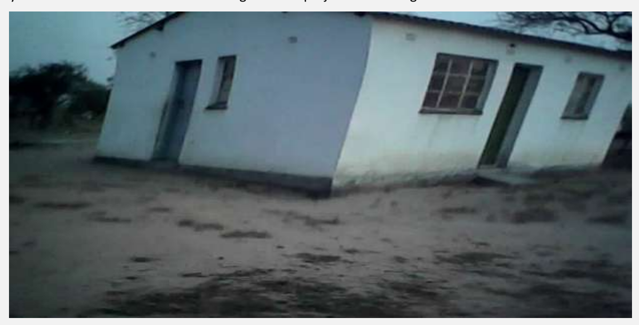
House at the local clinic for members of staff. Promises to provide electricity by the company were not fully met

The company embarked on electrifying the nearby school and clinic when it started mining operations in 2011 but the project was eventually abandoned. Request for the company to erect boreholes and build an irrigation scheme for the community in order to undertake a sustainable agricultural project has been ignored.