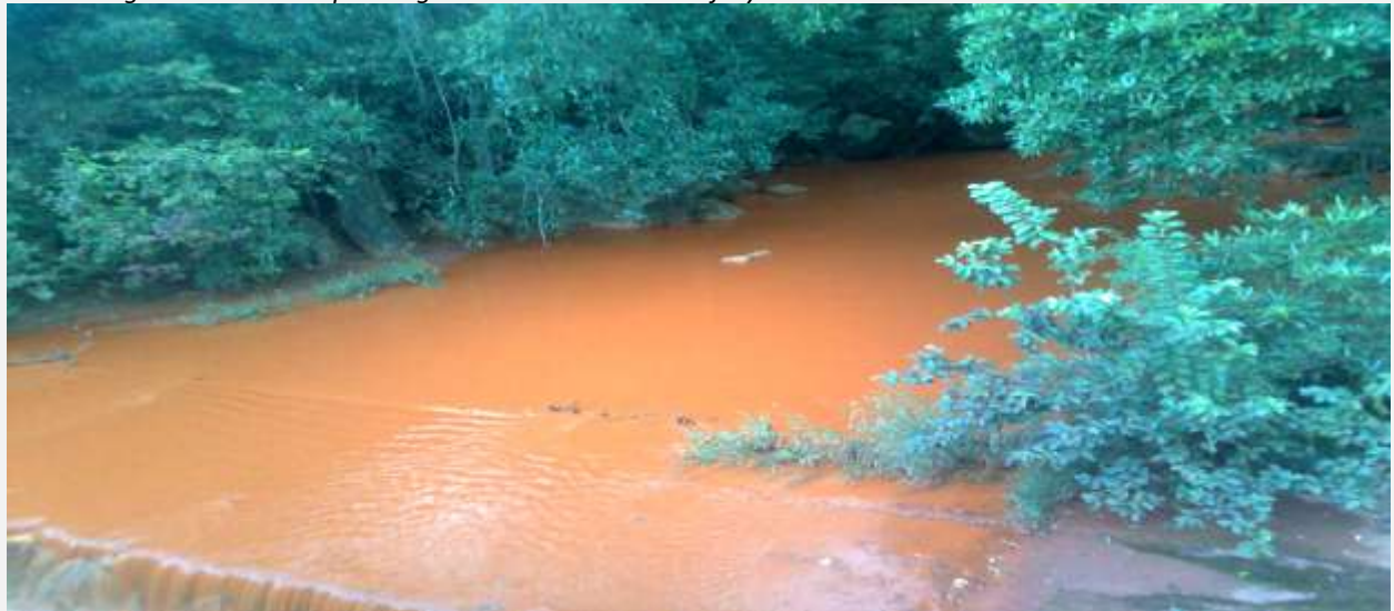
Fig 9 Muddy Nyabamba river caused by panning upstream in Chimanimani