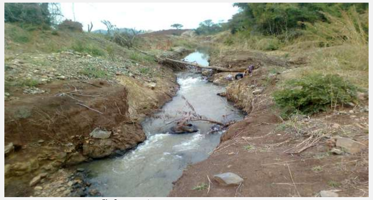
Fig 2: Diverted Mutare River at DTZ Premier Estate

Land preparation for alluvial mining means removal of all surface material and loss of biodiversity. Farming has been disrupted in Penhalonga because of mining and some farmers have agreed to US 8000 dollars to allow DTZ-OZGEO to mine on their land for the next three years.