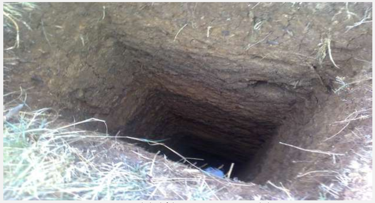
Fig 12 Deep holes left by panning activities in Penhalonga