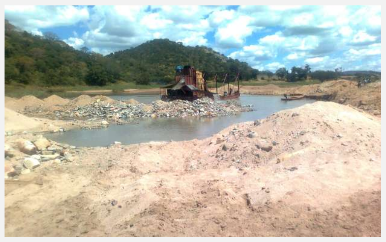
Fig 5 River damages caused by linefall illegal mining activities at Odzi