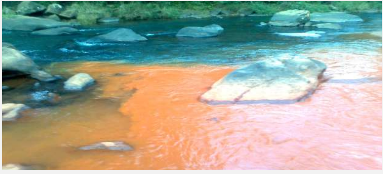
Fig 10 Mud water from Nyabamba river polluting Nyahode River