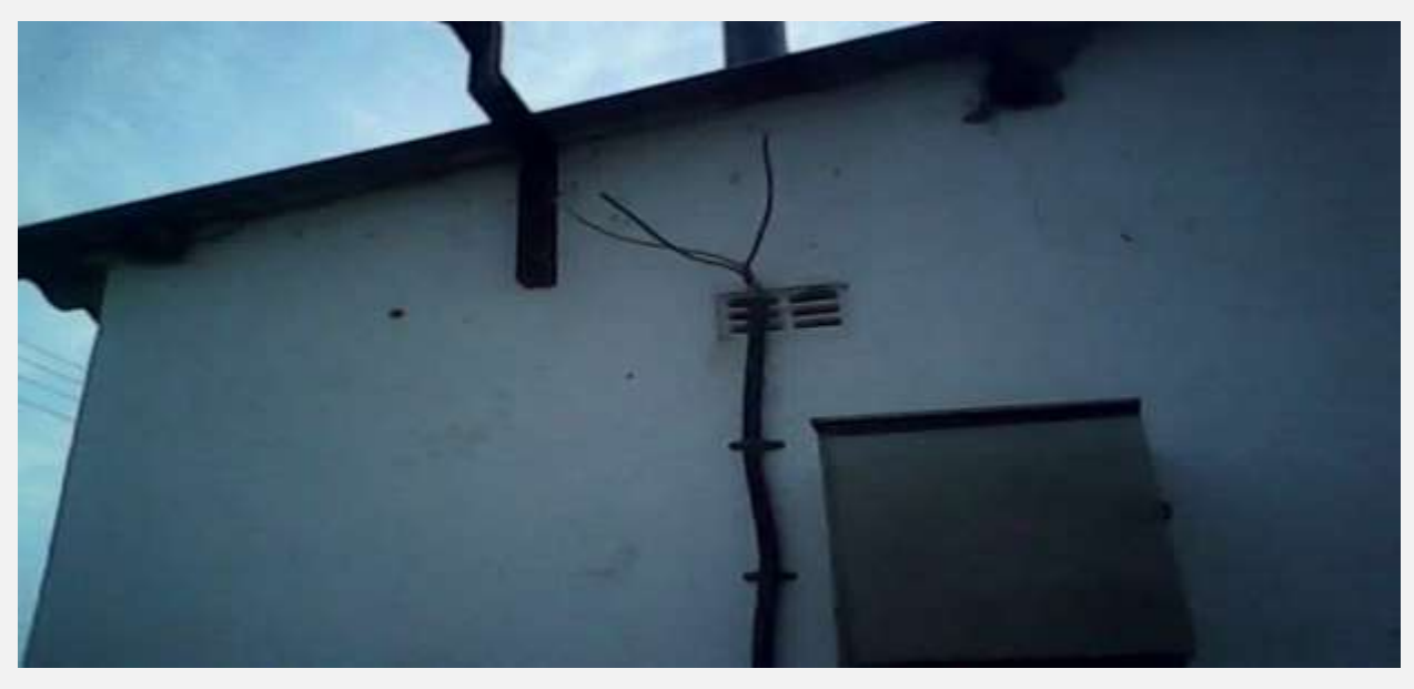
Abandoned electrification project that was started by Bayrich Enterprises in 2011 for Madzivire Primary school