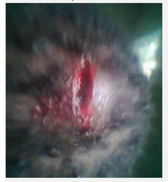
Tawanda'head injury from a gruesome attack