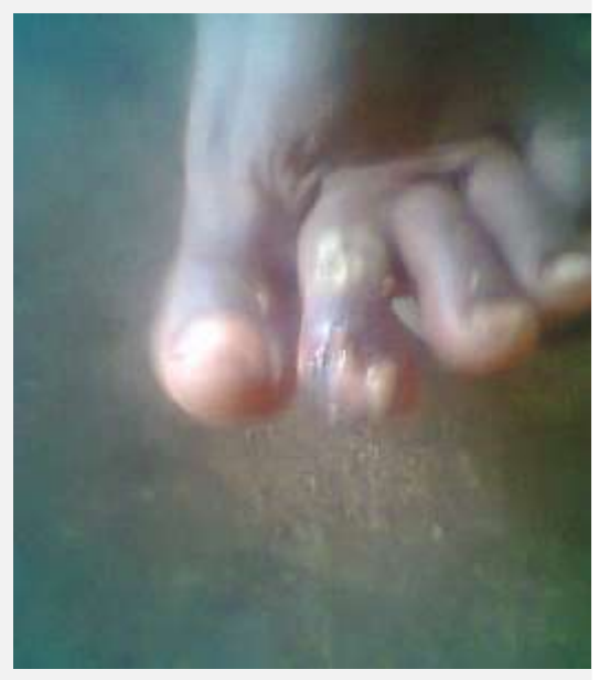
Clemence's dislocated toe from dog bites