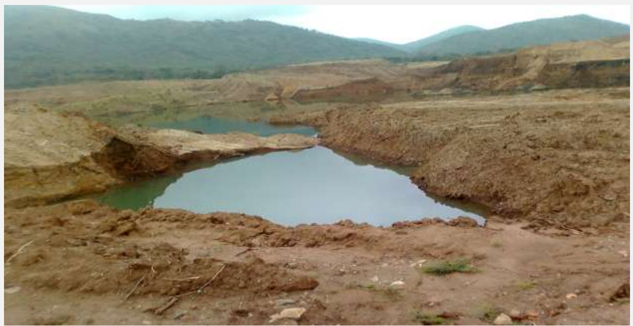
Fig 3: Impoundments affects natural flow of water

Alluvial mining in the river disturb the water source through sediment release and construction of impoundments that affect natural flow of river. This mining method destroy the riverine ecosystem and aesthetic beauty of the countryside.