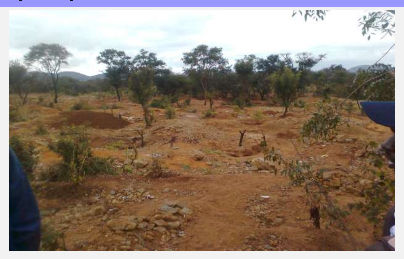
Fig 11 Panning site at Premier site in Penhalonga