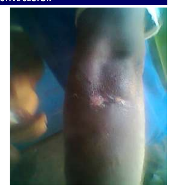
Edmore's healing dog bite wound.