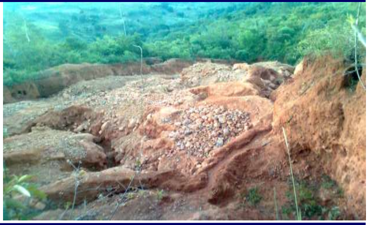
Compiled incidences of human rights abuses in Marange