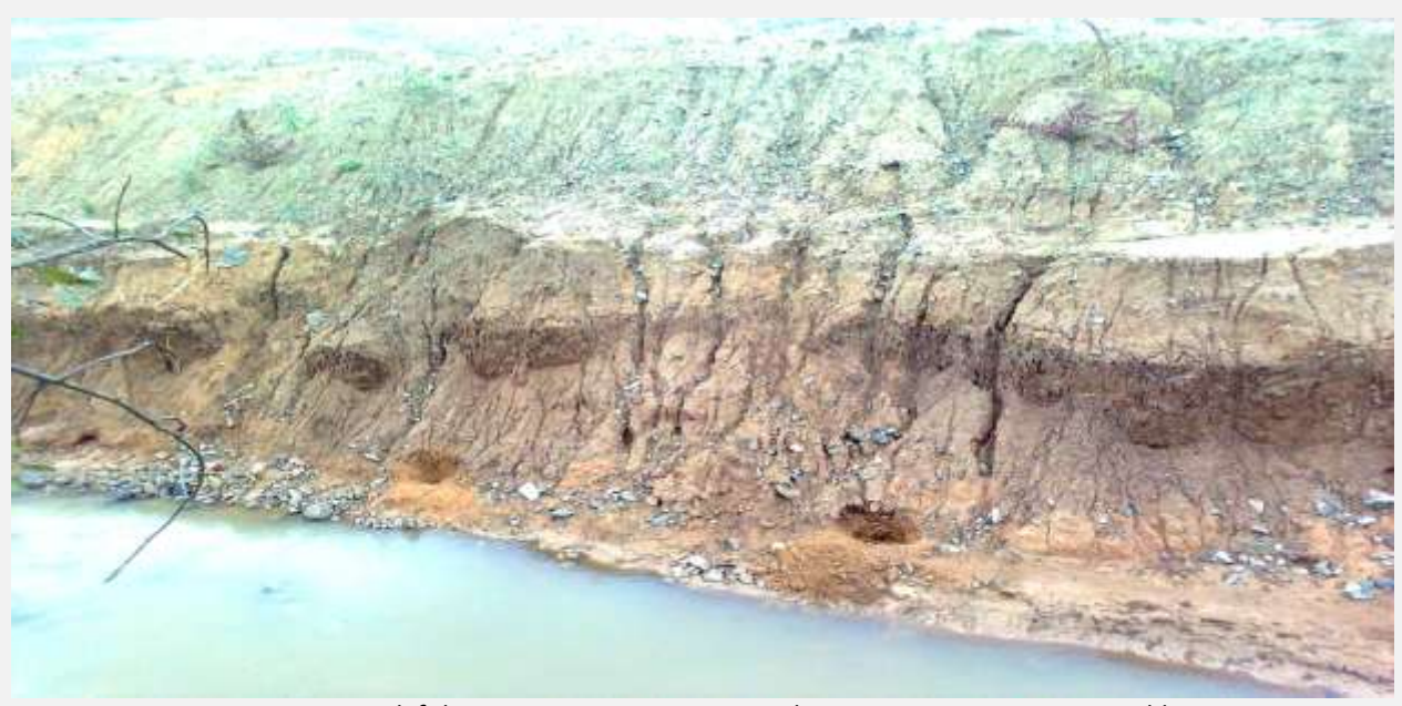
Fig 13 Pits left by panners in Mutare River where DTZ-OZDEO is mining gold