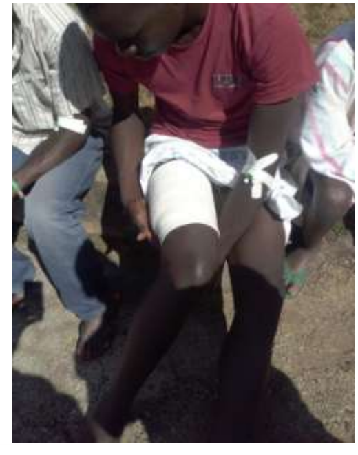
Gainmore's bandaged leg with bullets in it