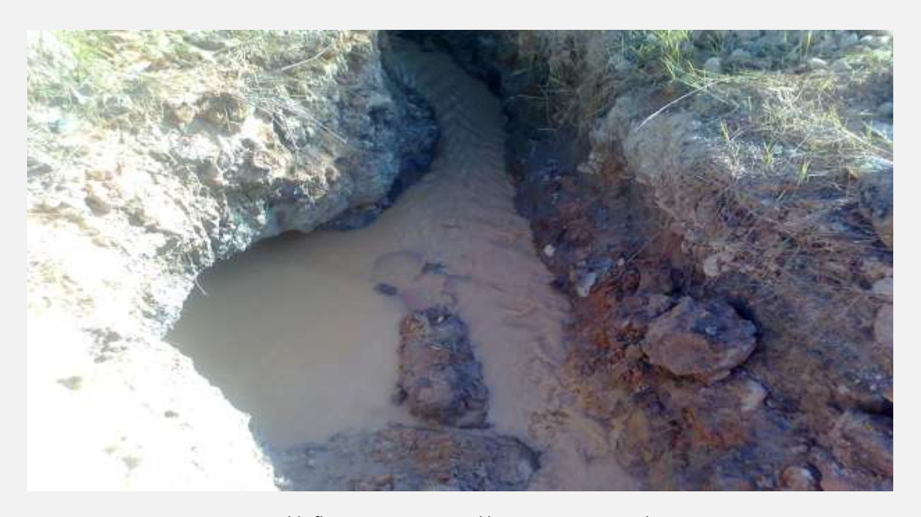
Fig 14 Muddy flowing stream caused by panners in Nyamukwarara