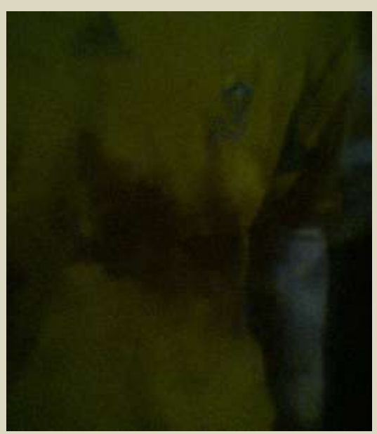
Quesdisani's bandaged hand and shirt with blood stains