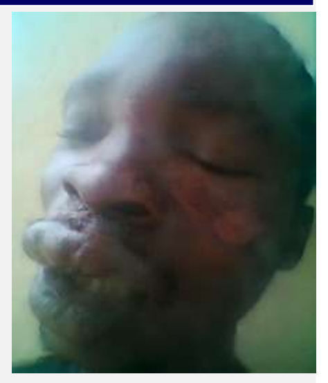
Trymore sustained serious dog bite injuries to his face and buttocks