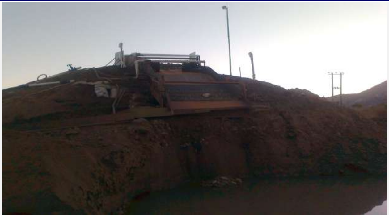
Fig 6 Concealed alluvial gold processing plant at Kinfrost illegal gold mining in Odzi