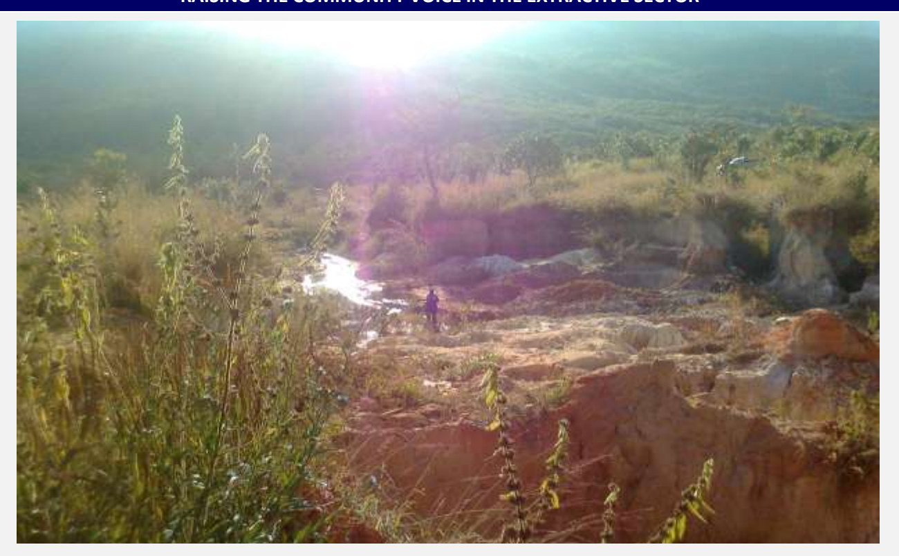
Fig 15 Alluvial gold panning stream Zimbabwean side Nyamukwarira