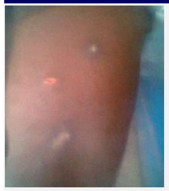
Farai recovering from dog bites injuries to his left arm