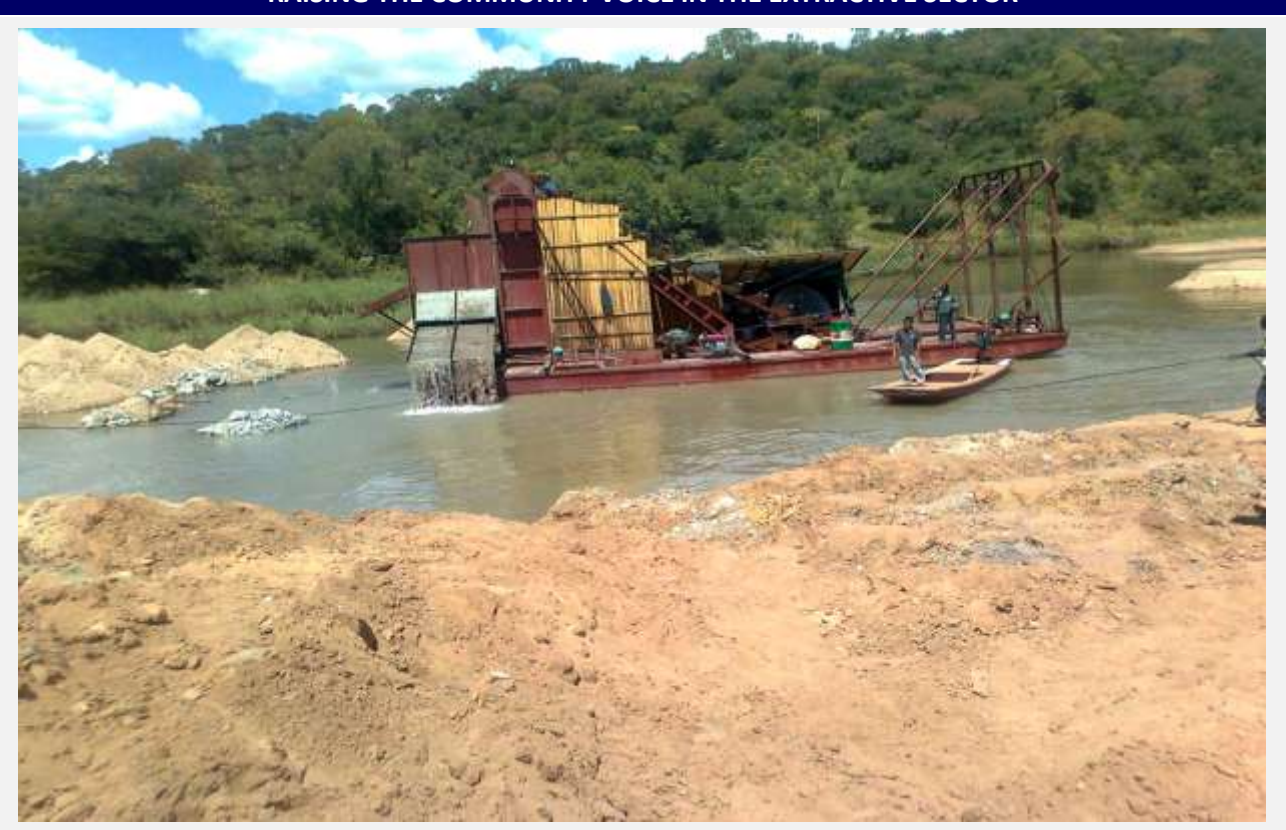
Fig 4 Rare boat mining equipment used by Linefall to extract gold in Odzi River illegally