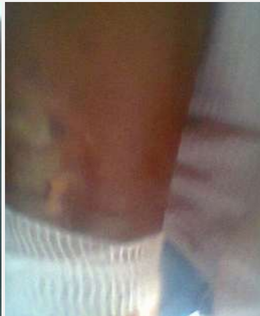
Blessing's bandaged hands sustained deep cut dog bites wounds