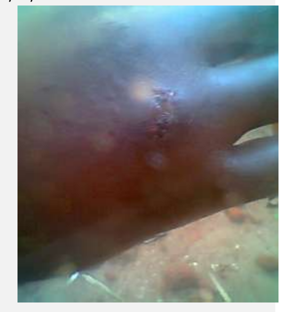
Challington's dog bite injuries