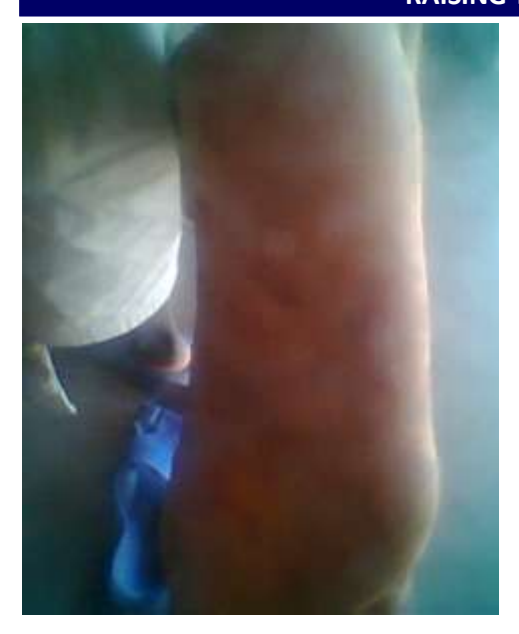
Bismark's swollen foot