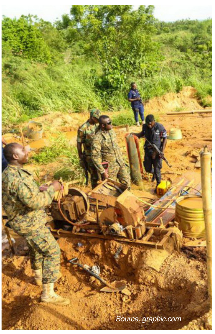
Members of government's Operation Vanguard (Galamsey Taskforce) at an abandoned illegal mining site

During the research, the majority of the community and district stakeholders asserted that abolishing galamsey was not the best option for the government. Abolishing galamsey, in the view of most community members will create mass unemployment and social vices like armed robbery. However, it was also apparent in all communities and from all respondents that there are so many people into small-scale mining without the proper licenses or permits to operate. The undocumented miners seem to be the worst culprits and the ones who failed to reclaim the land after their operations. In addition, they are the people destroying the river bodies. Most respondents recommended that the Government formalizes galamsey and weed all the bad companies out from it and ensure that the remaining ones follow proper mining techniques. Formalization will ensure that miners can be taxed to increase Government's revenue generation which in return could provide more developmental projects for the community.