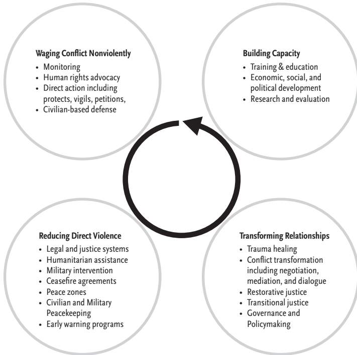
Figure 1: Map of Peacebuilding

aid, peacekeeping, human rights monitoring, reconciliation, and development work. Each of the approaches to peacebuilding requires a different, unique skill set. There are already organizations that have developed expertise in each of the different approaches to peacebuilding. While the needs in conflict are great, anyone considering taking part in a long-term peacebuilding process should reflect on their own skills and capacity and how they might coordinate with other groups to ensure that other needs are met.