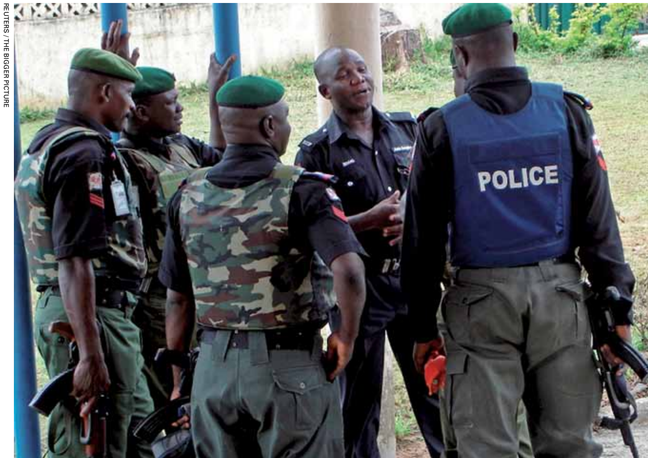
The Nigerian government emphasises physical security through the presence of military, police and intelligence agents, and pays minimal attention to human development issues, which are essential for sustainable national security.