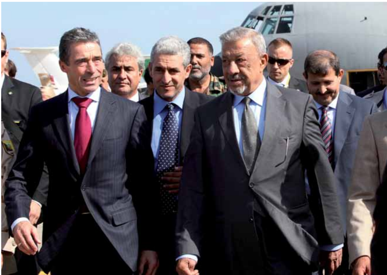
NATO Secretary-General Anders Fogh Rasmussen (left) walks beside the National Transitional Council's Defence Minister Jalal al-Digheily (right) upon his arrival at Mitiga airport in Tripoli (13 October 2011). Rasmussen hailed the end of the alliance's military intervention in Libya, which helped bring about the overthrow and death of Muammar Gaddafi.

powers, the Arab League, the United Nations (UN) and even some individual African states. Faced with the spectre of isolation, the AU repeatedly denounced what clearly became a regime change agenda spearheaded by the NATO powers on the fallacious justification of enforcing UN Security Council Resolution 1973 of 17 March 2011, with its emphasis on the protection of Libyan civilians. Yet despite denouncing the means, the AU reluctantly recognised the NTC as the legitimate government of Libya and authorised its occupation of that country's seat within AU structures.