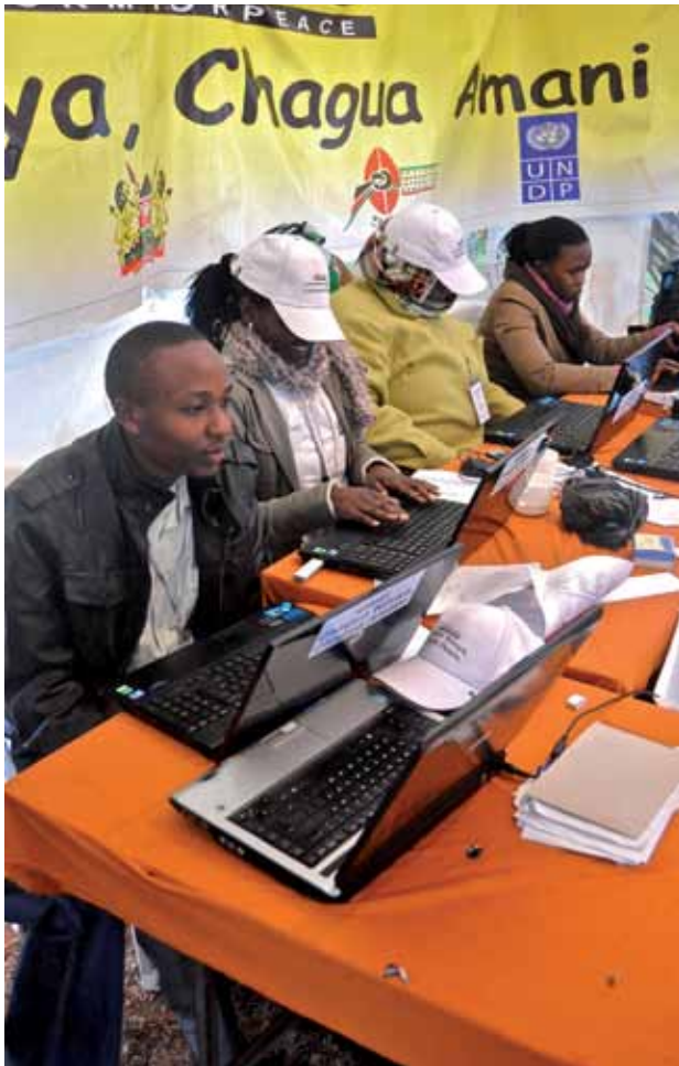
Uwiano staff members monitor results and peace messages at the 2010 Referendum National Tallying Centre at Bomas, Kenya (August 2010).

gathering information from a crowd but also empowering the crowd, or crowdfeeding, with information). However, crowdsourcing is only a complementary tool, and does not replace established methods of conflict analysis and early warning systems. The challenge then remains as to how these innovative social media tools and user-generated information can be utilised for and translated into localised and participatory preventive multi-stakeholder action in potential conflict situations.