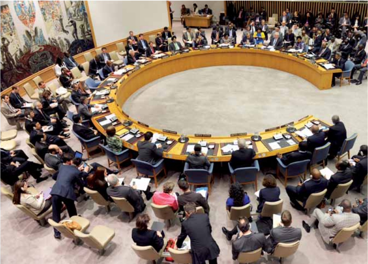
The United Nations Security Council is briefed by the Head of the African Union's High Level Ad Hoc Committee on Libya (15 June 2011).

kingdom under King Idris I, previously the Emir of Cyrenaica. Until the discovery of oil in 1959, Libya remained "one of the world's poorest countries" 1 . Yet wealth accruing from oil exploitation only contributed to antagonising the society against the King, especially Tripolitania and Fezzan, insofar as "[p]ower and wealth remained concentrated in the hands of the Sanusi monarchy and its tribal allies in Cyrenaica." 2 The King's close relationship with Western powers at a time of the rise of 'Nasserism' 3 in Egypt and Arab nationalism in the Middle East also contributed to alienating the regime further from civil society. During this period, Libya was engaged with Britain in extensive engineering projects and arms deals while allowing the United States of America (USA) to maintain its large Wheelus Air Base on Libyan soil.