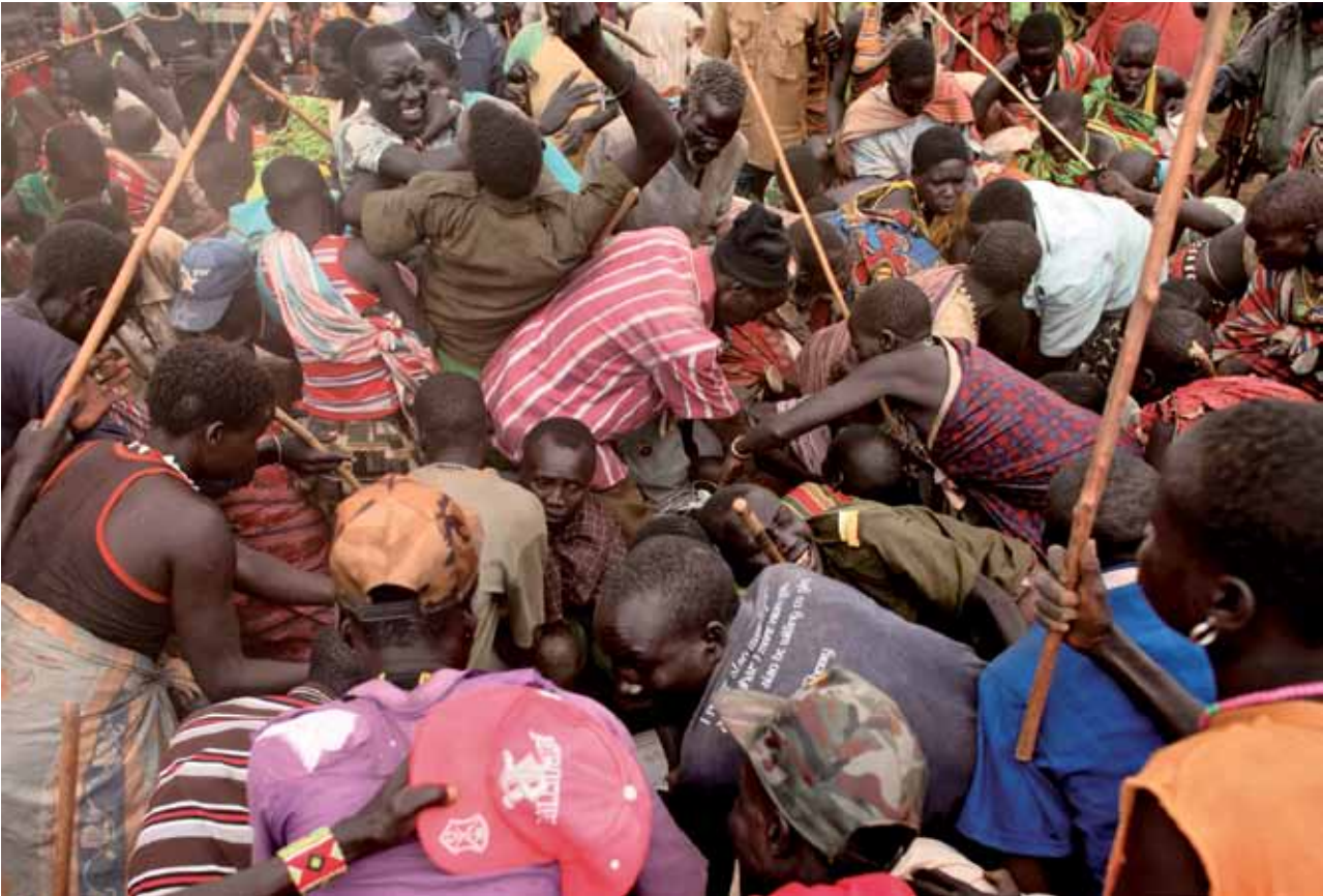
The causes of local violence in Jonglei state are complex and multi-layered and must be seen in relation to dynamic social structures and the political economy of the South Sudanese post-war society.

There have been three intermeshed sources of violence in Jonglei since 2009, all of which are rooted in the prevailing governance vacuum and legacies of the civil war. The first and most significant is the local violence between groups of 'civilians' (mainly youth) with both weapons and experience to conduct co-ordinated operations on a significant scale. The most spectacular among these groups has been the so-called 'White Army'. This was originally a loosely organised Nuer youth 'militia' which at times served as an auxiliary force to rebel factions during the second civil war. Although the White Army was officially dissolved in 2006 following a forceful and violent disarmament campaign led by the government, 2 its youth members were not integrated into the regular forces or civil service. Rumours regarding the alleged 'revival' of the White Army were reinforced when 8 000 heavily armed people from the Lou Nuer areas attacked multiple Murle settlements in Pibor County in December 2011, causing widespread killings and displacement of the civilian population. The attack was a continuation of a cycle of revenge attacks in the region since 2009. Members of the South Sudanese diaspora in the United States claim to speak on behalf of the group, but it is difficult to ascertain the strength of their link with the rural youth in Jonglei. 3