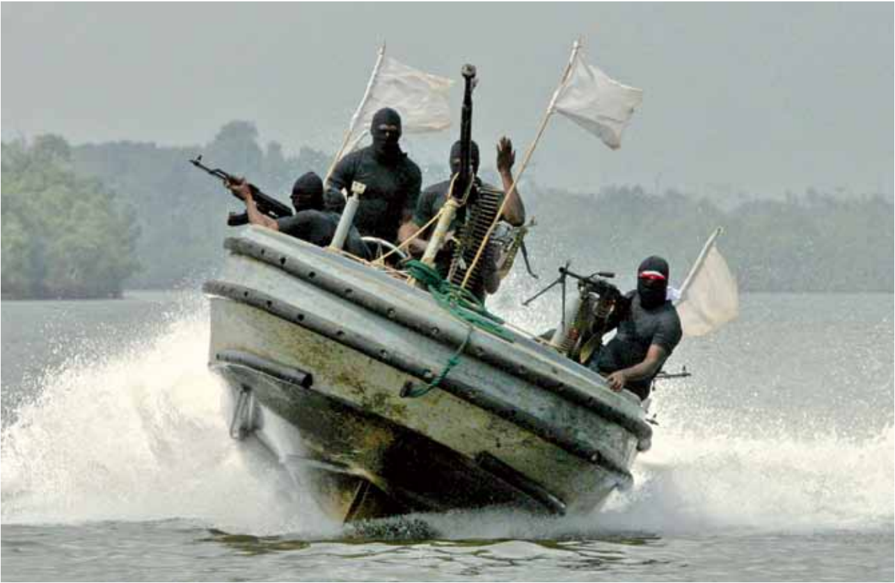
Militants patrol the creeks of the Niger Delta region of Nigeria.

governmental policies. 19 Somalia, however, most graphically reveals how the absence of governance on land can spiral out of control at sea with national, regional and global security repercussions. This can result in an international response (including African actions) to address the offshore equivalent of bad governance on land.