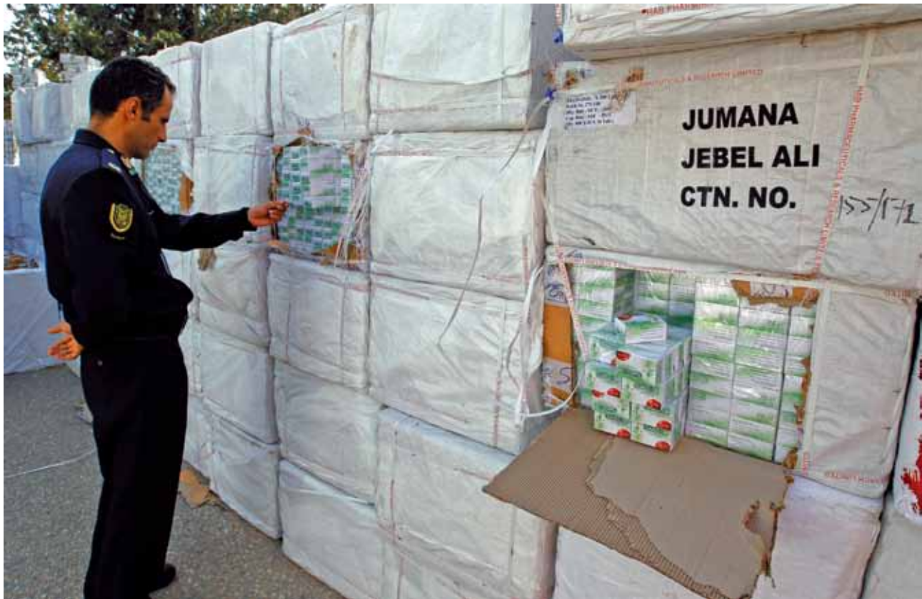
A Libyan police officer inspects a haul of prescription drugs seized from a shipping container in Tripoli. The drugs were hidden in containers that were identified as furniture, sports equipment and marble tiles (March 2011).

as non-African powers must be aware of this potential flashpoint at sea, and one holding the potential to spill back onto land as well.