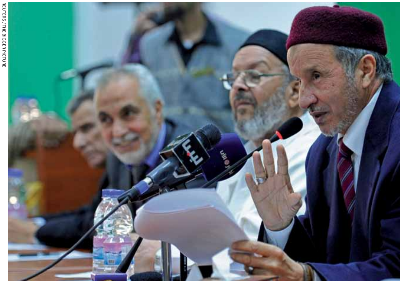
REUTERS / THE BIGGER PICTURE

TO GAIN CERTIFICATION FOR EXTERNAL SOVEREIGNTY, WHICH IS ESSENTIAL TO ESTABLISH INTERNATIONAL RELATIONS, THE GOVERNMENT NEEDS TO EXERCISE EFFECTIVE POWER OVER ITS TERRITORY AND CITIZENS