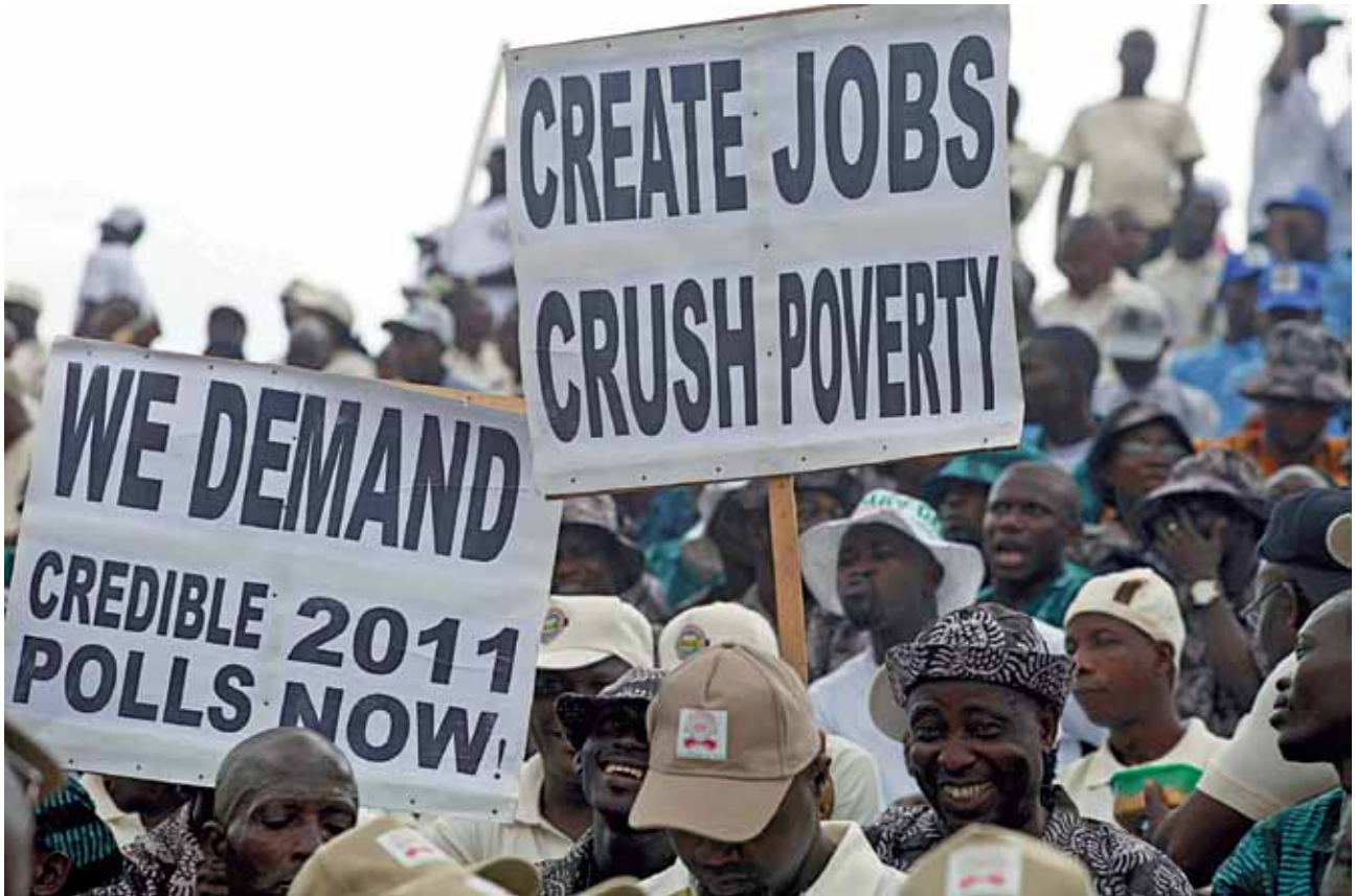
The Nigerian leadership has failed to reduce poverty and avert all forms of socio-economic and political exclusions as a way to avert human insecurity.

safety of its citizens. Intelligence gathering is thus the official secret collection and processing of information by a State or its agencies for national security.