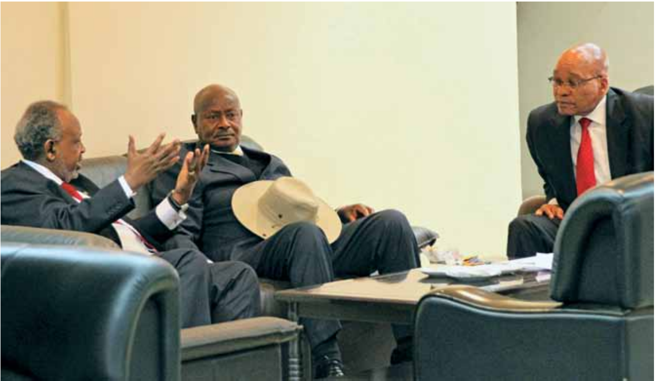
Djibouti's President Ismail Omar Guelleh (left), Uganda's President Yoweri Museveni (middle) and South Africa's President Jacob Zuma (right) talk during an emergency summit of the African Union's Peace and Security Council in Ethiopia, following the African Union's call for the formation of an inclusive transitional government in Libya (26 August 2011).