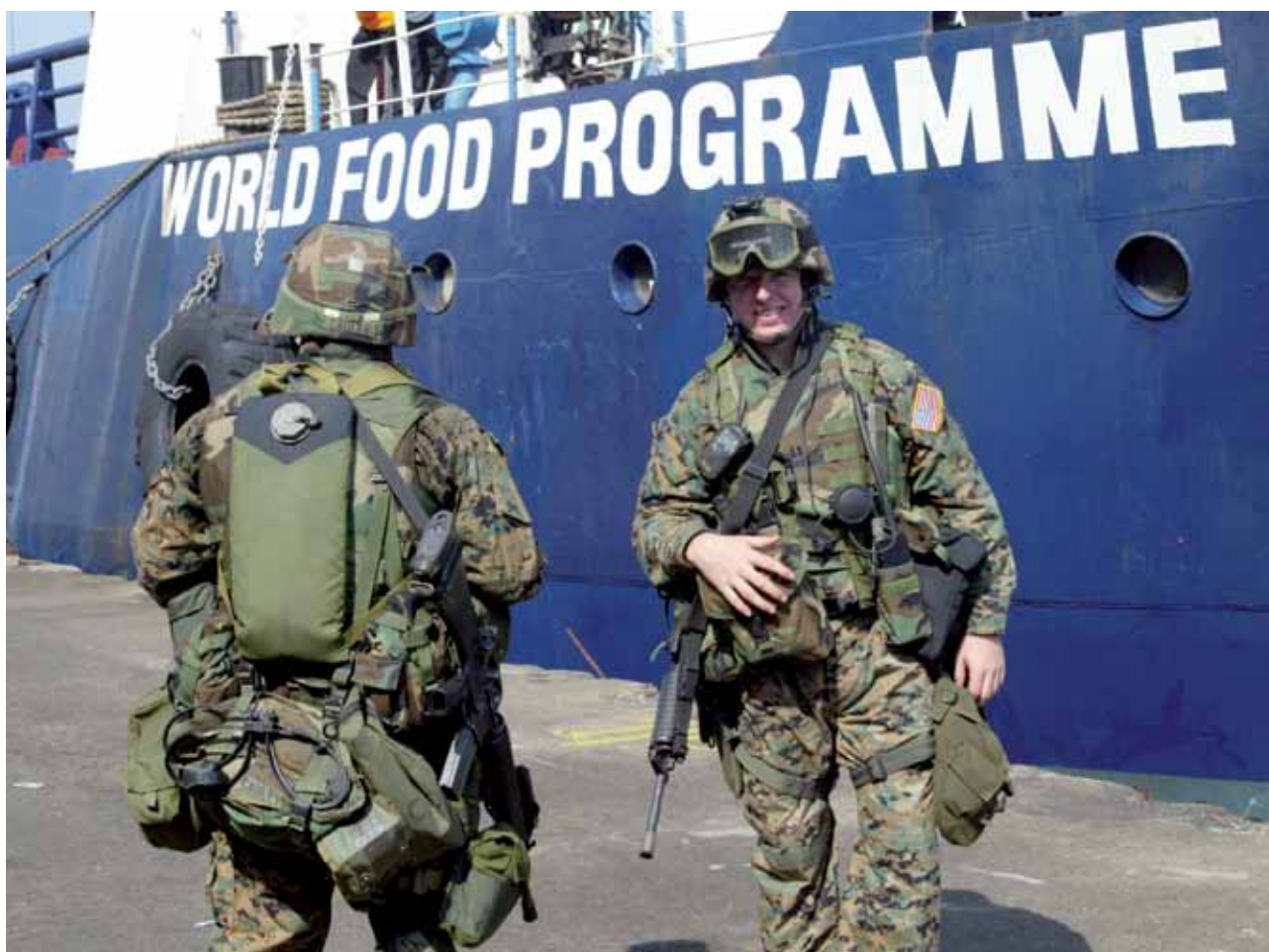
Marines guard a World Food Programme relief ship at Freeport in Monrovia, Liberia (August 2003).

incidents of piracy off the east coast of Southern Africa are rare, South Africa thought it well to deploy a small military contingent of naval and air assets as a preventative measure. The South African deployment takes place through a bilateral agreement between South Africa and Mozambique with Tanzania having expressed an interest to join. 22 These actions resonate with the Southern African Development Community's (SADC) 2011 statement of intent in Luanda, Angola, about a maritime strategy for its western and eastern shores. It is also a direct African maritime response to the threat of bad order at sea. In this way the SADC stance on maritime security through its Standing Maritime Committee is operational through Operation Copper in SADC territorial waters. Although not showing the landward-offshore interface found in the Gulf of Guinea and off the Horn of Africa, the early response through Operation Copper depicts a growing understanding of prevention as a pathway to maintaining good order at sea. However, the military response is once again the option used to respond to a possible maritime threat.