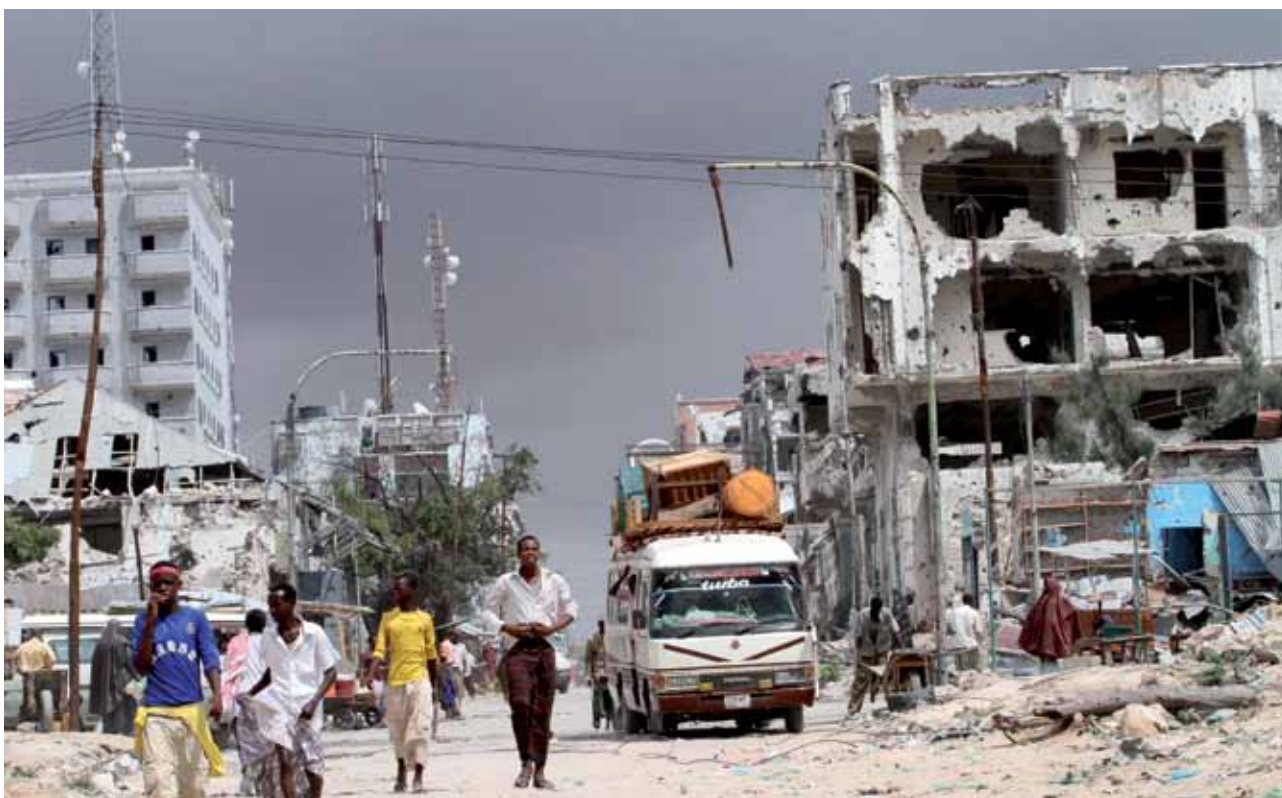
Somalia has an ineffective government and has been a failed State since 1991.

The creation of States has largely been a new phenomenon and the claim is backed by the rights to self-determination. However, the rights stipulated in the UN charter were in support of the decolonisation process and respect for the principle of equal rights. Following the end of the Cold War, the assumption in the UN Charter as well as the concept and interpretation of self-determination changed in both approach and meaning. With the end of the Cold War many regional minority groups' claims for secession increased and this resulted in significant tensions and triggered wars. A good example is provided by the former Soviet Union.