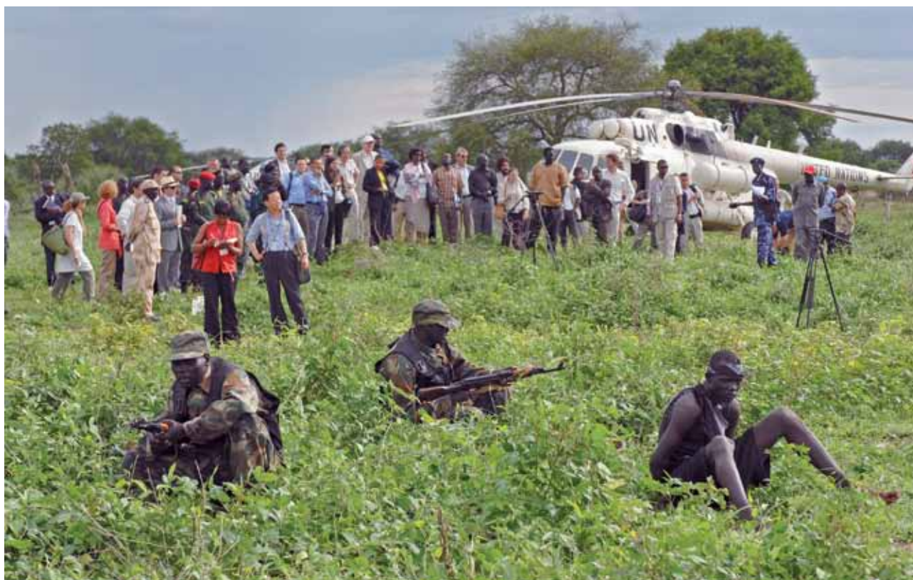
Members of the United Nations Security Council delegation visiting South Sudan watch a demonstration by the Livestock Protection Unit of the South Sudan Police Service in Malau, Jonglei State (24 May 2011).

based on seasonal migration. Marriage is a concern for the extended family with the groom usually receiving assistance from his father and relatives when collecting cattle and cash for bridewealth. As many lost their parents and paternal relatives during the war, this could have reduced their capacity to mobilise adequate resources for marriage. Concomitantly, an influx of oil money into the South Sudanese economy has increased the demand for cattle and there are indications that the cost of marriage for young men has increased significantly. 14 However, while cattle remain the preferred bridewealth currency throughout the countryside of South Sudan, the number of cows required varies widely between the different communities. In some areas, especially in urban centres, it is not uncommon to pay part of the bridewealth in goats and cash.