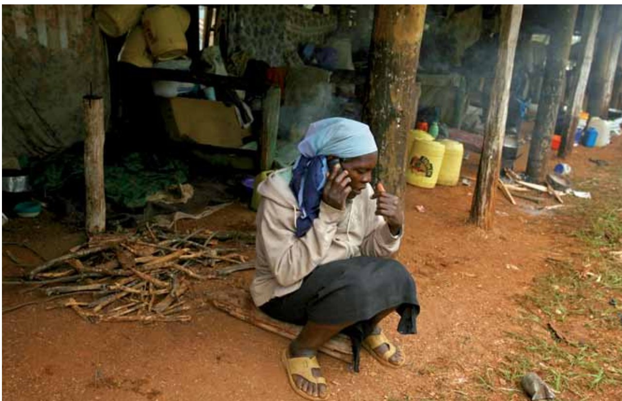
The use of mobile phones in developing countries has been found to be the best option for crowdsourcing as mobile network coverage is continually increasing into formerly hard to reach rural locations.

generation approaches like conflict analysis. On the contrary, technology plays a more complementary role, working to strengthen existing mechanisms. In some cases, for example the Economic Community of West African States Early Warning and Response Network (ECOWARN) in West Africa and Kenya's Conflict Early Warning System, a hybrid system is adopted where traditional conflict analysis methods are intertwined with crowdsourced information.