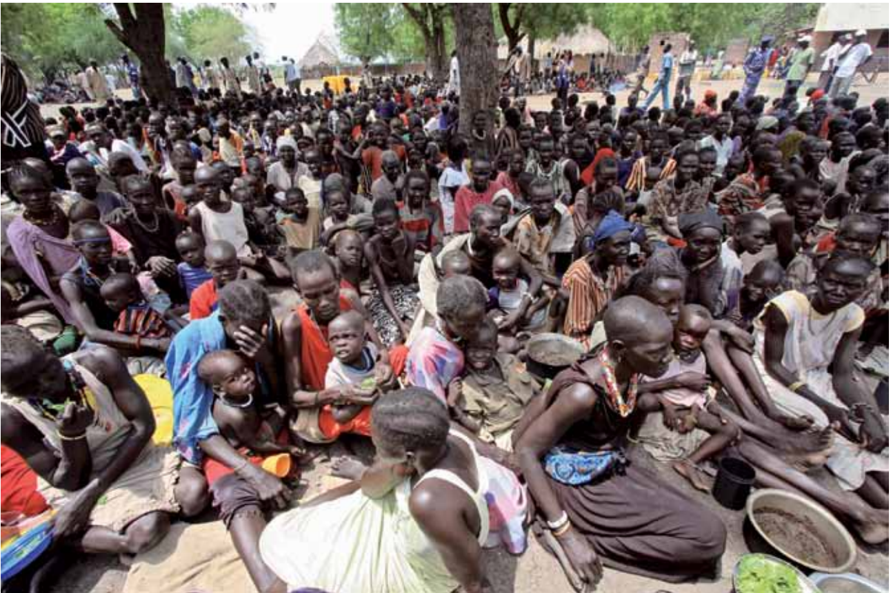
Internally displaced Sudanese wait for food, water, and health care at Akobo camp in South Sudan’s Jonglei State (May 2009).

sector include professionalising, demobilising, disarming and reintegrating military personnel; expanding, equipping and training the civilian police force; and disarming a highly militarised ‘civilian’ population. Various schemes to provide youth with alternative sources of income and employment are also included in the community security programmes. 6 Peace negotiations and conflict mitigation have been pursued at different levels, for example, between the government and armed rebels, as well as third party mediation between groups of civilians with hostile relations. The United Nations Mission in Sudan/South Sudan (UNMIS/S), church representatives and local politicians have been active in the latter type of mitigation. Patrolling, pre-emptive deployment and information gathering also form part of the United Nations (UN) mission’s early warning and stabilisation efforts. 7