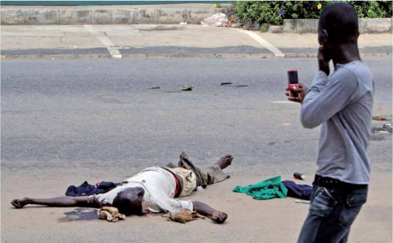
Crowdsourcing facilitates the transfer of important information directly from the source in a crisis situation to responsible stakeholders capable of responding and possibly mitigating further escalation.

to targeted topics or issues, and then allows for this information to be geographically mapped. Crowdsourcing 1 has had considerable success in the field of humanitarian action and crisis management. It was used for the first time during the 2008 post-election violence in Kenya to alert authorities of outbreaks of violence, and again in the 2010 Haiti earthquake used to alert rescuers and relief workers of survivors and needs on the ground. With the success of crowdsourcing in crisis management, there is now a need to further explore the ability to add value to conflict prevention by engaging people locally in collaborative efforts for early warning and timely response using crowdsourcing to not just respond to the crises but to prevent violence.