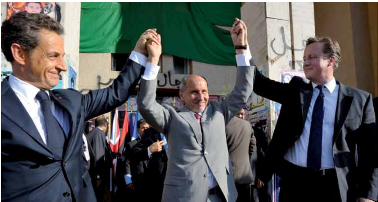
France's President Nicolas Sarkozy (left), National Transitional Council head Mustafa Abdul Jalil (middle) and Britain's Prime Minister David Cameron (right) join hands in a show of united support in Benghazi (15 September 2011).

regime. Like many other African countries, Libya is a mosaic of cultures and demographics. Due mainly to its position on the Mediterranean Sea, Libya has been exposed at different periods of its history to cultural interactions with Ancient