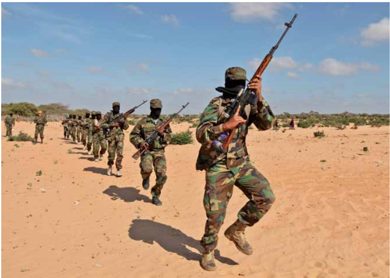
REUTERS / THE BIGGER PICTURE

Political threats unfold as interstate competition rises in the offshore domain. The confluence of unsettled maritime boundaries and almost unprecedented discoveries of offshore hydrocarbons with the potential to dramatically change the economic status of African countries raise interstate conflict potential. 12 In addition, foreign rivalry at sea through the deployment of naval vessels under the guise of anti-piracy reflects a further political power play for influence. This is most visible off the coast of east Africa in the multinational naval task forces and independent deployments of naval vessels that range from between 20 to 30 vessels at a time. 13 African countries, as well