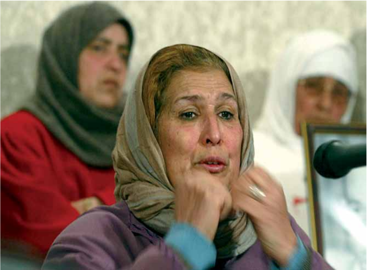
A victim of Morocco's 'Lead Years' testifies during a public hearing organised by the Equity and Reconciliation Commission in Figuig, eastern Morocco (January 2005).

transparent governments. However, transitions are incomplete if revolutionaries merely claim elections and re-written constitutions as victory. In places where little trust exists between citizen and state, Truth and Reconciliation Commissions (TRCs) may be the key to meaningful democratic transition and complete resolution of conflict.