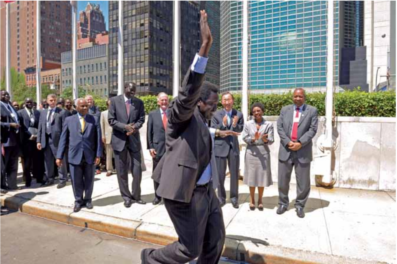
A South Sudanese delegate celebrates as the flag of the Republic of South Sudan is raised on the occasion to mark the admission of the 193 rd member State to the United Nations.

lack of clear criteria for statehood and for legitimate secession have encouraged the emergence of numerous secessionist movements and thereby threatened the peace, stability and territorial integrity of the existing states in Africa. 1