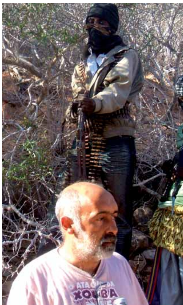
REUTERS / THE BIGGER PICTURE

An ongoing debate explores how the link between al Shabaab insurgents, the Somali pirates, and al Qaeda in the Arabian Peninsula can possibly play out at sea off the