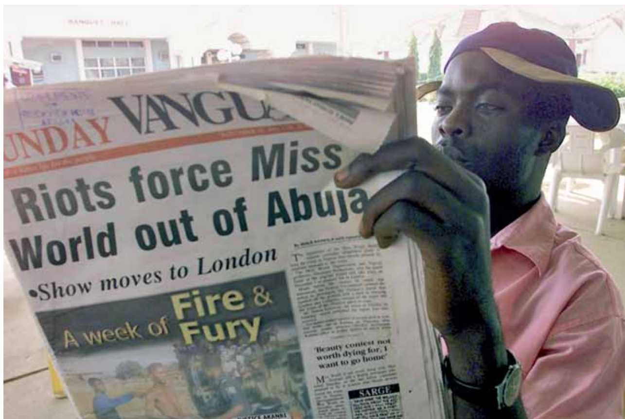
REUTERS / THE BIGGER PICTURE