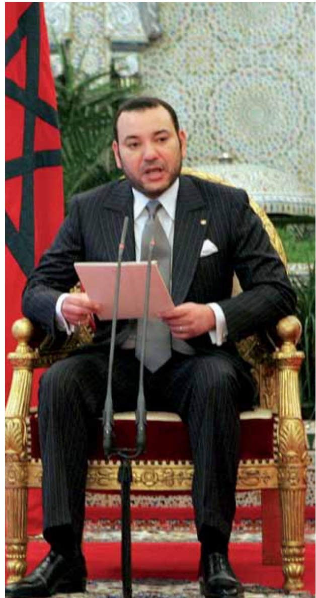
Moroccan King Mohammed VI addresses the nation to demand the application of the recommendations of the Commission of Equity and Reconciliation to end the impunity of those who violate human rights and to apologise officially to the victims (January 2006).