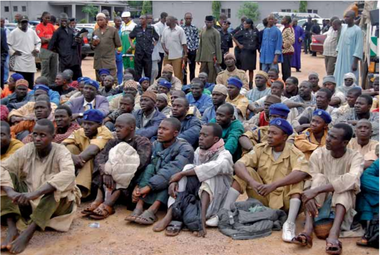
Members of Boko Haram (seated) following their arrest in Kano, Nigeria.

the northern part of the country. The consequent decline in internal security and the reactions it has elicited from the State raises important questions about the effectiveness of governance and security agencies in the country. This article therefore attempts to situate the problem of insecurity in Nigeria within the context of governance and intelligence gathering, with a particular focus on the Boko Haram uprising.