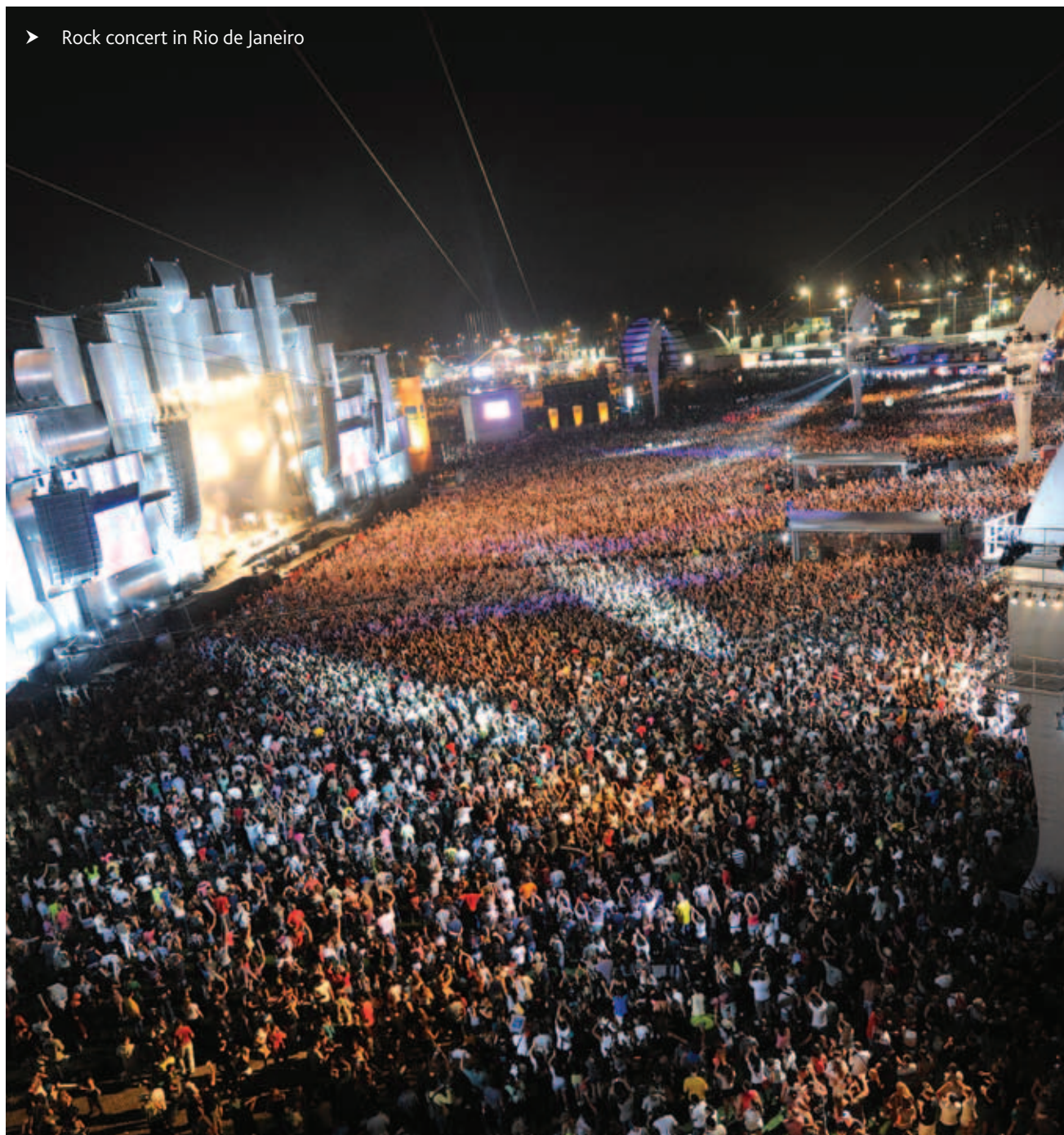
► Rock concert in Rio de Janeiro