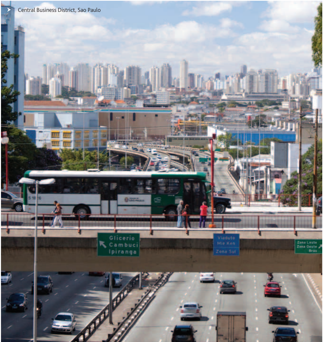
▶ Central Business District, Sao Paulo