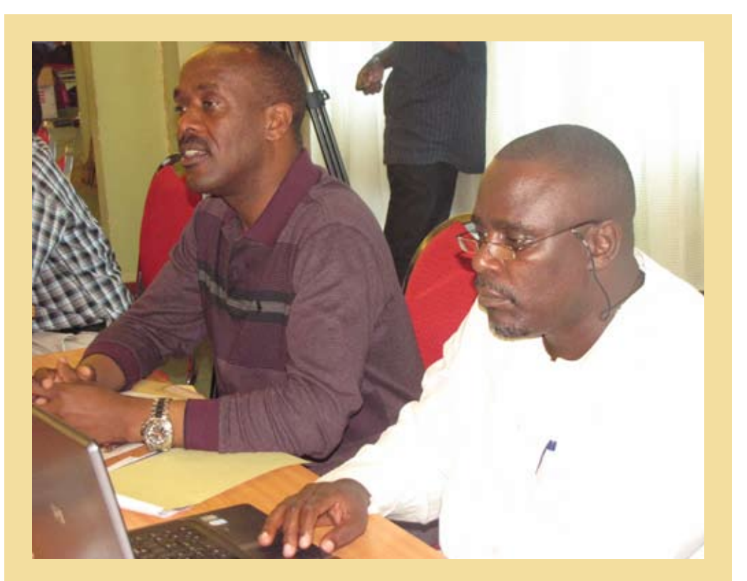
Hon. Banyenzaki (right) giving introductory remarks.

The opening session was kicked off by introductory remarks delivered by Hon. Henry Banyenzaki, Chairman of the Parliamentary Network on the World Bank and MP for Rubanda West. Banyenzaki emphasised the importance of collaboration between different stakeholders in order to enhance transparency in the management of the oil and gas sub-sector. He appealed to the Ministry of Energy and Mineral Development to involve all the stakeholders in the development and management of the oil resources to avoid mistrust and associated conflicts. The Minister of Energy and Mineral Development, Hon. Hilary Onek, who officially opened the symposium, acknowledged the roles that civil society and Parliament are playing including creating awareness and conducting analytical research that inform government decisions. The Minister also articulated the progress of the implementation of the Oil and Gas Policy, 2008 by government.