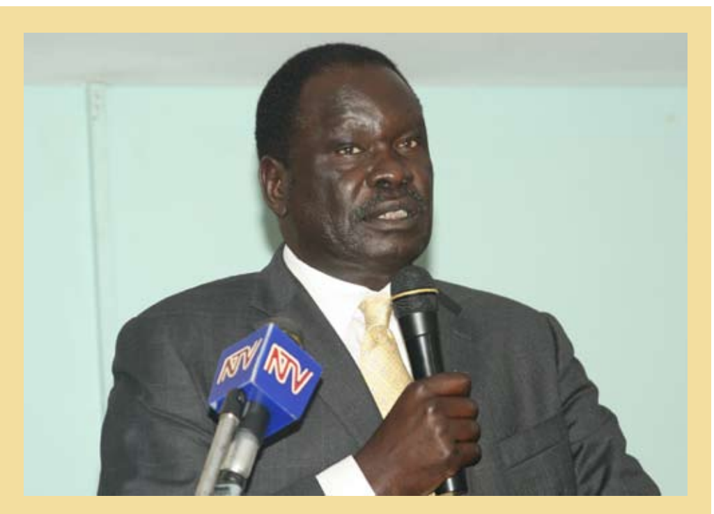
The Minister of Energy and Mineral Development Hon. Hilary Onek, delivers remarks at the Symposium.