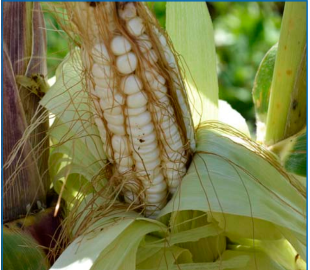
Maize production is predicted to fall by 20% on average, across the three countries by 2050