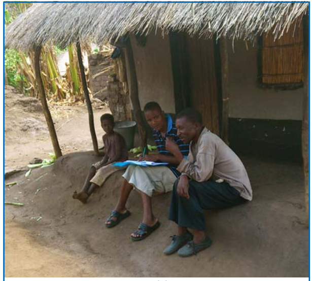
A Household Vulnerability Index was used to match families with adaptation strategies

The project also initiated the development of climate and agronomic databases by local meteorological offices and research stations, respectively, for wider use by stakeholders. Most of the data were transformed from analogue to digital, increasing access and sharing with other institutions.