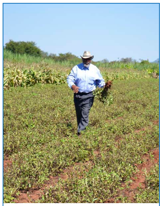
Researchers need to assess the costs and benefits of different adaptation options

The SECCAP project approach of linking biophysical assessments, livelihood assessments and economic assessments was replicated by FANRPAN, in conjunction with the Financial and Fiscal Commission of South Africa and the universities of Cape Town, Limpopo and Fort Hare, to develop a proposal on helping local municipalities in South Africa to better understand adaptation options for climate change. The proposal was awarded with a grant by Canada's International Development Research Centre (IDRC) and developed evidence which will be presented to the Finance Portfolio Committee of the Republic of South Africa for the 2015/16 financial year, and the Eastern Cape and Limpopo Province legislature.