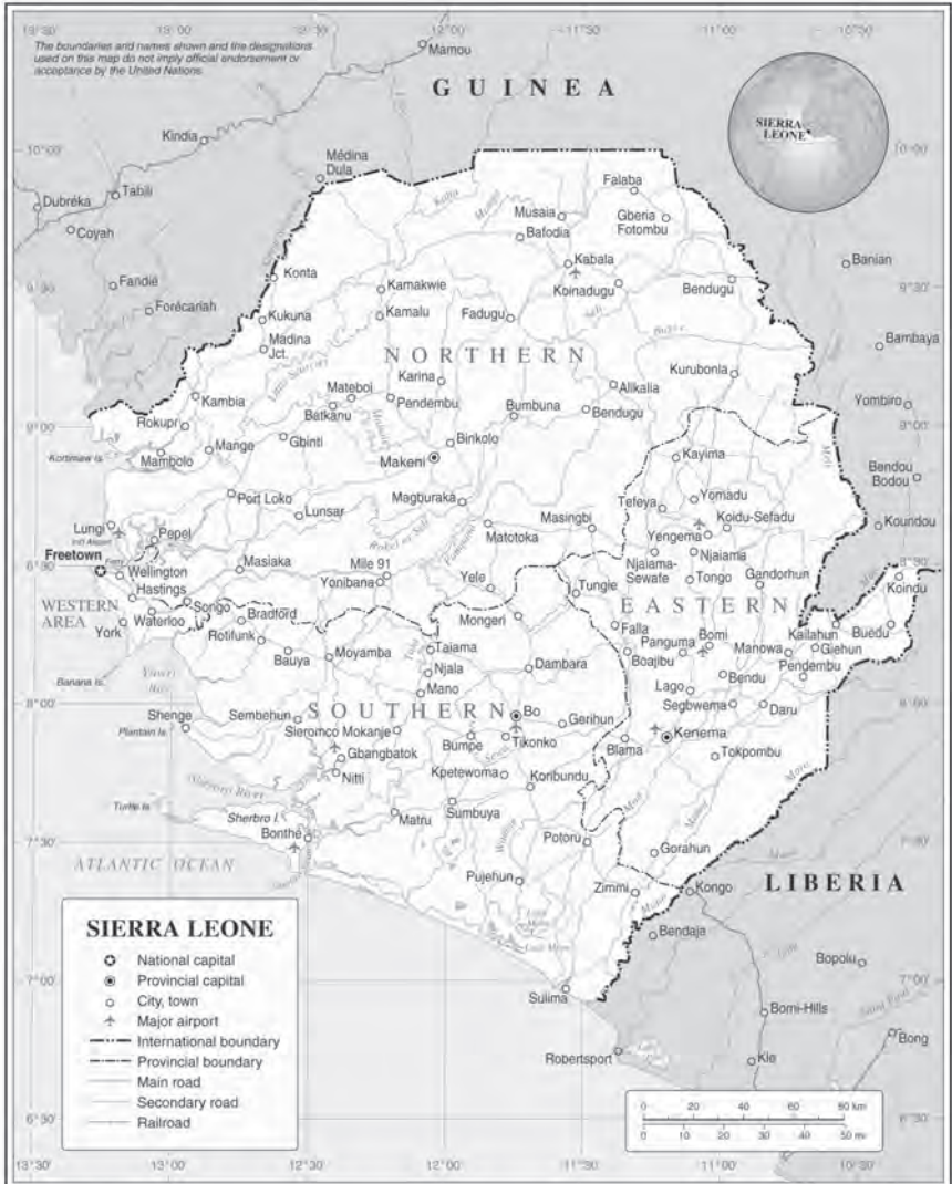
Map No. 3602 Rev. 5 UNITED NATIONS January 2004

Department for Peacekeeping Operations Geographic Section