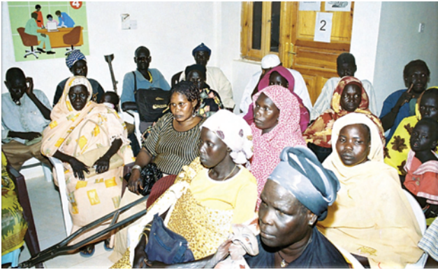
Photo 10 Registration of disabled in Sudan (sourced from Babiker's presentation)