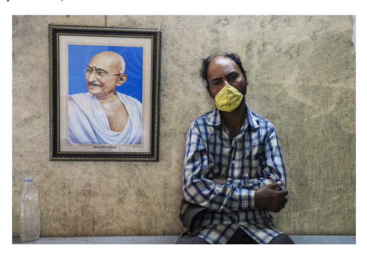
A homeless man wearing a facemask sits beside a portrait of Mahatma Gandhi at a shelter camp set up by Telangana State government during a 21-day government-imposed nationwide lockdown as a preventive measure against the COVID-19 coronavirus, in Hyderabad on April 7, 2020.

Unwittingly, the latest Coronavirus may have helped us to shift in that direction which, at its most pronounced, involves what might be termed "radical solidarity". We have, perhaps, seen the nascent beginnings of this in capital foregoing profits as a result of the pandemic, whether it be supermarket chains cutting certain supplies to enable local shopkeepers to stay afloat, banks restructuring debt finance, retailers mass discounting supplies or service providers making certain products available gratis (think here of the internet and the range of free, albeit time-limited, subscriptions now offered). This is solidarity in a more authentic use of the word, which connotes accepting the punitive consequences involved in settling the debt of others. Conjointly, the economy of solidarity kicks in, but whether it catches fire remains to be seen.