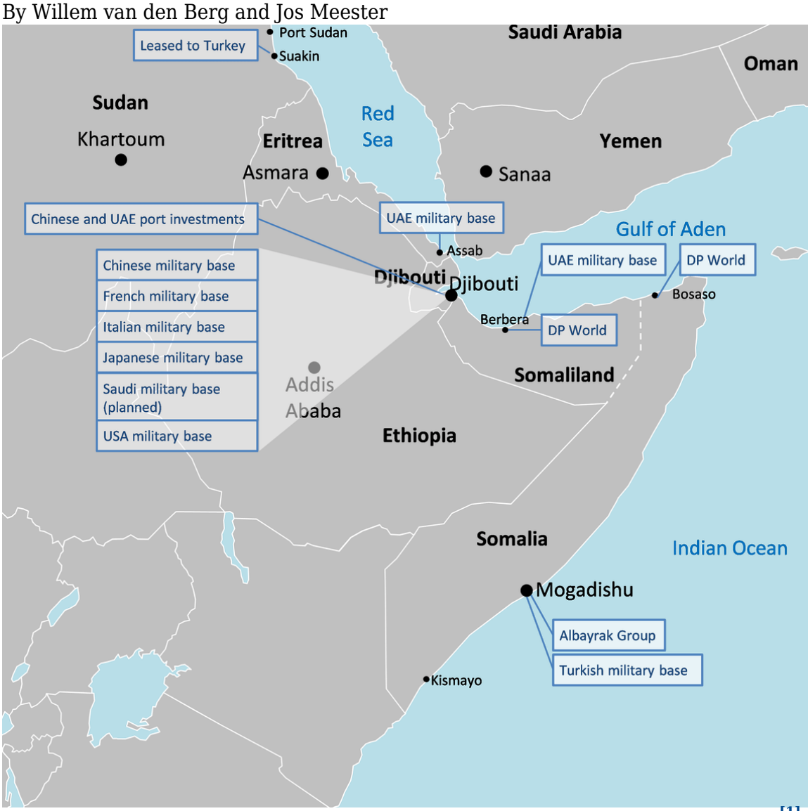
Figure 1: Map of the Horn of Africa with foreign military bases and port operators [1]

During the past decade, foreign countries have invested heavily into various ports in the Horn of Africa, often following their commercial deals with the opening of military bases next to those ports (for example China in Djibouti, the United Arab Emirates (UAE) in Berbera and Turkey in Mogadishu). This article looks at how the Horn's coastline has been transformed into an important strategic area – not only for maritime trade routes, but also due to its proximity to regional conflicts – and consequently has attracted a range of foreign powers. The influx of foreign actors, mixing commercial incentives with military deals, has led to the securitisation of the Horn's ports, the importing of foreign political cleavages, and has influenced intra-Horn politics.