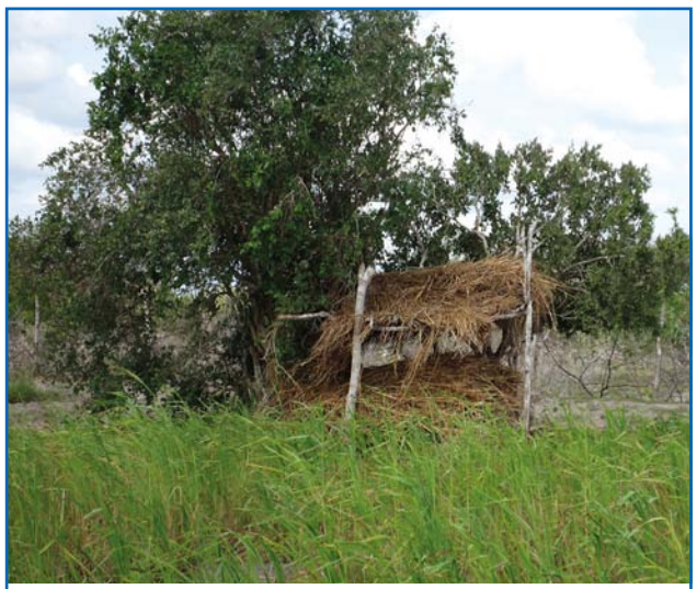
High quality pasture grasses, such as African fox tail grass, have been introduced

The issue of individual land ownership has since been discussed by farmers with the officials of Garissa county government during a project feedback workshop.