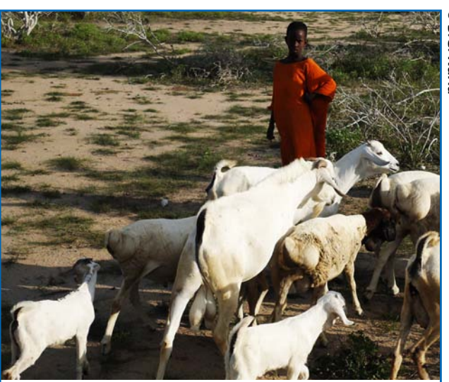
Farmers were trained to use a single breeding male at any one time in order to assess their performance