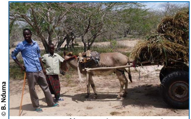
One acre of improved grass can produce 3.6 tons of feed per year

During a site visit to Trans Mara, Ijara farmers were convinced that the individual land ownership they witnessed was facilitating improved livestock and pasture management practices. They have since started lobbying for the same to be introduced in their area. The research team would like to investigate the difference in productivity and income levels between farmers rearing livestock on communally owned land and on privately owned plots. The data can help the county and national governments make informed decisions regarding the farmers' demand.