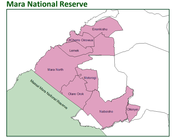
Figure 2: Conservancies adjacent to the Maasai