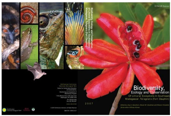
Figure 2: The Biodiversity book

Within each mining perimeter, Rio Tinto/QMM has set aside small protected areas to preserve the incredible biodiversity inherent to the forests. The conservation zones or 'enclaves' total 620ha (of 6 000ha being mined) and are widely referred to as 'ecotourism' destinations. In cooperation with Rio Tinto/QMM, BirdLife International (a corporate partner of Rio Tinto)<sup>8</sup> holds annual bird watching events in the Mandena conservation zone (230ha of 2 000ha being mined). Rio Tinto/QMM financed extensive scientific research into and inventories of the littoral forests; several conservation non-governmental organisations (NGOs) and biologists were commissioned to contribute to a major Rio Tinto/QMM publication on littoral forest biodiversity (see Figure 2 ). Informants made little distinction between the exploitation zone and the protected area, referring to the entire forest as inaccessible 'zone protégé', e.g. the term 'Mandena' (exploitation zone 1) was used to refer to both the protected area and the exploitation zone. Rio Tinto/QMM pledged to 'reforest' the area with eucalyptus plantations, an act mediated as 'integrated compensation' to local communities<sup>9</sup>.