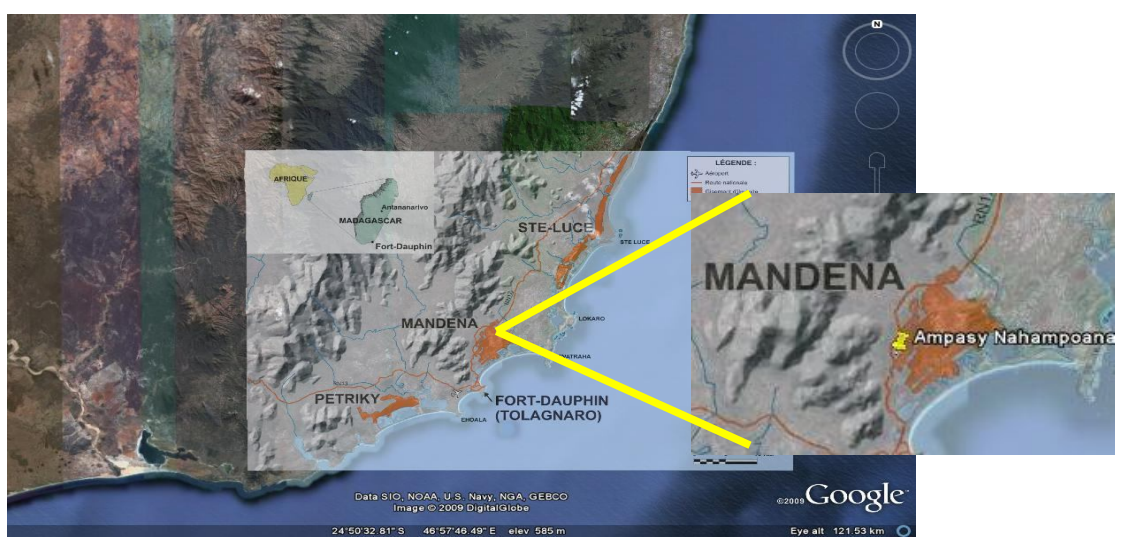
Figure 1: Overview of three mining sites: Petriky, Mandena, and St Luce*

* Mining areas highlighted with orange shading.