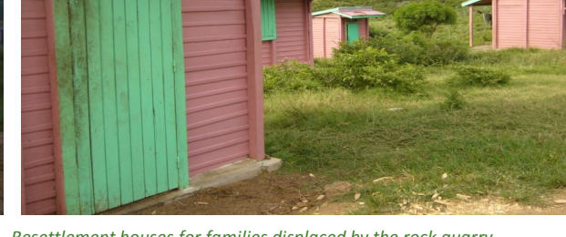
Ancestral mountain/rock quarry acquired by Rio Tinto/QMM, near Port Ehoala. Resettlement houses for families displaced by the rock quarry.