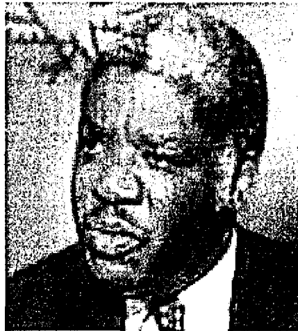
Zambian President Levy Mwanawasa