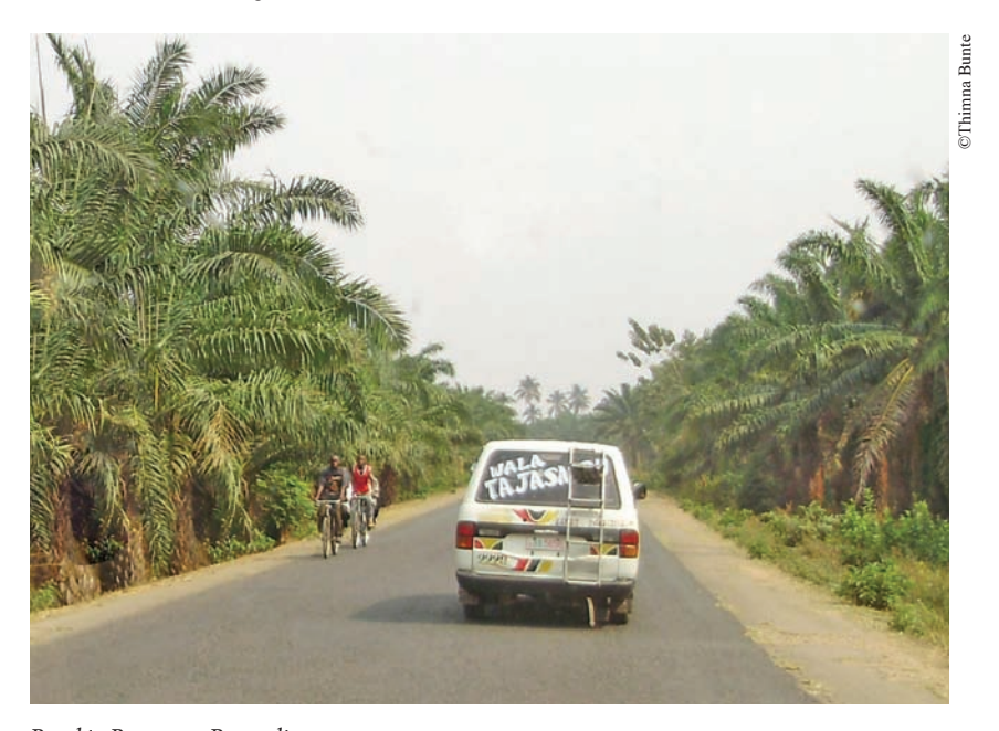
Road in Rumonge, Burundi

Of a population of more than 6.9 million people (CIA Factbook, 2009), the UNHCR counted around 281 592 Burundian refugees in bordering countries and around 100 000 IDPs in January 2009 (UNHCR, 2010). At the time of writing, an estimated 483 626 Burundians were part of the "population of concern" (UNHCR, 2010). In the case of Burundian refugees, predominantly two of the three solutions to a refugee crisis mentioned in the theory presentation above were common: integration in the country of asylum, and voluntary repatriation. They also experienced various elements of the emotional, political and economic challenges and dilemmas outlined above.