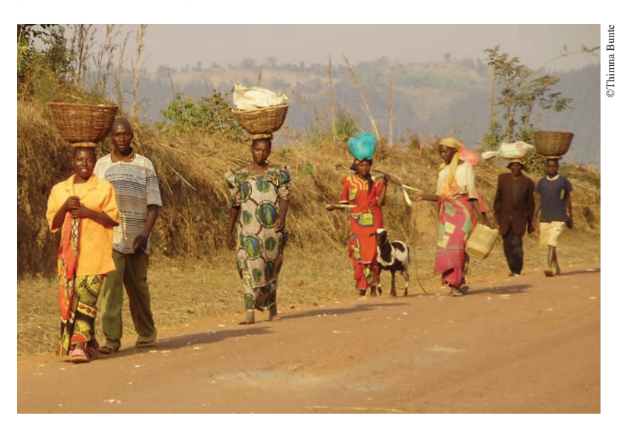
People on their way to the fields

influencing reconciliation can, furthermore, be linked to issues of "ethnicity; gender; social status; the time of return of the refugee; and the place of asylum" (Theron & Sachane, 2009). As one final dimension, reconciliation involves issues between the state and its citizens, both in terms of returnees and the local communities. This is due to the state and rebel movements both violating citizen's rights in various ways and promoting a culture of impunity. Hence, reconciliation and reintegration should not ignore the state dimension (Theron & Sachane, 2009).