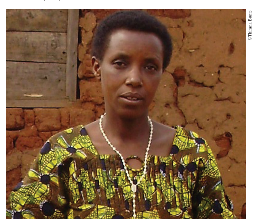
Returnee from Tanzania

There appears to be a lack of non-economic dimensions of reintegration in Burundi's reintegration processes. In a country marked by ethnic conflicts like Burundi, where social networks and trust in a democratic political system are essential for a peaceful future, it is disconcerting that no information can be found on the dimensions of social, emotional and political reintegration. This confirms the tendency to overemphasise the economic dimension of reintegration, as alluded to in the theory section. If the state and international actors ignore the social, emotional and political dimensions of reintegration, this can contribute to future challenges in terms of reintegration, reconciliation and security in the country. Nevertheless, where reintegration programmes were implemented, they often were successful. For instance, a UNHCR report in 2006 underlines the unproblematic integration of refugee children and youth into local schools – often the first school these children attend. Even in terms of educational development, reintegrated children do not seem to suffer any major backwardness in comparison to their fellow pupils, according to the UNHCR (2006).