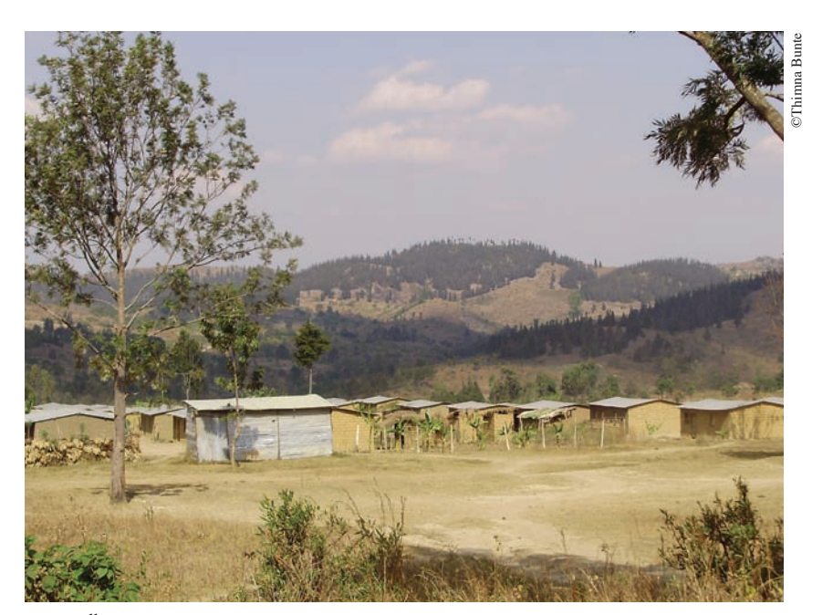
PeaceVillage - Butaganzwa