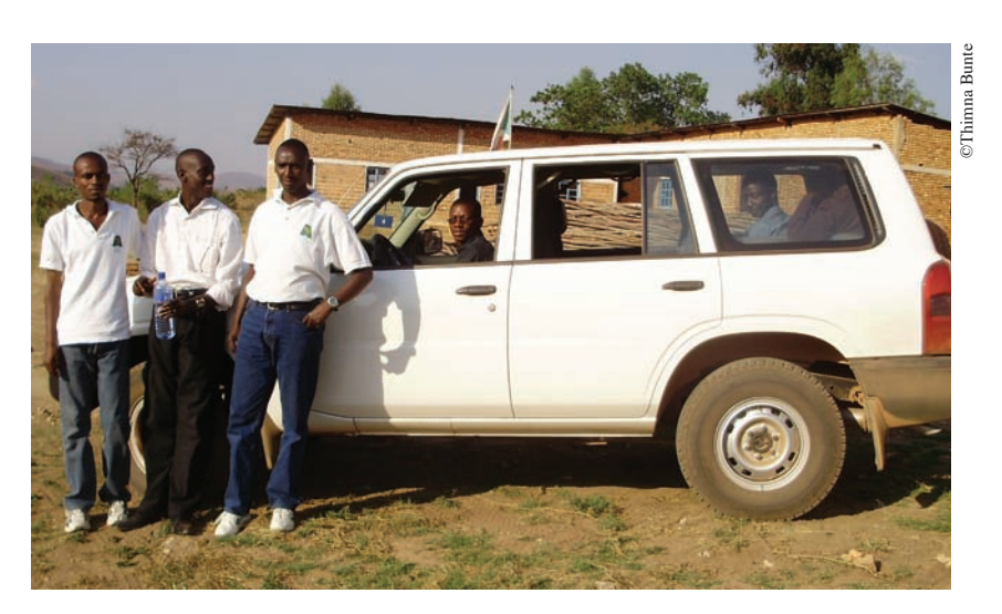
ACCORD's mediation team in Ruyigi

The first part highlights the multiple challenges that Burundi experiences in terms of the repatriation and reintegration of refugees, as well as reconciliation between different societal groups. It underlines the importance of land tenure for triple-R, while outlining critical structural factors — notably, shortage of land and fast population growth — that affect not only returnees, but the majority of Burundians. It finds that in the context of these challenges Burundi's state institutions — though involved in the repatriation process — lack resources and efficiency to address Burundi's various triple-R challenges adequately. Moreover, land disputes are not appropriately resolved, due to overlapping and problematic traditional and legal regulations as well as conflict resolution institutions that lack capacity and efficiency.