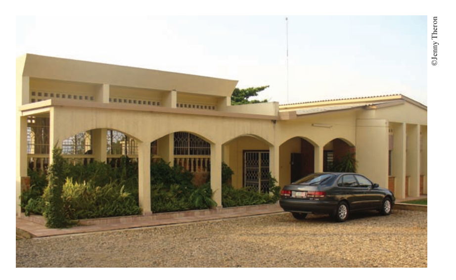
ACCORD Office in Bujumbura, Burundi

The African Centre for the Constructive Resolution of Disputes (ACCORD) has been active in Burundi since 1995, playing a second-track diplomacy role in the Arusha peace negotiations that led to the Arusha Peace and Reconciliation Agreement for Burundi in 2000. As a third party advocating the inclusion of civil society in the peace process, it subsequently engaged in the promotion of peace, reconciliation and effective governance as well as the facilitation of a National Dialogue on Mechanisms for Transitional Justice. In November 2004, ACCORD established its Legal Aid Clinic Project, supported by the United Nations High Commissioner for Refugees (UNHCR). The objective of the Legal Aid Clinic Project is to "provide the local population, and specifically the returning refugees, with assistance to deal with the challenges faced by both the welcoming communities and the returnees in the repatriation process" (Theron and Sachane, 2009:5).