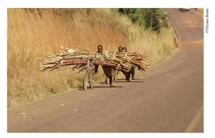
Men carrying sugar cane

In 2000, the Arusha Agreement recognised the challenges related to land and property issues, and the importance of addressing these issues for conflict resolution (Jooma, 2005). Protocol IV, Article 8 of the Agreement emphasises that all refugees and victims should be granted the right to recoup their land and property and, in cases where this is impossible, receive appropriate and fair compensation and indemnification (Van Leeuwen, 2007; CPCP, 2008). This includes the possibility of the distribution of state-owned land to returnees and victims. In order to facilitate these processes, a sub-commission was to be established under the Commission Nationale de Réhabilitation des Sinistrés (National Commission of Rehabilitation of Victims of War) (CNRS), responsible for the examination of land issues and disputes and possibilities of the redistribution of land (Jooma, 2005).