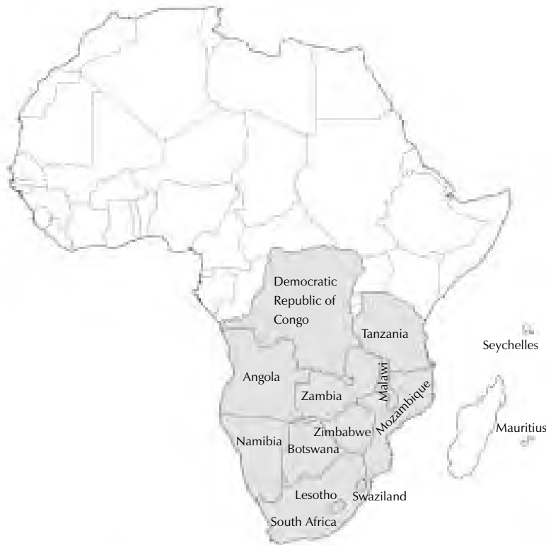
Figure 1: The member states of SADC

Note: Seychelles withdrew from SADC membership in August 2003.