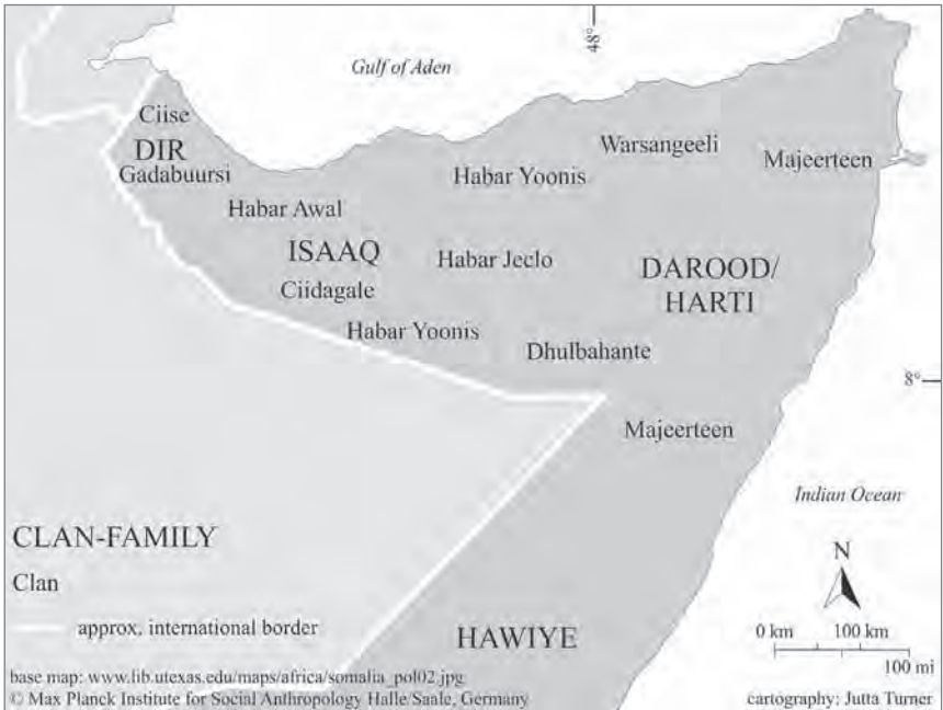
Map 2 Clan territories in northern Somalia