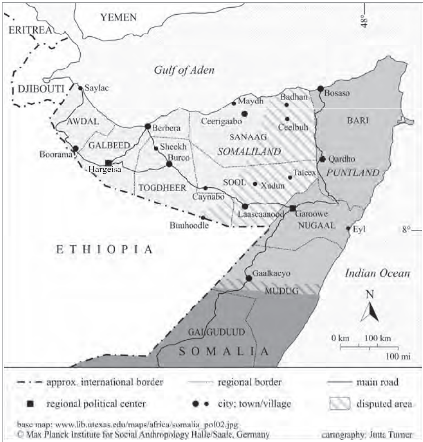
Map 1 Political divisions in northern Somalia since 1991