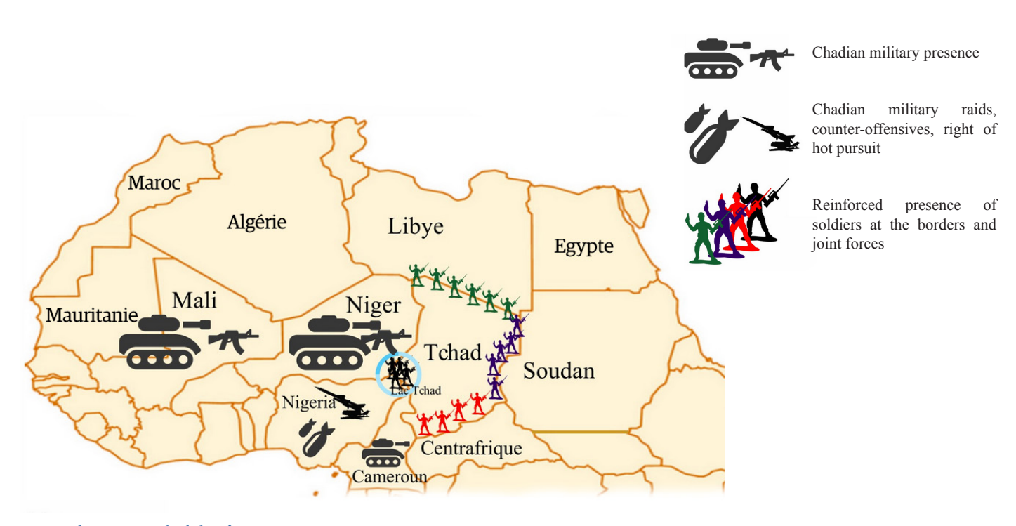
Map 4: Deploying Chad's military

If Chad's economy continues to be swallowed up by the war effort that the country is leading intensively, will the semblance of social peace that Chad is experiencing now be sustained? The country is certainly surrounded by tension and conflict zones, but can it sustain a population explosion by expanding only as a military power?