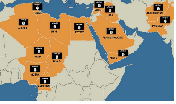
Map 1: The presence of Daesh worldwide