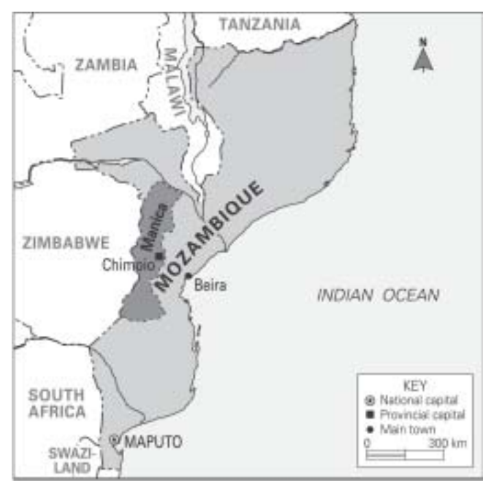
Figure1: Map showing location of Manica Province