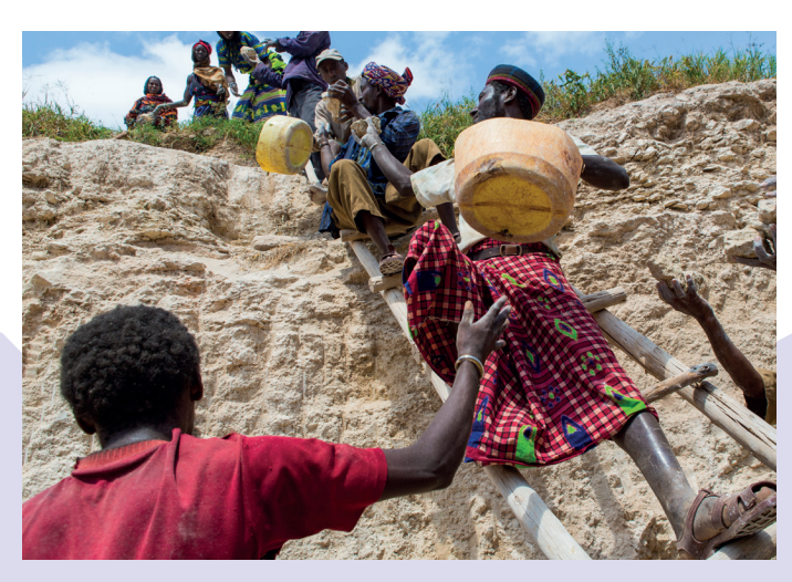
People with disabilities – whether these disabilities are visible or not – encounter physical, financial and social barriers when collecting water

Disabled individuals often resort to paying someone to carry or buy water for them which puts an extra financial burden on already resource-constrained households. Disabled women often experience particular difficulties. The Malawi study reports that disabled men have water fetched for them, often by their wives, but it is rare for someone to collect water for disabled women.