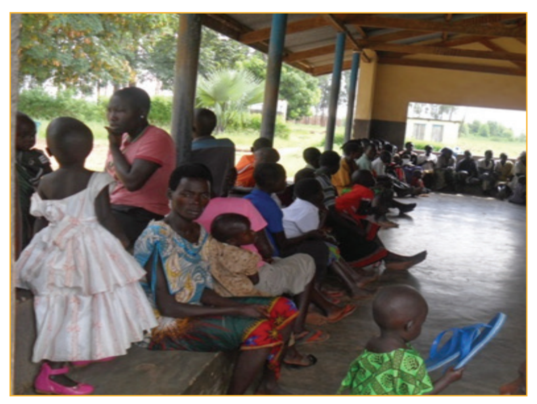
A long queue found at one of the health facilities in Maracha district before the health workers' dialogue was conducted.

". . . you leave home very early in the morning going to health centre X, so that you do not get hungry by waiting. But when you reach there, you wait or even sleep then wake up and wait again. When it reaches 10:00 am, then the health workers come and start working. By this time, the line is too long and you are tired. Then, in-between 1:00 pm and 2:00 pm, the health workers stop working . . . " (2014 Baseline study in-depth interview in Buhweju district)