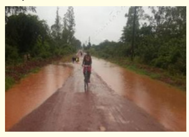
Figure 2: Apac-Inomo road cut off by heavy rain, Apac Subcounty

The district has a road network of 1,538.2 km. Generally, the condition of district roads has improved over the last two years with support through the Peace and Recovery Development Plan (PRDP), DLSP, Danish International Development Agency (DANIDA)/Research Triangle Institute (RTI) and Uganda Road Fund (URF).