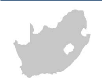
SOUTH AFRICA HAS FACED CRITICISM OVER THE LACK OF CONSISTENCY IN ITS FOREIGN POLICY

South Africa has also faced criticism over the lack of consistency in its foreign policy. <sup>39</sup> According to Hengari, South Africa has 'flip-flopped when it comes to a consistent message that speaks to the values ... that underpin its constitution and the draft White Paper on foreign policy, namely democracy, human rights and good governance'. <sup>40</sup> South Africa is therefore constrained not only because of concerns over its hegemonic role, but also because of its 'flip-flop' diplomacy.