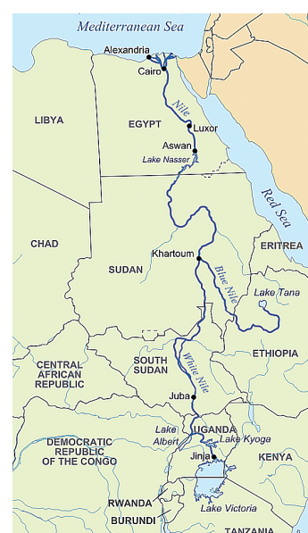
THE NILE RIVER BASIN

These gaps have to be addressed if the AU is to continue playing an instrumental role in the prevention and resolution of disputes over transboundary watercourses.