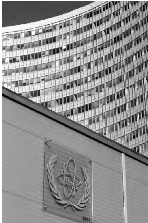
The International Atomic Energy Agency in Vienna