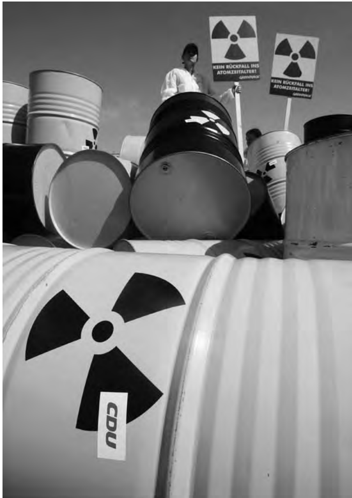
Nuclear Waste