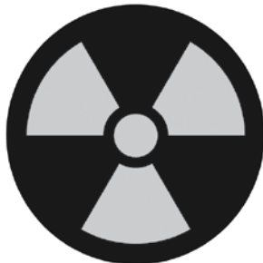
International Symbol for Radiation