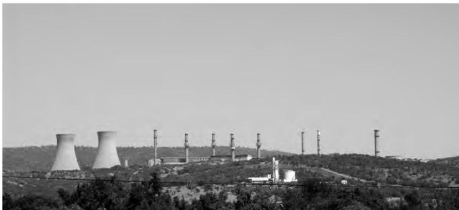
The Pelindaba Nuclear Research Facility, Pretoria, South Africa

In witness whereof the undersigned, being duly authorized by their Governments, have signed this Treaty.