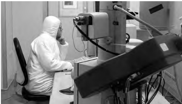
A Nuclear Research Laboratory