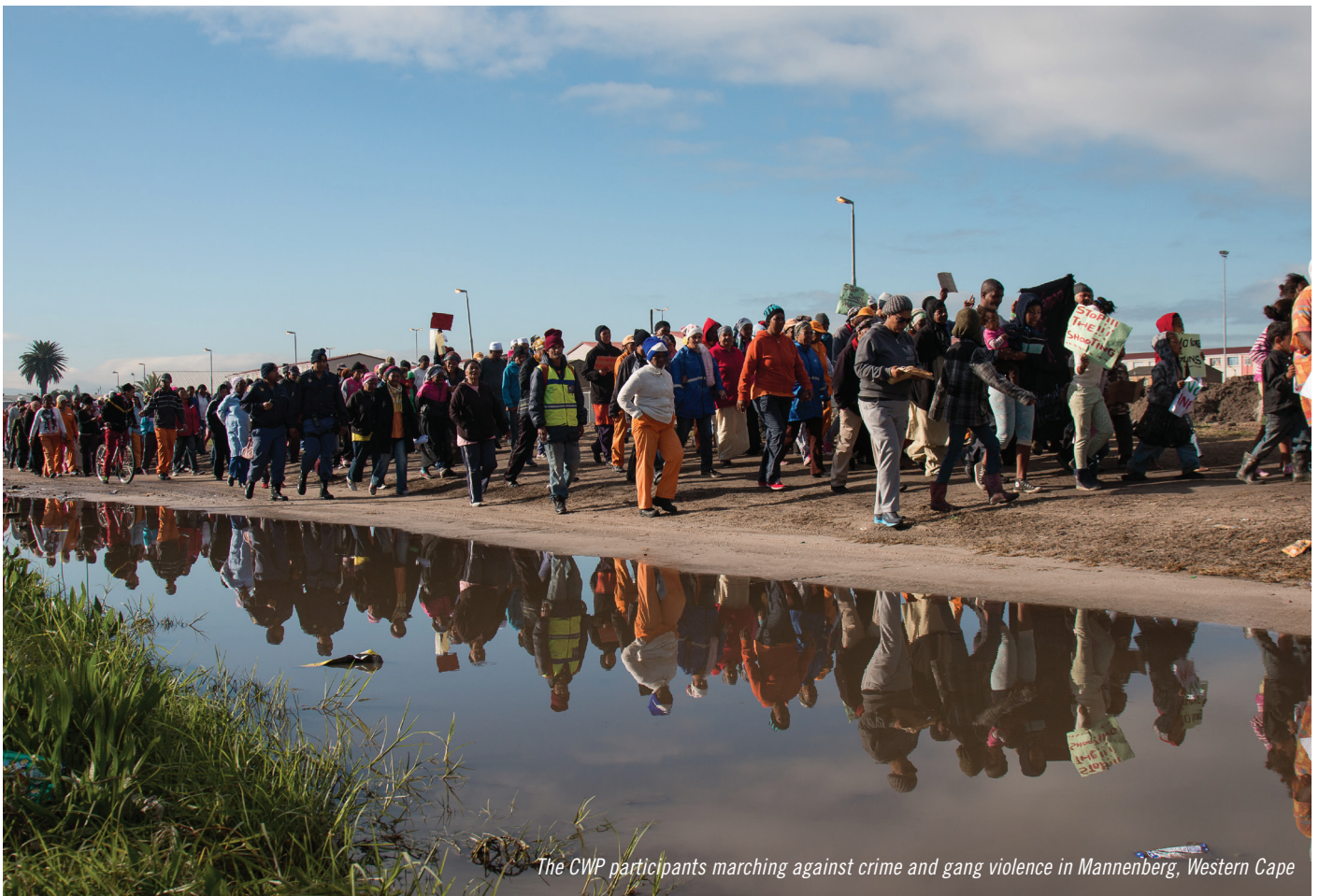
The CWP participants marching against crime and gang violence in Mannenberg, Western Cape

In South Africa, it is estimated that close to 6000 offenders are released from various correctional facilities each month, either through parole or due to expiry of their sentence vii . It is hoped that upon their release many will not re-engage in criminal activities viii . However, due to lack of dedicated interventions aimed at facilitating their reintegration, many ex-offenders re-offend and return to correctional service centres. Currently, there are no reliable statistics on recidivism in South Africa, but it is estimated to be high ix . Nongovernmental organizations (NGOs) such as the National Institute of Crime Prevention and Reintegration of Offenders (NICRO), Khulisa and others work hard to support ex-offenders to readjust and reintegrate into society, but their reach is limited. The major challenge facing ex-offenders in South Africa is a lack of employment opportunities due in part to the stigma of being ex-offenders. Creating job opportunities for ex-offenders may be an effective strategy to ensure that they do not reoffend x . VIOLENCE PREVENTION INITIATIVES