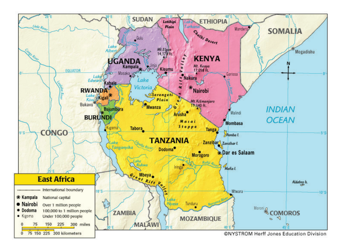
Map 1: Map of the EAC