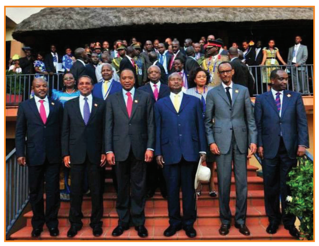
Political will is the cornerstone of successful regional integration

The two protocols–on the customs union and common market–are aimed at enhancing intra-EAC trade and investment, freedoms of socioeconomic operations, and increased interactions among East Africans through uninterrupted movements, settlements, residence, employment, and professional engagements.<sup>17</sup> Despite debate about the legitimacy of the EAC as an intergovernmental agency charged with undertaking substantive operations and functions that would be ordinarily undertaken by sovereign states, and with important implications for the lives of East African citizens<sup>18</sup>, the EAC has demonstrated great promise in terms of institutionalisation and operations.