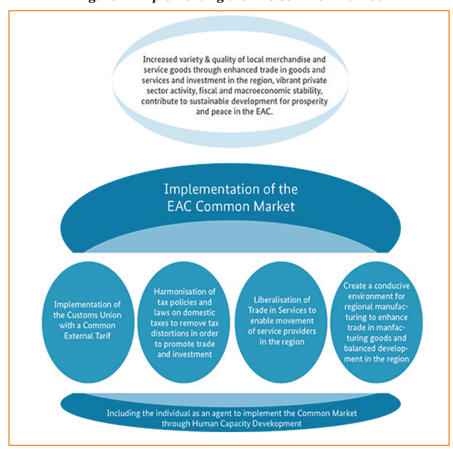
Figure 4: Implementing the EAC Common Market

Rwanda total trade with EAC increased by 12.5% from US$ 497 million in 2009 to US$ 796 million in 2013. On average Exports to the region increased from US$ 47.4 million in 2009 to US$ 380.3 million in 2013, while Imports decreased from US$ 449.6 million in 2009 to US$ 415.4 million in 2013. In the same period (2009 – 2013), Tanzania was the main destination of Rwanda Exports to the region while Uganda continued to be the main origin of imports of Rwanda from the region followed by Kenya.<sup>31</sup>