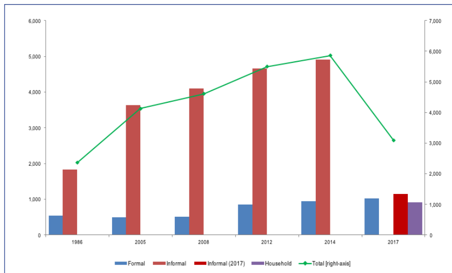
Figure 4.1: Employment trends in Zambia