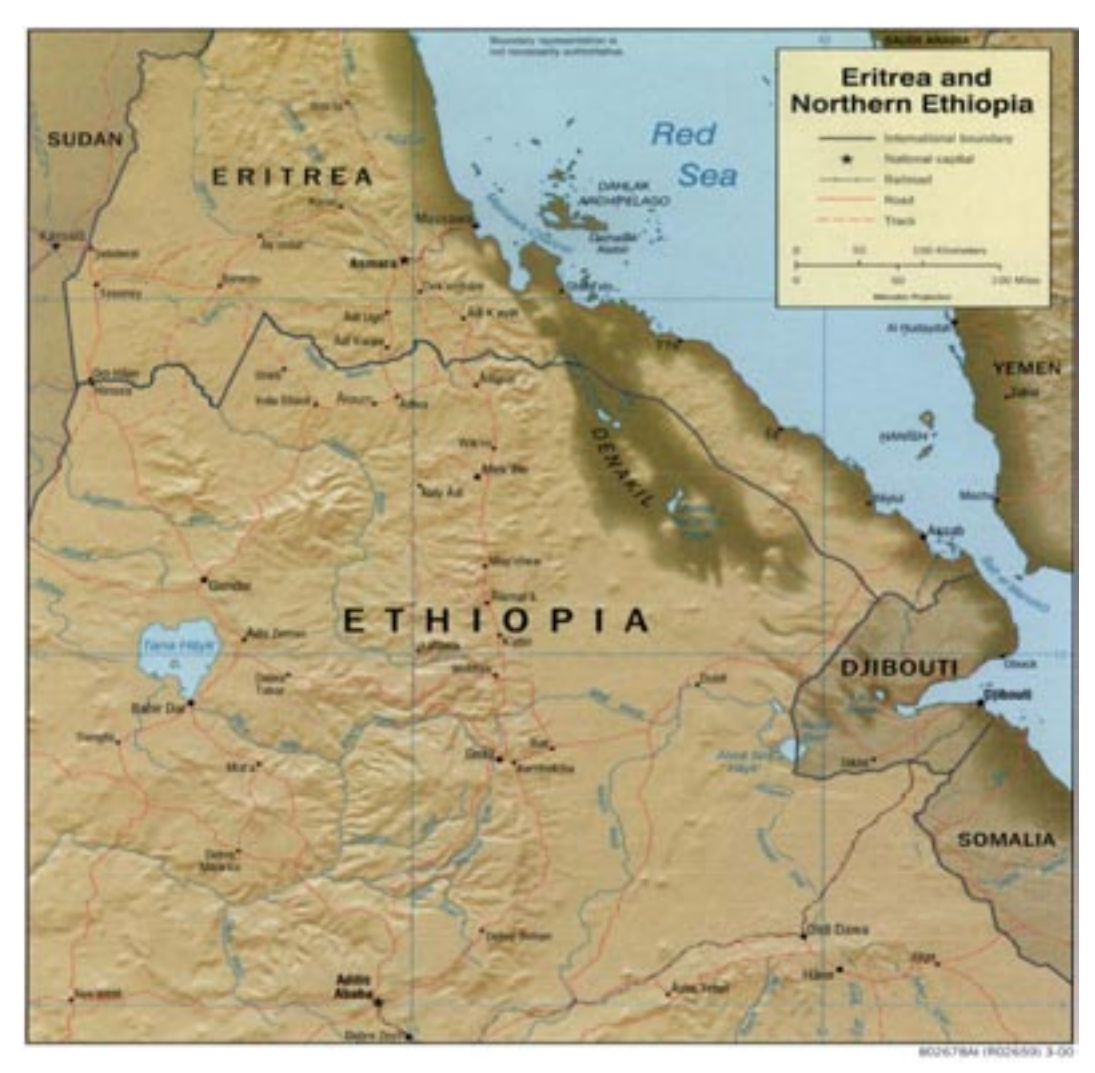
Map 1 Eritrea and northern Ethiopia

as a regional transshipment hub, and its expanding port capacity could further speed up regional trade. With Ethiopia routing all its import and export traffic to Djibouti, Eritrea lost hundreds of millions of dollars in annual revenue, revenue which is clearly non-recoverable, and the future does not seem promising either. Even if the relationship between Eritrea and Ethiopia improves and Ethiopia starts using the ports of Assab and Massawa which it had exclusively used before 1998 (around 3 million tonnes per year of cargo traffic), the competition between the ports of Eritrea and Djibouti is going to be intense and could easily deteriorate into a never-ending conflict. 11