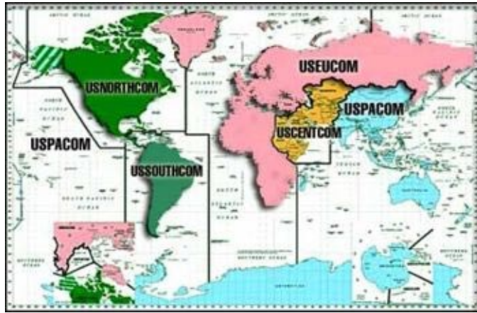
The Geographic Unified Commands as of January 2007

opportunity. Those elements of security, in turn, have a symbiotic relationship with such things as health and education. If a secure and stable Africa is in U.S. national interest, then the U.S. would need to take a holistic approach to addressing the challenge. Additionally, in the new, more volatile, fluid and unpredictable global security environment, the old adage about an ounce of prevention being worth a pound of cure does not simply make sense from a resource perspective but also from a risk mitigation and management perspective.