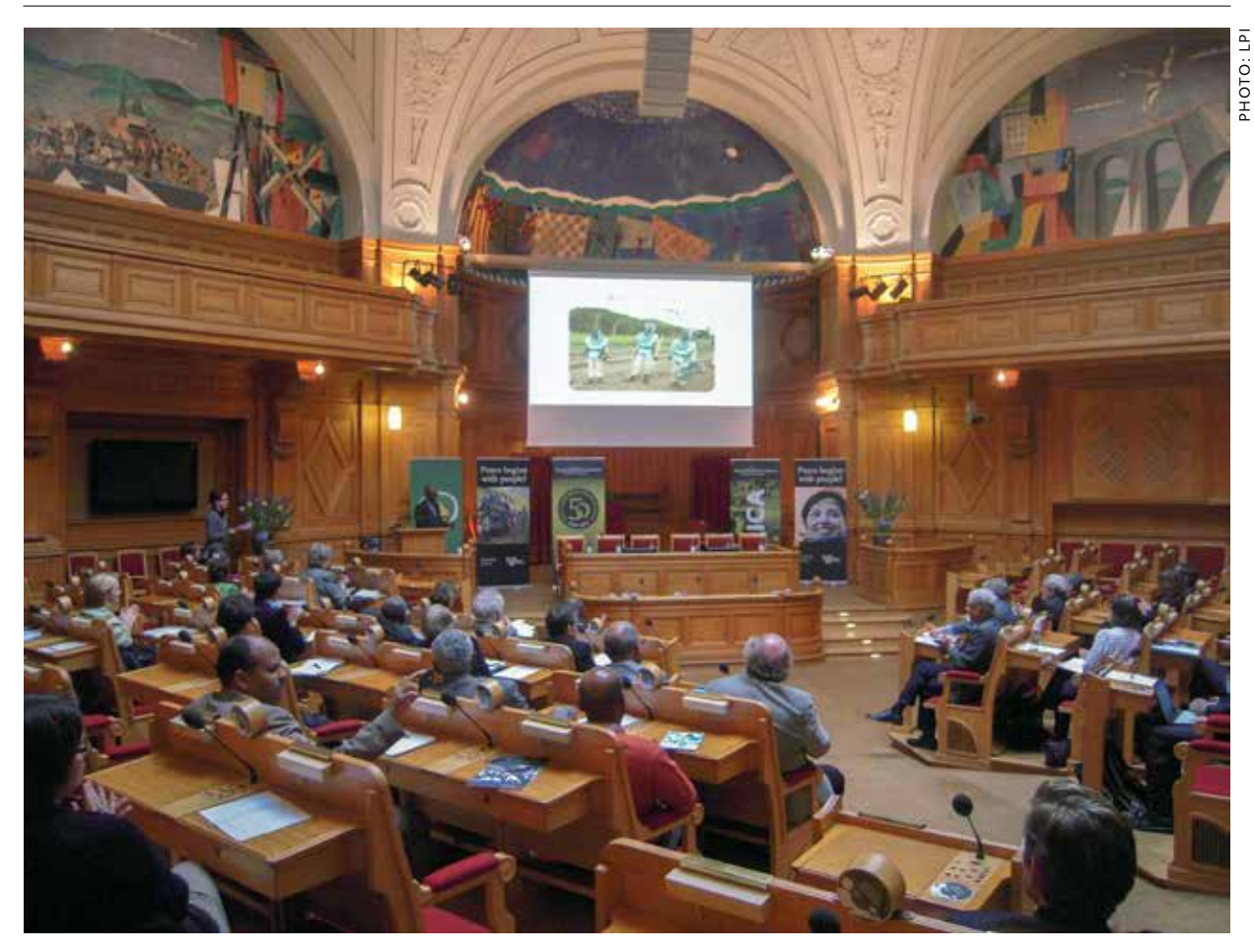
Seminar 4 was held in the First Chamber Hall of the Swedish Parliament and attracted a diverse and broad-based audience. It was arranged by LPI and NAI in co-operation with the Swedish Green Party.